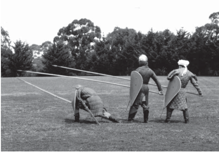
Figure 3 The front two hoplitai of the formation, reinforced in front with a menauliatos , braced to resist cavalry. Based upon Praecepta Militaria

the forefront of the formation to resist cavalry attack, and at other times they were a reserve force sent to reinforce or support other troops where needed. Praecepta Militaria says that the shields of the menauliatoi should be smaller than those of the hoplitai but does not specify their shape. 10 A round shield in the range indicated by the pictorial sources and Sylloge Tacticorum would be highly suitable for the lighter and more flexible role the menauliatoi were to perform (see the menauliatos , Figs. 3 and 4). Note especially in Fig. 3 how the 76 cm round shield covers the menauliatos neatly when the man is braced