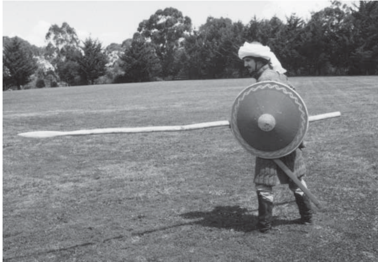
Figure 4 A menauliatos in skirmishing mode

to resist cavalry with the butt of the menaulion grounded in the manner described for the formation of the foullkon , 11 whereas a 90 cm teardrop shield would come into contact with the ground.