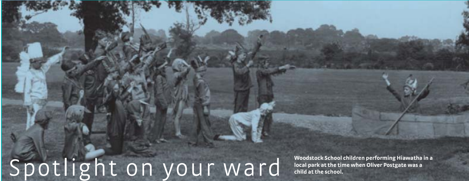
Woodstock School children performing Hiawatha in a local park at the time when Oliver Postgate was a child at the school.