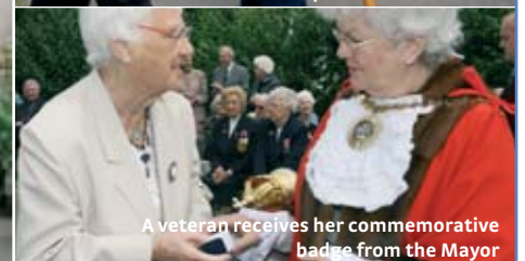
A veteran receives her commemorative badge from the Mayor