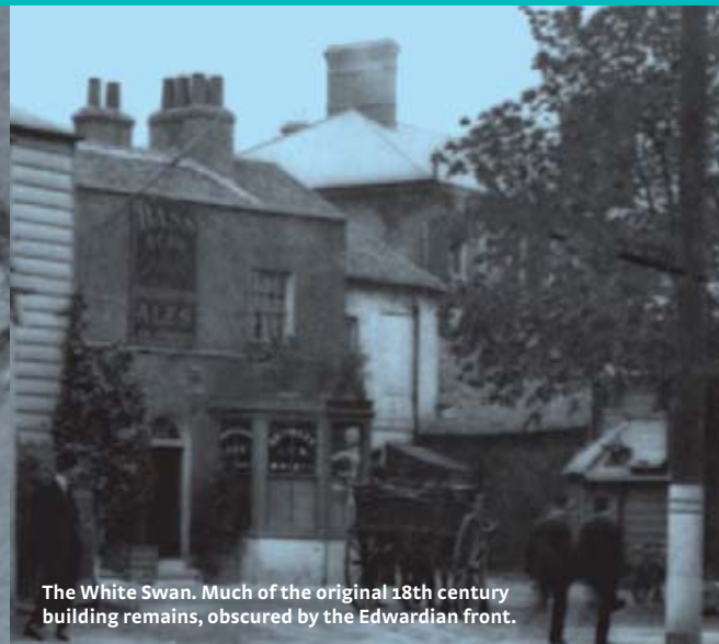
The White Swan. Much of the original 18th century building remains, obscured by the Edwardian front.