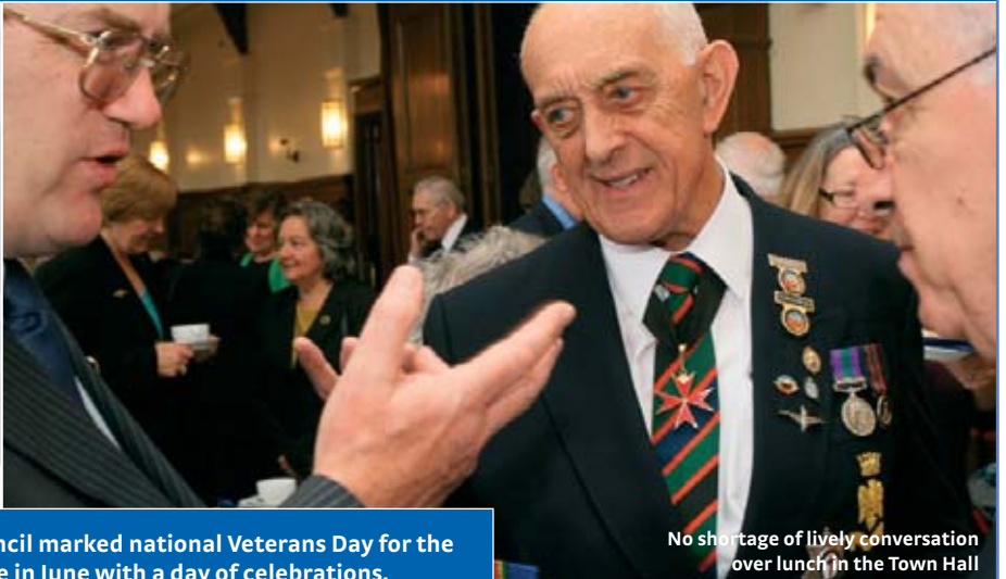
No shortage of lively conversation over lunch in the Town Hall

The council marked national Veterans Day for the first time in June with a day of celebrations.