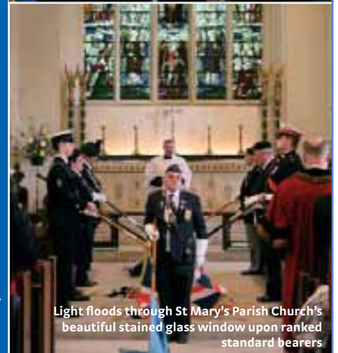
Light floods through St Mary's Parish Church's beautiful stained glass window upon ranked standard bearers

Finally the Mayor held a luncheon reception at Hendon Town Hall, where old friendships were rekindled and new friendships forged.