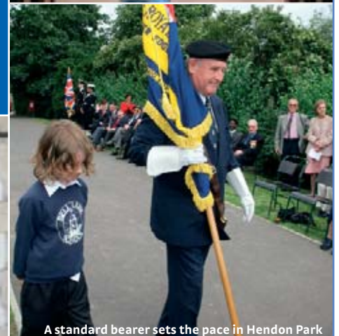
A standard bearer sets the pace in Hendon Park