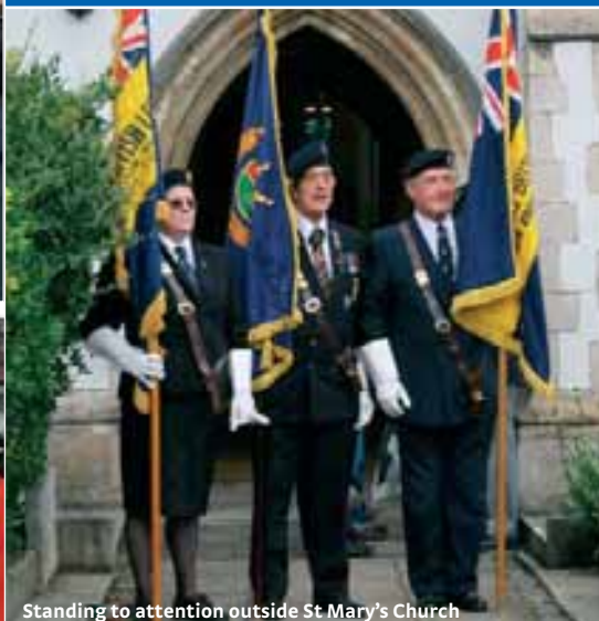
Standing to attention outside St Mary's Church