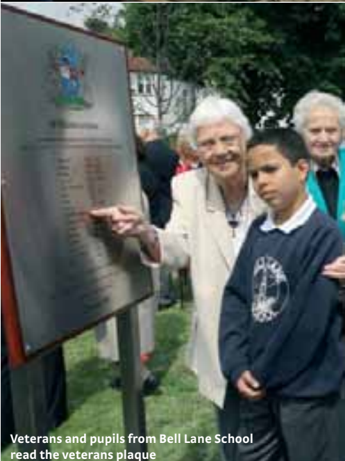
Reliving memories of VE Day