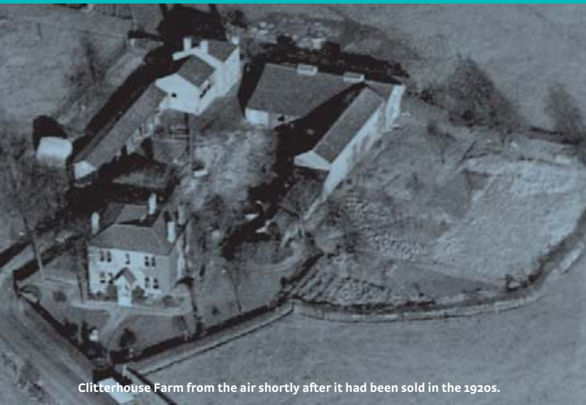
Clitterhouse Farm from the air shortly after it had been sold in the 1920s.