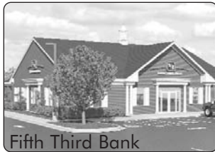
Fifth Third Bank

The following items are currently under review by the Department of Planning: