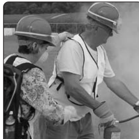
During a disaster, residents may be called on to respond. CERT trains people to help people.

Class topics include the following: disaster