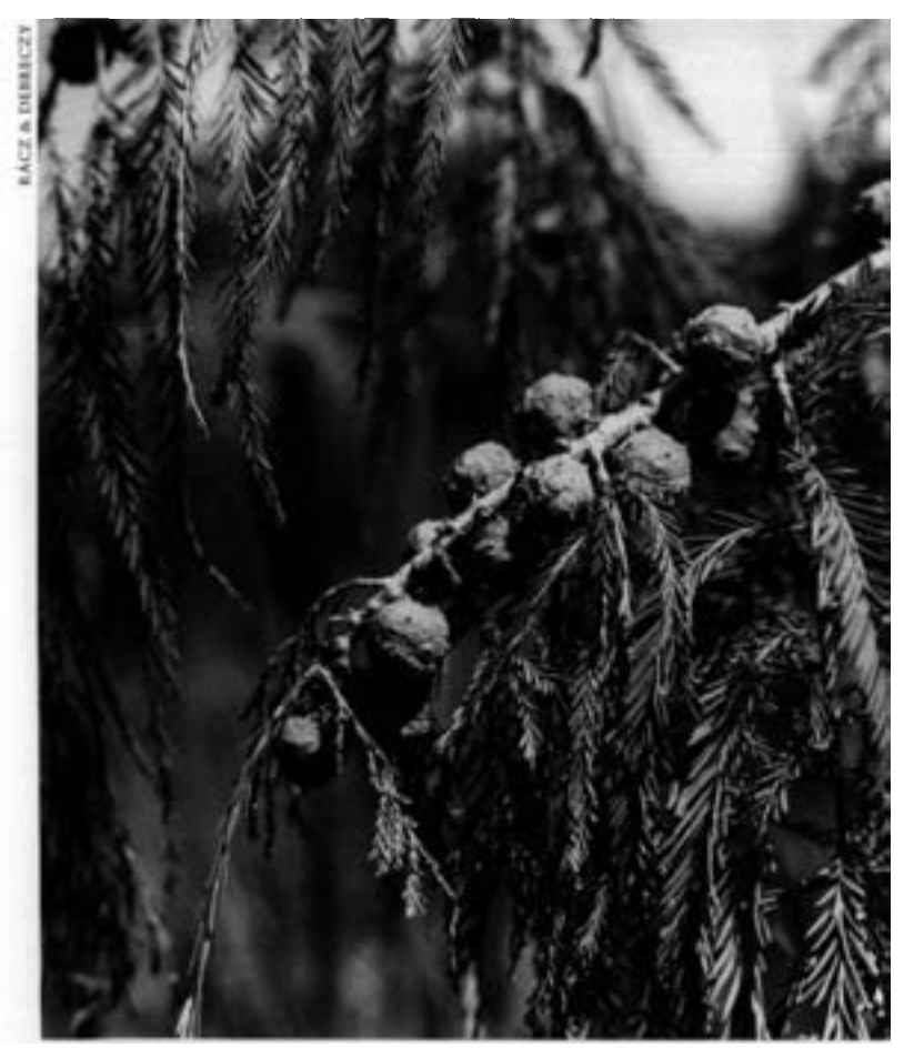
Some characteristics of Taxodium mucronatum are strongly influenced by climate. The compound leaves are semipersistent the foliage of the previous year detaches only when the new leaves unfold The southern species is less cold-hardy than its northern cousin, especially in sudden frosts. When cultivated in areas where the winter temperatures fall below freezing, most of the green foliage becomes yellowish brown and falls, even on the trees of Tule.

Estimates, to be correct, should consider the tree's rate of growth, but in the case of the Tule