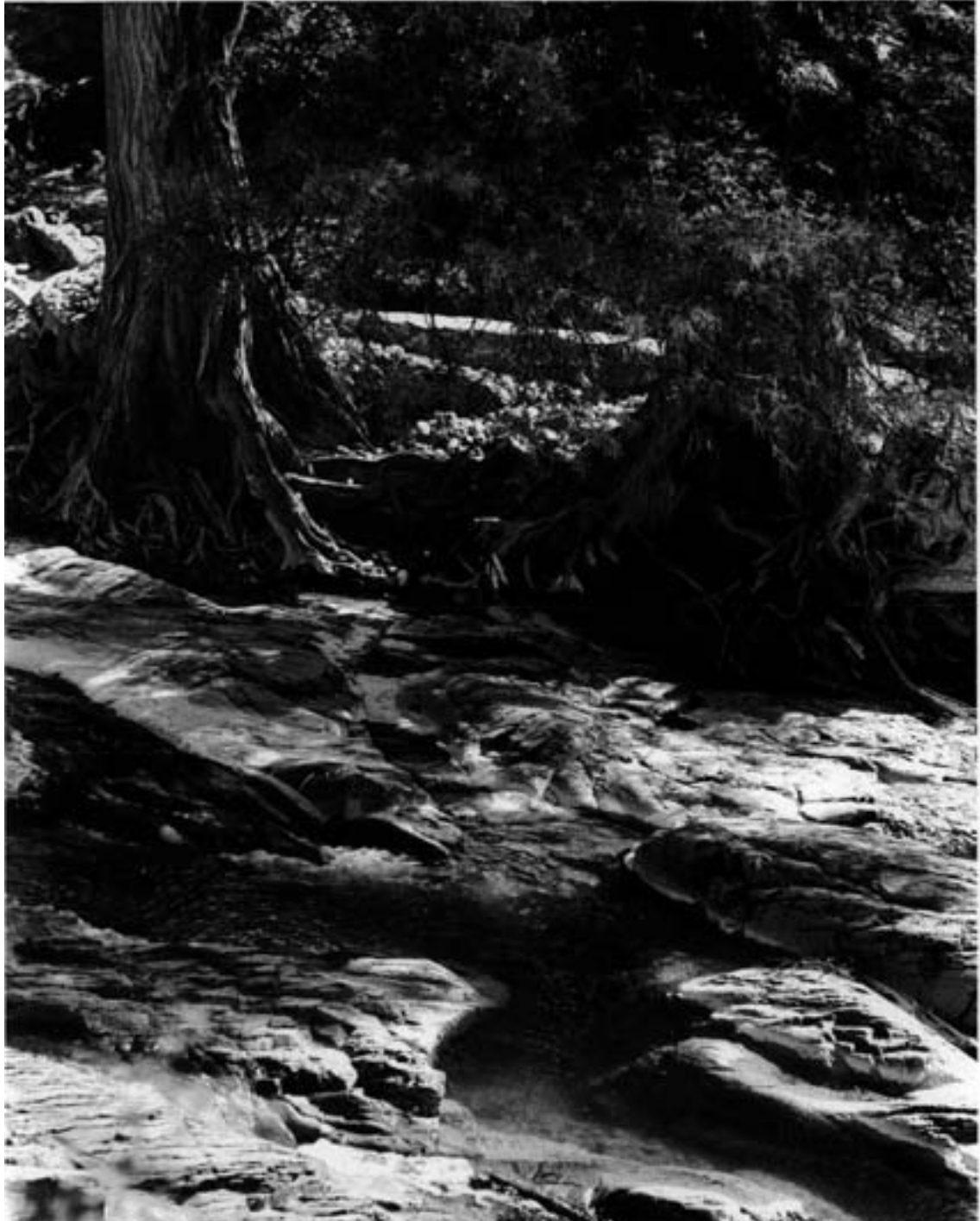
Ahuehuete gallery forest near Sola de Vega, Oaxaca Note the root system weaving a protective lattice on the riverbank. Instead of adaptation to anaerobic swamps, Taxodium mucronatum is adapted to periodically high riverbeds and riversides. The fantastic root systems grasp the riversides, fencing the riverbed with such efficiency they seem to be created for that purpose. At Sola de Vega, the most beautiful riverbed habitat of the species is still untouched, providing dramatic views of trees 12 to 15 meters (40 to 50 feet) tall.