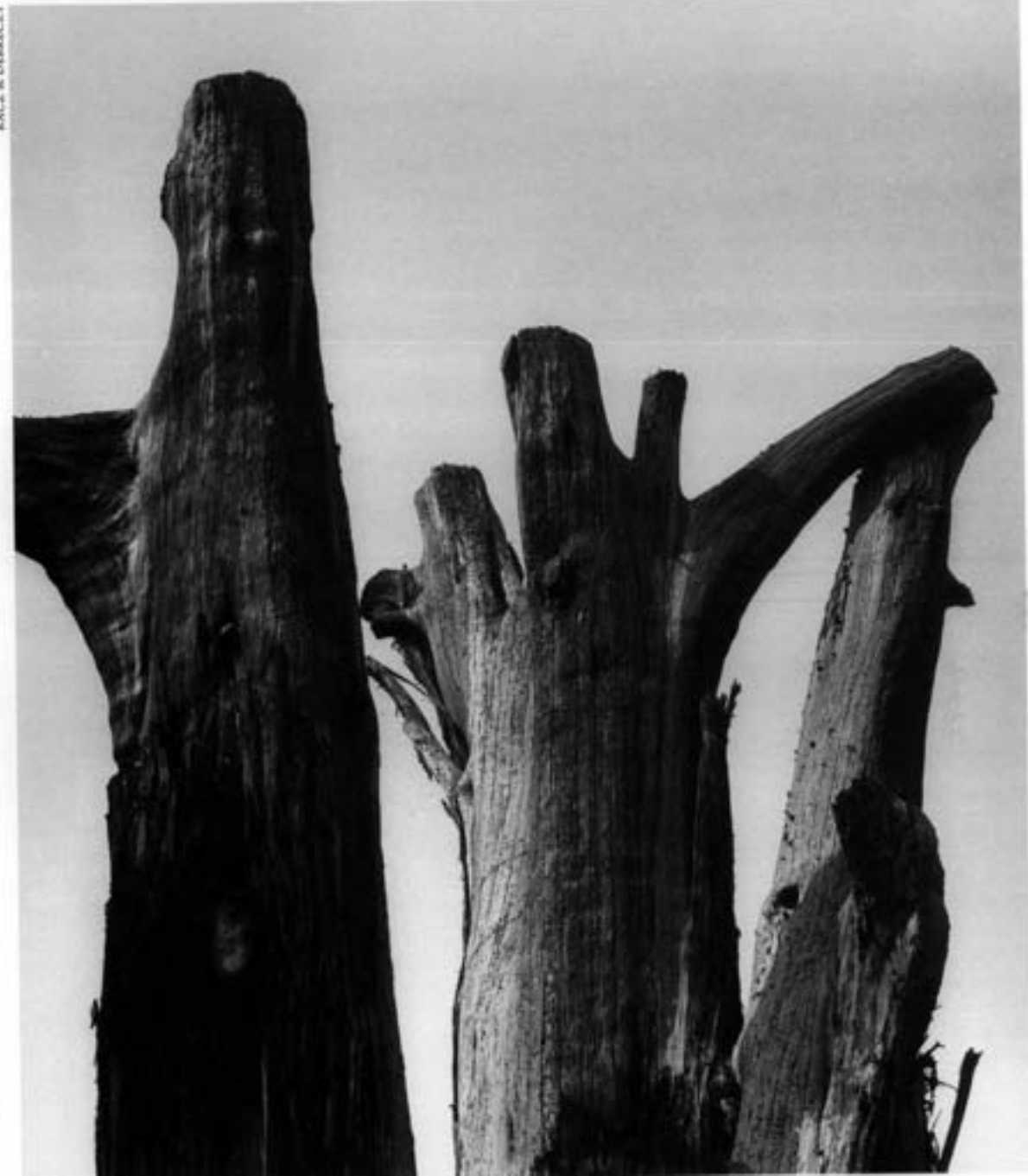
A treasure of Chapultepec Park, the once beautiful giant, El Sargento (or El Centinela), died in the 1970s. Like most of the massive bald cypresses that witnessed the fall of the Aztec empire, it succumbed to the rapidly changing environment in and around Mexico City. The species—Taxodium mucronatum, the Mexican, or Montezuma, bald cypress— was voted National Tree of Mexico during the celebration of the centenary of independence in 1910