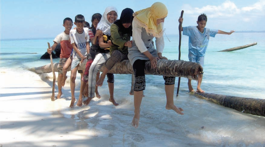
Just one of many islands!