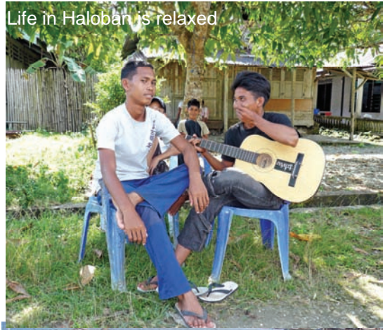
Life in Haloban is relaxed

Desa P. Balai and P. Baguk are both located on the small island of Pulau Balai. It is the administrative and commercial center for Pulau Banyak and the main entry point for visitors. Almost 3.000 people live here. The local language is Jamee. These two villages were very heavily damaged by Tsunami in 2004 and the earthquake 3 months later. The island sank