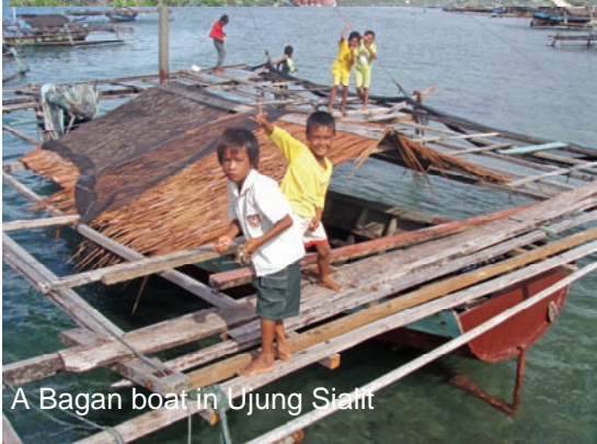
A Bagan boat in Ujung Sialit