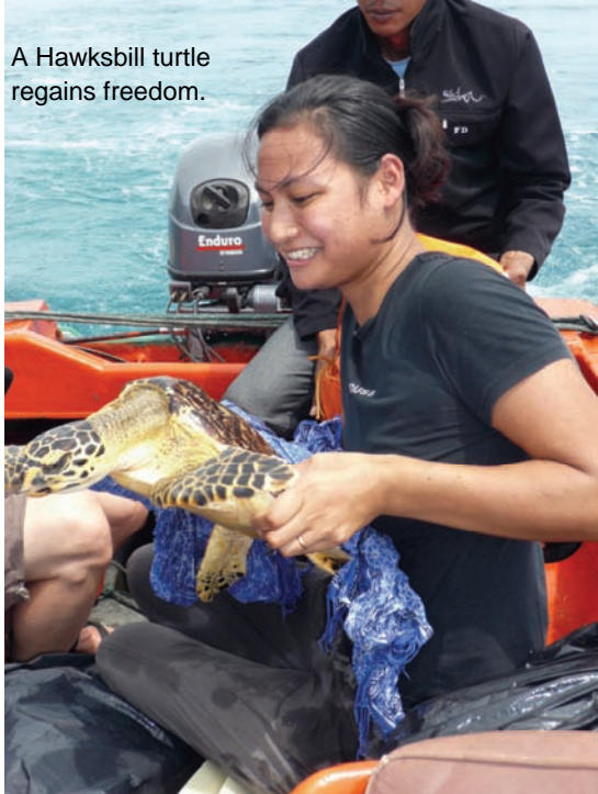
The emergency patrol boat