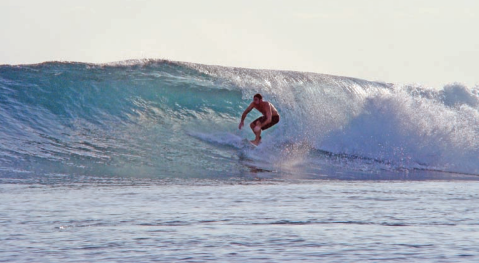
Surfing at Ujung Lolok