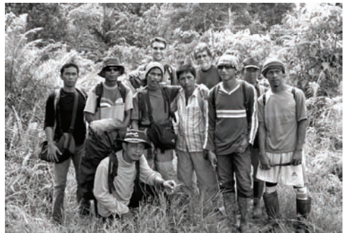
Green Tuangku guides and their guests

Contact the YPB supported community group Green Tuangku in Haloban. Ph: 081260416669 (Irmansah) and 081265609854 (Dahrinsah). Price per day is app. 200-250.000 per day depending on length. Price includes park permit, food, water, tent & sleeping mat.