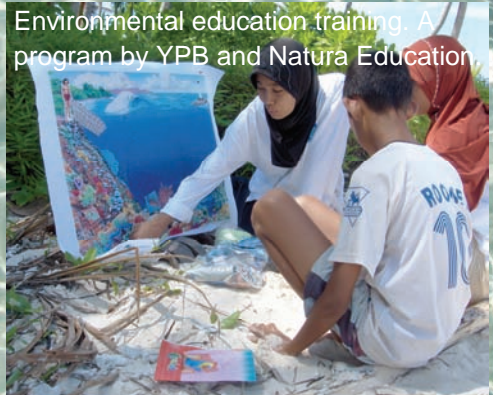
Environmental education training. A program by YPB and Natura Education.