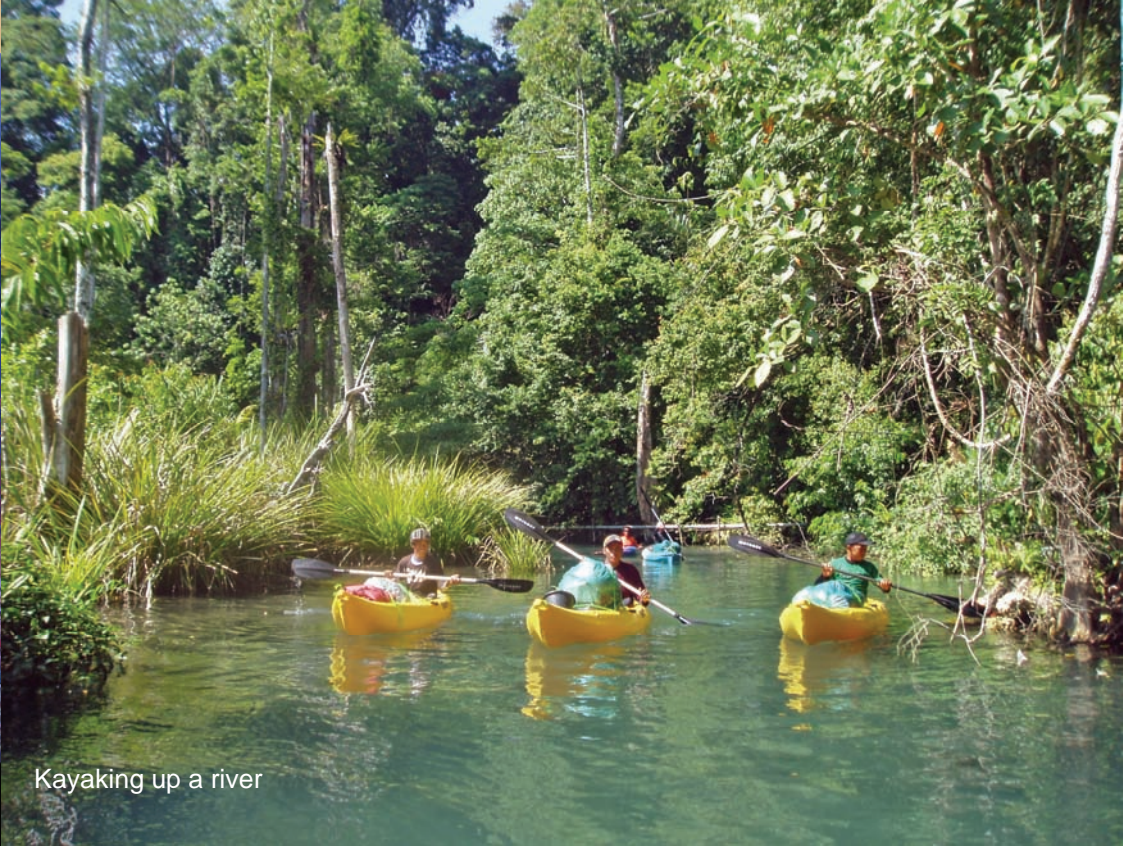
Kayaking up a river