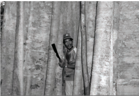
The jungle can be dense at times

Pulau Tuangku is with its 11.500 hectares the biggest island. Most of this island is covered by virgin low land coastal jungle. Only a few have seen the interior of this island. For an adventurous jungle lover this island offers unique possibilities. There are many kinds of birds and snakes, even crocodiles, wild boars, monkeys, squirrels and mouse deer. A subspecies of the Hill Myna, called Beo Nias , is common on Pulau Tuangku and Pulau Bangkaru.