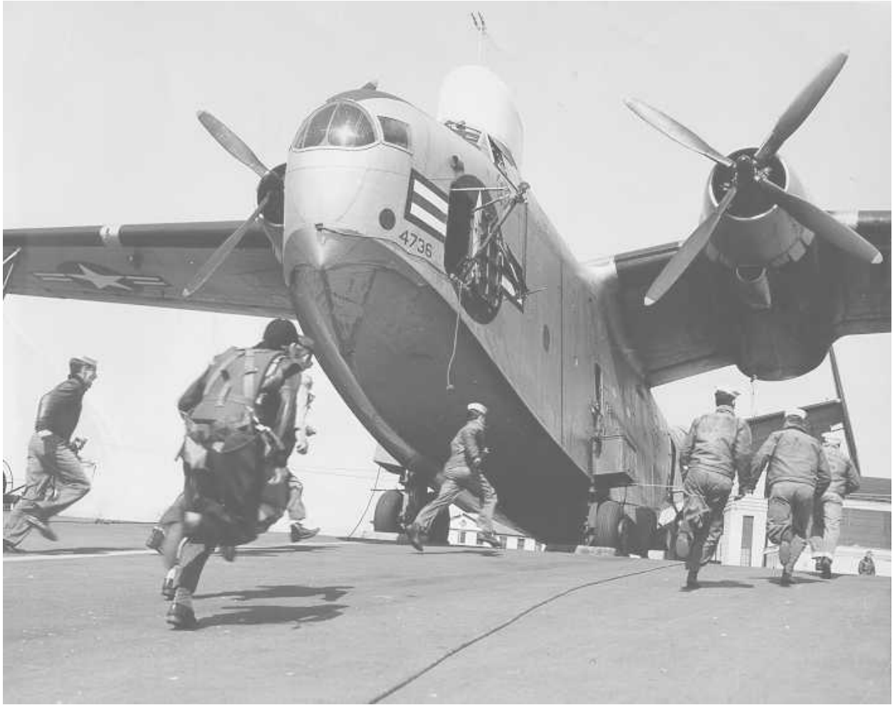
No caption/date/photo number; photographer unknown. On ramp in preparation for launch, crew is running to the PBM; view is forward quarter, port side. Note beaching gear and anchor with hoist.