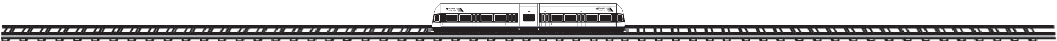
Hudson-Bergen Light Rail service is operated by 21st Century Rail Corporation under contract with NJ TRANSIT.

NJ TRANSIT Mail Fare, One Penn Plaza East, Newark, NJ 07105-2246 Call 1 (800) 648-0215 for additional information.