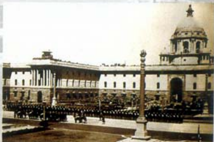
A view of Indian spectators on the roof of North Block, 10th February 1931.

The secretariat buildings convey an ethereal lightness as also stately grandeur fusing together the traditional Indian and the modern English styles of architecture. The North and South blocks showcase the characteristic features of Indian architecture: the open canopies, chhatris, overhanging eaves and balconies or chhajjas and the intricately carved stone and marble lattice screens or jalīs. Sandstones of the high plinths and the Dholpur stones for the walls and pillars add to the magnificence of these buildings. The decorative-art work in the Secretariat