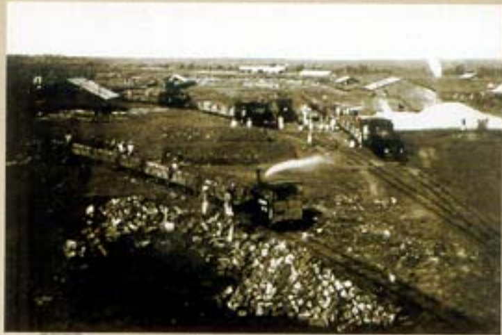
Transporting construction material to the site at Raisina Hill.

designing the city of Delhi and Government House, which later came to be known as the Viceroy's House (Rashtrapati Bhavan). Sir Herbert Baker was commissioned to design the two wings of the Secretariat (North & South Block) and Council House (Parliament House).