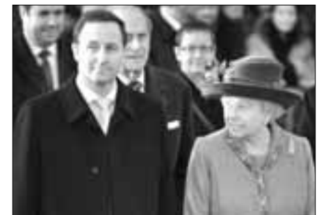
Accompanied by her New Zealand Prime Minister, John Key, The Queen visits a NZ Tourism exhibition mounted in a giant rugby ball near Tower Hill, London.