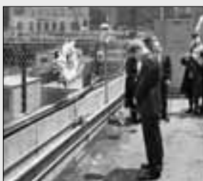
Prince Harry plants "Elizabeth" magnolia memorial tree after naming the British Memorial Garden remembering the 64 British dead of 9/11

NEW YORK, May 29-31 – Prince Harry undertook his first solo overseas official engagements during a trip focused on paying tribute to the British victims of the 9/11 terrorist attacks. To rave reviews by the American press, Harry visited the World Trade Centre site, where he met surviving family members. Nearby, at Hanover Square, he laid a wreath to commemorate the 67 British dead, and attended a reception for British and American family members. The trip also included a trip to the prosthetics unit of the Veterans' Affairs Medical Centre. The final day found the Prince playing polo on Governor's Island in order to raise money for Sentebale, his charity to support orphans and vulnerable children in Lesotho. However, Harry had to miss the post-match Ball in order to return to his military duties in Britain.