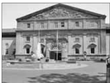
Rideau Hall – “thorough reform” required.