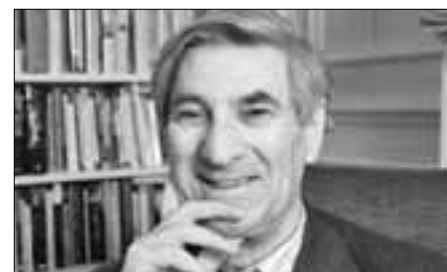
British Constitutional expert Vernon Bogdanor – Commonwealth Realms must agree to any alteration in Succession to Throne

No Act of Parliament of the United Kingdom passed after the commencement of this Act shall extend, or be deemed to extend, to the Commonwealth, to a State or Territory as part