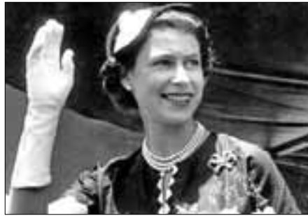
The Queen's first visit to New Zealand, 1954