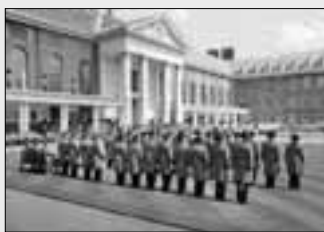
Prince of Wales succeeds in preserving neighbourhood of Royal Hospital, Chelsea

LONDON, June 12 – The Prince of Wales' personal campaign to prevent a modernist glass-and-steel building development of 550 apartments on the Chelsea