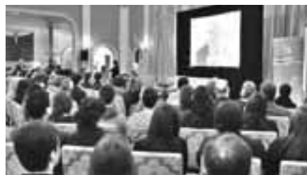
Obama Inauguration feted at Rideau Hall

MACE for the incomprehensible attention paid by Rideau Hall to the Inauguration of President Barack Obama when compared to its long-standing studied indifference and awkwardness in respect of Canada's own Head of State and monarchical system of governance. Calling it "an historic moment which we are joyfully celebrating," the Governor General hosted a full-day event on January 20th to "mark" the US Presidential Inauguration, complete with two sets of remarks by Her Excellency, viewing of the ceremony, a panel discussion and a "youth dialogue" tying together "the election of the first African American President of the United States" with the theme "Youth and the power of hope."