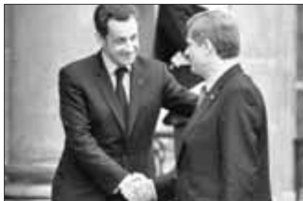
President Sarkozy – who snubbed The Queen – with Prime Minister Harper.

As a result of one of the oddest diplomatic imbroglios we have seen in recent years, Queen Elizabeth will not be attending this year's 65th anniversary of the allied D-Day landings in Normandy. The commemoration will be held on Saturday, June 6, to mark the day in 1944 when the allies – chiefly the Canadians, the British and the Americans – stormed the beaches, drove back the Germans and began in earnest the business of defeating Hitler's Nazi regime. But apparently the French didn't see fit to invite the Queen of Britain and Canada... Neglecting to invite the Queen to attend the ceremonies seems not only disgraceful but ungrateful and has outraged many Britons, as it should anger Canadians. Prime Minister Stephen Harper will be there, and British Prime Minister Gordon Brown may or may not attend, but nei-