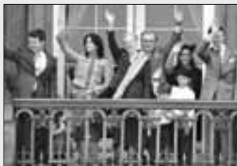
Queen Margrethe and the Danish Royal Family greet crowds celebrating HM's 69th birthday

BUCKINGHAM PALACE, April 18 – Less than two months before his 88th birthday, The Duke of Edinburgh became the longest serving Consort of any British or Canadian Sovereign, surpassing the record of 57 years, 70 days achieved by Queen Charlotte, wife of George III.