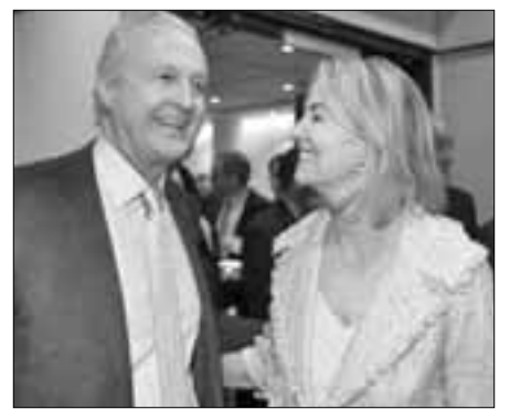
Hon Hilary Weston with her husband Galen, a partner and supporter in the Vice-Regal Office

The reminiscences of No Ordinary Time provide a valuable and interesting framework for the “typical” work of a Lieutenant Governor. These responsibilities include the presentation of Honours, Her Honour's role as chief mourner and as a military Honorary Colonel, together with the round of annual and special events such as the 100th birthday celebration for The Queen Mother held outdoors at Queen's Park. The book is also fleshed out with helpful historical material, a selection from notable speeches and table of highlights of Her Honour's time in office and – appreciated but rare in even commercial texts these days – a competently-prepared index. The work is also greatly enhanced by lavish colour photography, much hitherto not seen or widely distributed, and reproduced with extraordinary clarity and care. Errors seem few, although it is surprising that the word “term” appears frequently in