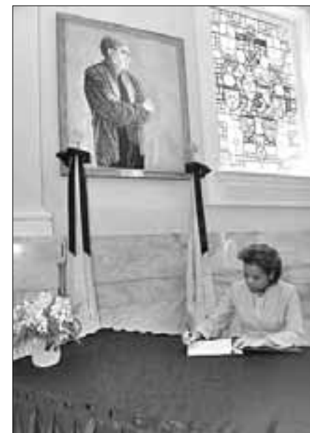
The Governor General signs the Book of Condolence for Roméo LeBlanc

When in 1999 I hosted my fellow Lieutenant Governors and Commissioners at Old Government House in Fredericton. Mr LeBlanc was just as happy as I was to welcome everyone to New Brunswick. There were the usual meetings and a formal dinner, but something quite different stands out in my memory. It was the “Maritime Kitchen Party”. We had Acadian Chicken Fricot, baked beans, salmon and lobster, brown bread and Poutine à Trou. When the meal was finished,