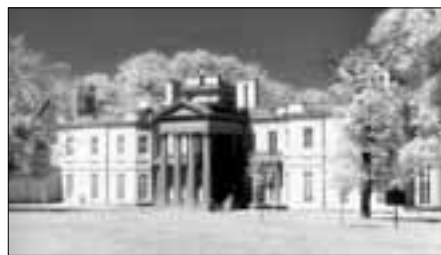
Dundurn Castle. Hamilton to welcome Camilla to ancestors' home.

In announcing the visit, Prime Minister Stephen Harper stressed that it was an opportunity, especially for young people, “to learn more about the heritage and traditions of which we are all proud.”