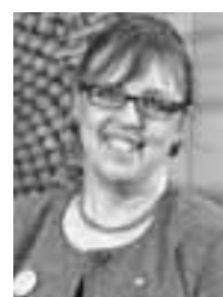
Green Party Leader Elizabeth May – fuzzy on Monarchy

Message Board and the Green Party's Blog www.greenparty.ca/en/blogs/3114/2009-03-06/government-elected-not-state that at its Pictou Policy Conference in March, the fledgling Party had adopted a pro-republican stance, Leader Elizabeth May wrote on March 8, "The resolution that would have supported a shift in Canada from the Queen as Head of State to a Republic did NOT pass. It lacked sufficient support to get out of the workshop. The resolution to remove reference to the Queen in oaths of allegiance and replace the pledge to the Constitution did pass. The constitution makes it clear the Queen is the head of state. It was thought this change might make the swearing of the oath more palatable to some. Please, let's not spread misinformation." We appreciate the clarification that the Greens are not calling for a republic – but we do not understand "the pledge to the Constitution" as none exists. Did Ms May mean that the Greens' policy is to replace Allegiance to The Queen with allegiance to a political document which can be amended? Whether clumsy wording or misplaced loyalty, CMN suggests the Greens take some basic refresher courses in Civics and read Crown of Maples !