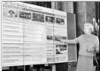
Commonwealth anniversary found Queen re-launching Royal website

STOCKHOLM, April 30 – King Carl Gustaf XVI celebrated his 63rd birthday with a glittering gala at the Royal Palace. Earlier in the day, His Majesty and Queen Silvia had been hailed by 20,000 outside the Palace, attended a church service and been feted at a City Hall lunch.