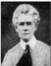
Nurse Edith Cavell: patriot shot by the Germans in the Great War