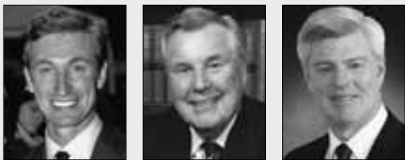
Order of Canada appointments announced July 1 included (l-r) hockey great Wayne Gretzky (Companion) and new Members Hon Sterling Lyon and the ardent republican John Manley!

Gretzky named CC... Newfoundland vice-regal Secretary honoured by Queen... Charles blocks London building horror... Mounties get Royal canine... Danes approve Succession change... GG eats seal meat... Change to Canada's Motto?... Fiji to resume as Realm?... Boy petitions Harald for name change... Queen Mother statue unveiled... Regina Orchestra gets Royal Patronage