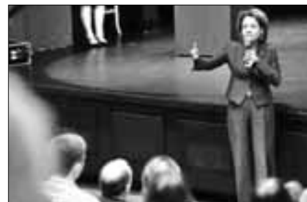
The Governor General making closing remarks after the round-table discussion on Aboriginal reconciliation.

April 16-17 – A two-day visit to Montreal found Mme Jean delivering the opening