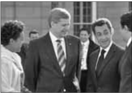
French President Sarkozy snubbed Queen at Normandy.

The unbelievably discourteous failure of France's President to invite The Queen to the 65th Anniversary of D-Day Commemoration was a triple snub: to The Queen, who in War wore the uniform of the Women's Auxiliary Territorial Service; to Britain; and to Canada. For our young men spilled their blood in full measure upon the soil of Normandy, and our Queen should have been there to honour both them and the dwindling but ever-gallant band of their comrades yet alive. We cannot tell what went on behind the scenes – but all credit to the Prince of Wales for bypassing diplomatic channels to intervene directly with the Elysée, and to President Obama for pub-