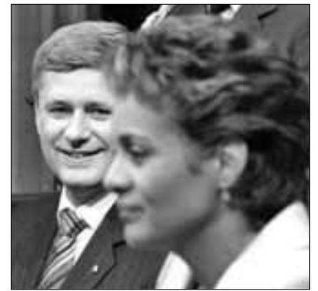
Governor General and Prime Minister – conditions on Prorogation?

Had Mme Jean refused the Prime Minister's request, he would surely have submitted his resignation. Mme Jean would then have placed herself in the unenviable situation of making critical political decisions as an independent actor; for she would no longer have a Prime Minister to give her Constitutional "advice" despite whatever informal (and probably, conflicting) advice a departing Prime Minister or any bevy of constitutional "experts" might have tendered her. She would have had to decide: a) whether to seek another Conservative able to lead the minority government and more likely to be able to reach quickly an agreement with the Opposition failing which to promise to advise her to dissolve Parliament and hold an election; b) whether to invite M. Dion to form a government as he had indicated he was willing and able to do; c) whether to ask Mr Harper or a caretaker Conservative Minister to stay on as Prime Minister, after which she would dissolve Parliament and hold an election on her own responsibility.