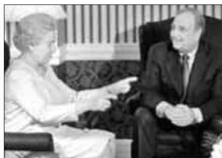
In Regina during her most recent Homecoming in 2005, The Queen receives in Audience her Canadian Prime Minister, Paul Martin, for animated discussion