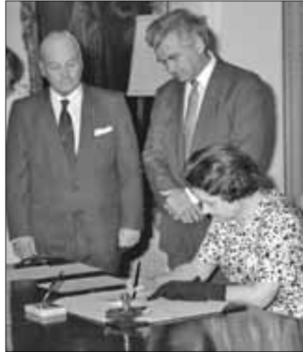
Queen of Australia: with her Prime Minister John Hawke standing to her right, HM signs the Proclamation of The Australia Act, 1986, regarded as the final stage of Australia's independent constitutional identity under the Crown

regal office, especially during the Depression and by Labor governments, but these have faded away; the position of governor now seems secure and is entrenched in the constitutions of Western Australia and Queensland. The curious aspect of the Australian state Crowns is that not only were the vice-regal appointees British as late as the 1970s, but governors were appointed by the