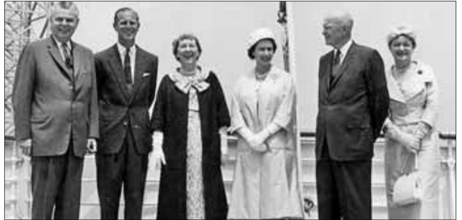
Missed opportunity for Royal Homecoming: 2009 marks 50th Anniversary of The Queen, as Canada's Sovereign, joining US President Dwight Eisenhower to open the St Lawrence Seaway. Gathered on Britannia foredeck June 26, 1959 were (l-r): Prime Minister Diefenbaker, Prince Philip, Mammie Eisenhower, HM, General Eisenhower, Olive Diefenbaker.

There is continued and increasing concern about trends at Rideau Hall. The Office of the Governor General has acquired a new and harmful reputation for being unable even to answer correspondence and invitations in a timely way. Correspondents in Canada, Australia and the United Kingdom, some of them