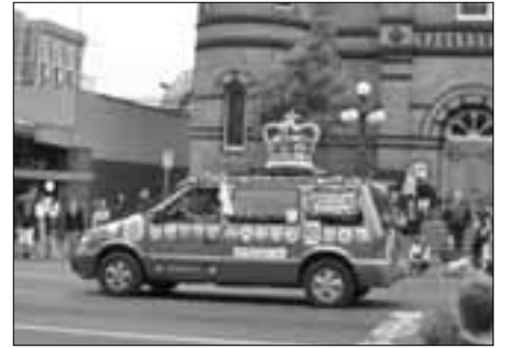
Victoria Branch wins Best Decorated Vehicle-Community in Victoria Day Parade