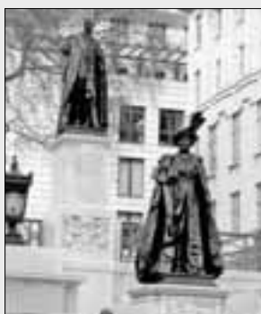
Of Happy Memory: The Queen Mother's statue on the Mall joins that of her husband George VI