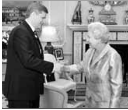
The Queen receives Prime Minister Harper in Audience at Buckingham Palace on April 1

We were disappointed when your government, apparently succumbing to the pressure of a small group of separatists in