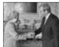
HM receives Australian PM Rudd before Palace Luncheon

Wellington, March 8 - New Zealand Prime Minister John Key announced that The Queen had agreed that, effective in the Birthday Honours List in June, knighthoods would again be available to HM's subjects in the South Pacific realm, in two grades as Knights or Dames Grand Companion or Companion of the New Zealand Order of Merit.