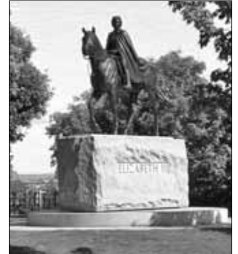
Equestrian Statue of The Queen of Canada looks over her Dominion from Parliament Hill, Ottawa