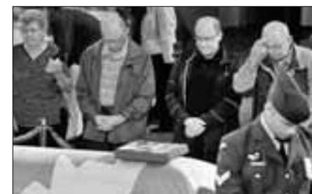
New Brunswickers pay respects at Lying-in-State