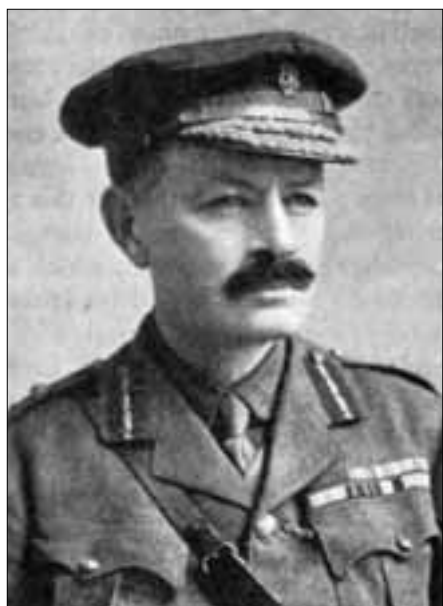
General Lord Byng, the last Governor General to refuse a dissolution request, although Mr Schreyer mused about the possibility.