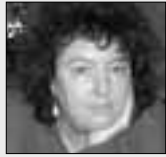
New Poet Laureate Carol Ann Duffy

ily be changed in Latin to A Mari Usque Ad Maria and amended in French to read "D'un ocean aux autres." Any change would involve The Queen's consent, as did a 1994 augmentation to incorporate an annulus containing the Motto of the Order of Canada, Desiderantes meliorem patriam .