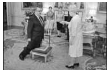
Sir Anan Satyanand, Governor General of New Zealand, receiving the Accolade from The Queen at a Buckingham Palace ceremony in March. Sir Anan had served as the country's Ombudsman for two terms before his appointment as The Queen's representative in 2006 - the first GG of Indian descent and of the Roman Catholic faith. Consequent upon the decision of NZ to restore knighthoods to its Honours system, HM approved his re-designation from Principal Companion to Knight Grand Companion of the Order of New Zealand.

Some 80 New Zealanders awarded top honours since knighthoods were abolished in 2000 will be given the opportunity to receive the accolade, should they desire to do so.