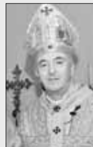
RC Archbishop of Westminster – no hurry to change Succession rules

WESTMINSTER, May 24 – Speaking to the Sunday Times , newly-appointed Roman Catholic Archbishop of Westminster Vincent Nichols (the pre-eminent Catholic prelate in England) said that he would not rush to amend the Act of Succession, as the disqualification of Catholics from the Throne "is not a grievance we Catholics carry heavily." Pointing out the ban applies to Catholics alone, not, for instance Mormons or Muslims, His Grace said the position of The Queen and the Monarchy was one to be "handled with great sensitivity... you are talking about one of the key components of the English identity."