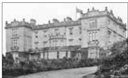
Alloa House – 64 fireplaces for the servants to light