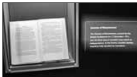
Statute of Westminster 1931 – would it preclude Succession change without consent of each Realm?