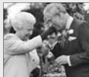
Charles kisses The Queen's hand as he receives Horticultural Medal