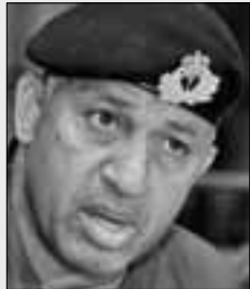
Fijian Prime Minister Commodore Frank Bainimarama – wants Queen restored

MANCHESTER, May 1 – Carol Ann Duffy, 53, poet and author of over a score of children's stories and anthologies, was appointed Poet Laureate after receiving "assurances that there was no expectation" she would have to write Royal poetry. Outgoing Laureate Andrew Motion had been criticized for his Royal poems; but Duffy stated "I will write what needs to be written... I wouldn't write a poem if it felt forced. But if something occurred at a public or political moment, and it genuinely felt truthful to me, then I would do it."