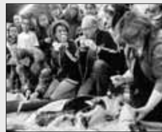
The Governor General enjoyed eating seal during a traditional Inuit feast at Rankin Inlet