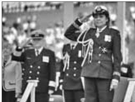
June 27th found Her Excellency presenting a newly-consecrated Queen's Colour to Maritime Command, Halifax, after which Mme Jean took the Salute from approximately 500 of HM Canadian Forces.

Her Excellency's more notable recent engagements have included –