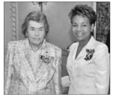
The Countess Mountbatten of Burma receives the Meritorious Service Cross on her retirement after long and distinguished service as Colonel-in-Chief of the Princess Pats

The chapters on “Military Valour and Bravery Decorations” and “Meritorious Service Decorations” are enlivened by vignettes of some of the recipients. First World War ace Billy Bishop receives the Victoria Cross; two soldiers are recognized with military valour decorations for their gallantry in combat in Afghanistan; civilians are awarded bravery decorations for rescuing people from drowning and for disarming a bank robber. Olympic rower Silken Laumann is decorated with the Meritorious Service Cross for her courage and determination, while