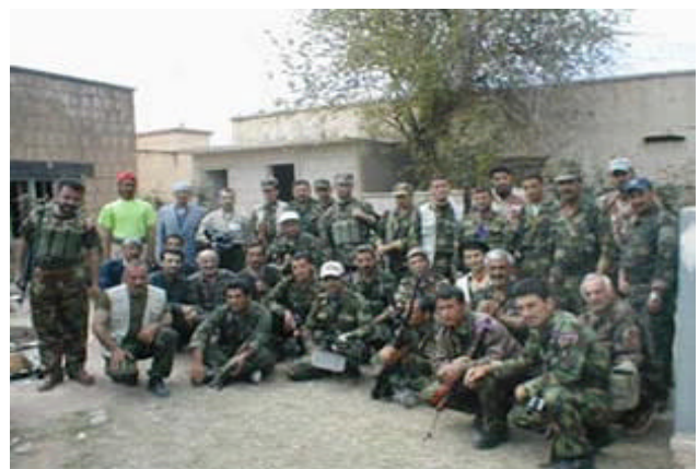
A few ADM guards who took part in the liberation of our towns and villages in N. Iraq alongside US forces