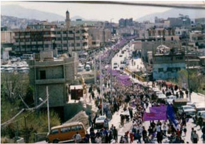
Kha B’Nissan celebrations N. Iraq