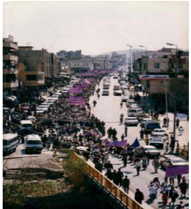
Kha B’Nissan celebrations N. Iraq