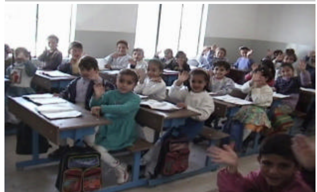
One of our many schools in N. Iraq