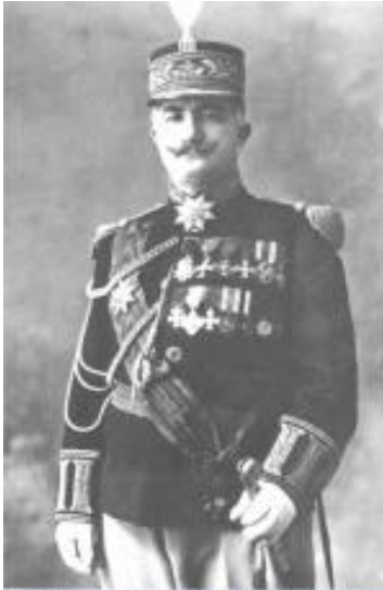
Assyrian General, Agha Petros

The name ChaldoAssyrian only refers to our community in Iraq and is used to unify it so that it has a louder voice. It simply means 'Assyrians and Chaldeans'. One of Zowaa's aims is to ask for administrative autonomy in certain towns in Iraq, and if in those towns, the majority of people want to be known as 'Chaldean', it is not viable to impose the name 'Assyrian' on them. We need to present a united front when we claim our rights. For example, if here in London we go to our MP and say, I am a t'yaraya and I want my rights' or 'I am a bazneta and I want my rights', how likely is it that we'll get anything? It is the same principle. We are a minority in Iraq, just like we are a minority here.