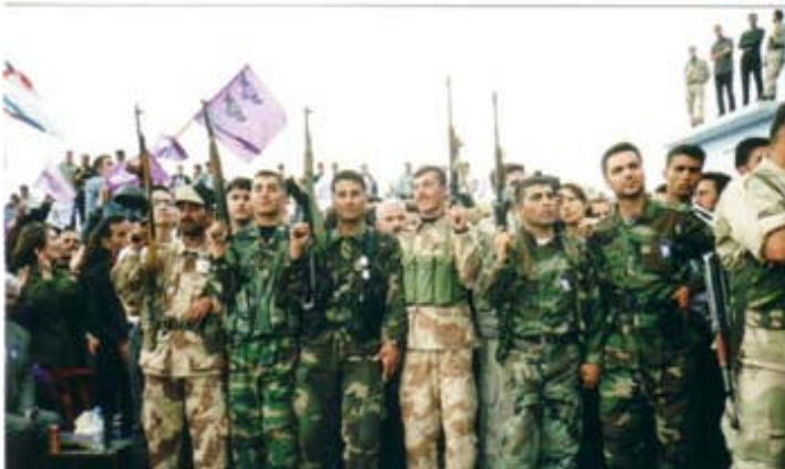
ADM Guards during Kha Bnissan celebrations in N. Iraq