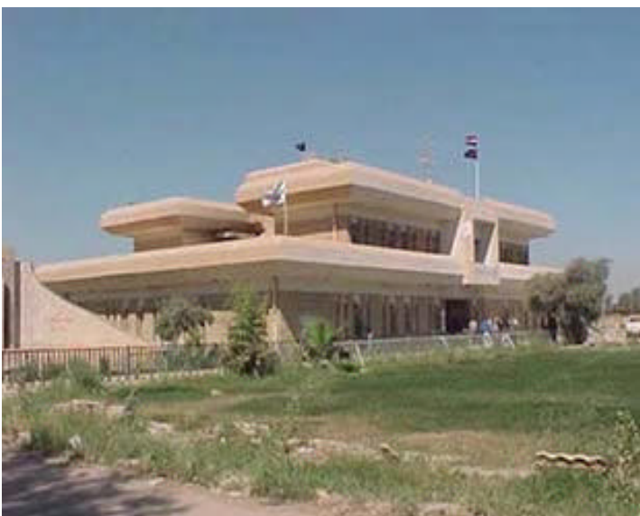
ADM Headquarters in Baghdad