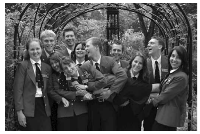
ABOVE: Rideau Hall tour guides pose for a group photograph in the residence's gardens.

Aides de Camp (referred to as Honorary Aides de Camp in some provinces) assist the vice-regal officeholders on a rotating basis at virtually all Vice-Regal functions. They guide the Governor through events, assist with protocol and frequently deal with the gifts given to Their Excellencies or Their Honours at these events.