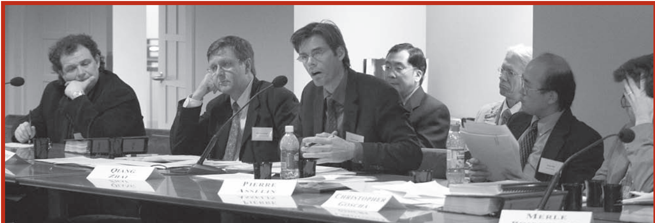
The 1954 Geneva Conference & the Cold War in Asia, Woodrow Wilson Center, 17-18 February 2006