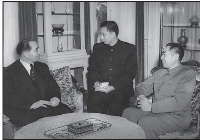
Pierre Mendes-France and Zhou Enlai at the Geneva Conference

I agree with Premier Zhou Enlai's point. We really hope that the military staff meetings can move into practical phase quickly, and that the Vietnamese representatives will receive their new and clear instructions from their high command. The determination of the main regrouping areas can be used as the foundation for diplomatic negotiations. It seems that the main regrouping areas can be decided pretty soon. Regarding particular ideas on the main regrouping areas, I can't make any suggestion right now, because I don't know