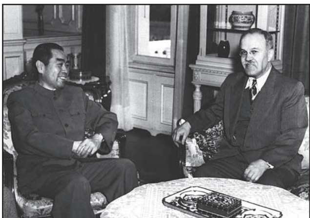
Zhou Enlai and Vyacheslav Molotov at the 1954 Geneva Conference

ing was adjourned. Neither Comrade Pham Van Dong nor I used the texts of the statements we prepared. The meeting began tensely but ended in a relaxed mood. We do not necessarily need to put any pressure on the conference since the United States made their position clear, Britain and France began showing a true spirit of conciliation, and the issue of composition has been solved. We will try to fend off [our counterparts on] other issues in these two days. If our counterparts are willing to keep making compromises, we believe that we can reach the agreement on the 20th.