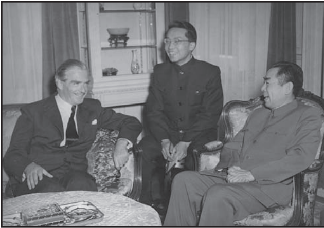
Anthony Eden and Zhou Enlai at the Geneva Conference