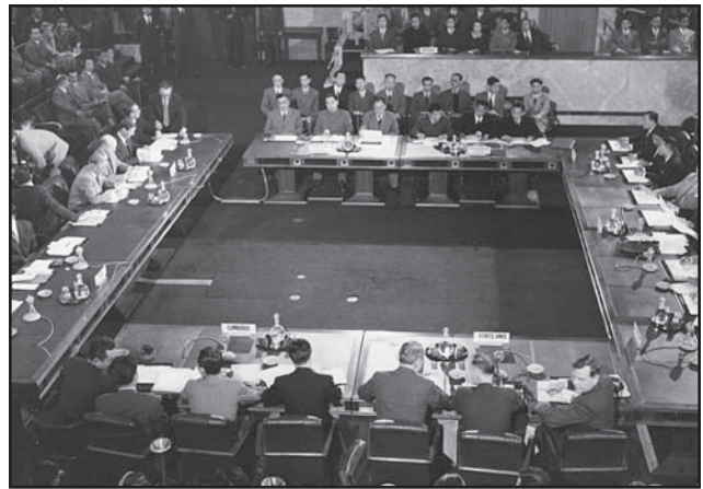
The 1954 Geneva Conference

I called upon [Soviet Foreign Minister Vyacheslav M.] Molotov this afternoon, conveying to him the preliminary opinions of and preparation work on our side for the Geneva Conference. He says that all opinions are very good, and he will forward them to the Communist Party of the Soviet Union Central Committee and the [Soviet] Foreign Ministry for discussion. He also welcomes the delegations from China, [North] Korea, and Vietnam to visit Moscow in mid-April, to have discussions and consultations on various issues before (the Geneva Conference). Concerning Ho Chi Minh's plan to visit Moscow, he will report to the Central Committee immediately and will then give us a reply.