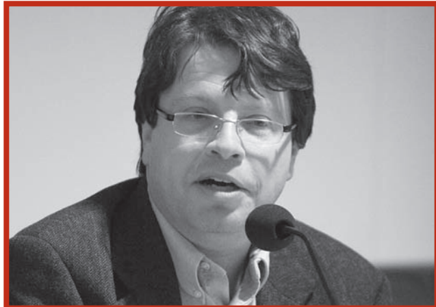
The 1954 Geneva Conference & the Cold War in Asia, Woodrow Wilson Center, 17-18 February 2006

(2) Molotov spoke first at the fourth session on the