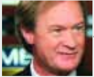
Most liberal Republican