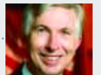
At the center of the House