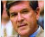
At the center of the Senate