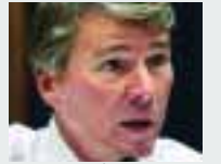
Most conservative Democrat