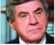
Most conservative Democrat

These are the members at the ideological center of the Senate and the House, according to National Journal's 2005 vote ratings. The members with composite scores closest to 50 are at the exact center of each chamber.