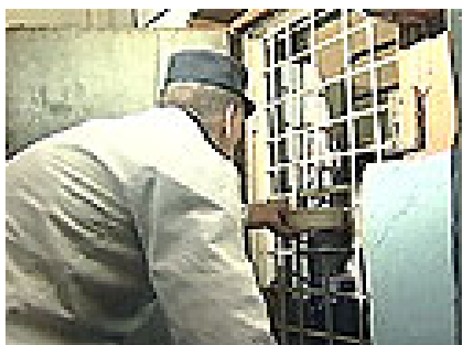
Steel-plated exercise area (above) and a prisoner receiving food in his cell, Fire Island.

rejected their request to call witnesses and to provide the prisoners with lawyers.