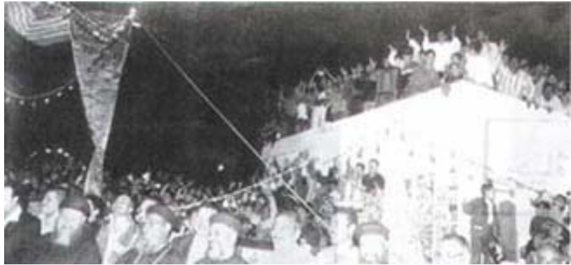
HH the Pope visiting St. Mina Church, Hurghada where he delivered his sermon...the Reverend clergy are seen waiting to receive HH outside the church with decoration and congregation all around it, the roof was also full.