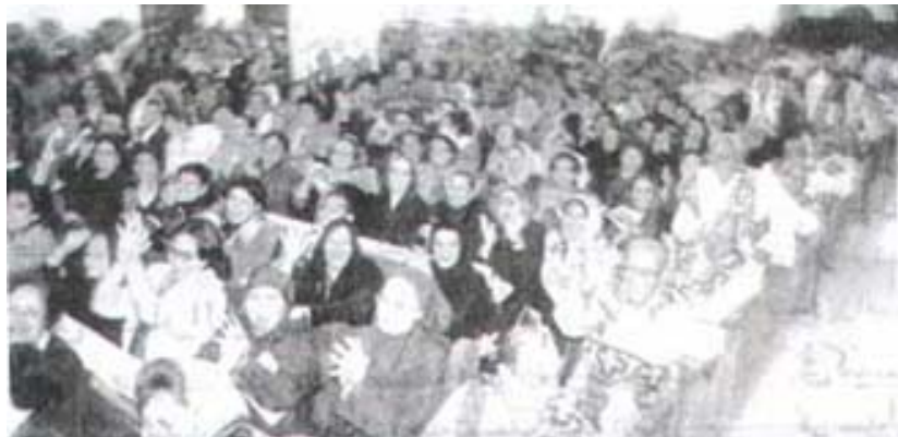
The two photos show how crowded the Cathedral was with the congregation: the upper picture was of the men and the lower one with women