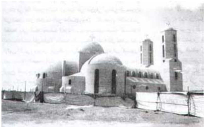
The New Church in Al Gouna