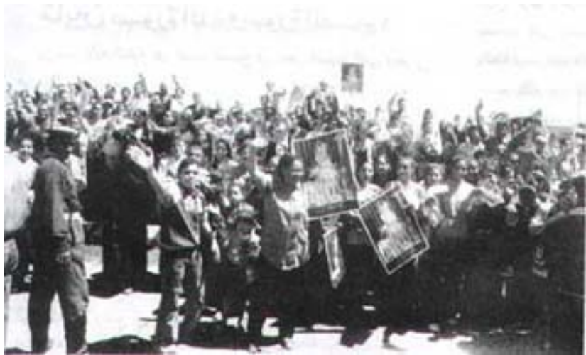
Coptic congregation on both sides of the road joyously raising his photo saluting HH the Pope