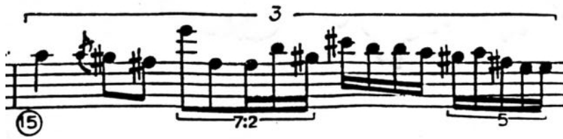
Example 6. Measure 15 of “The Black Page #1”

This is not to imply that Zappa’s chief reason for abandoning “The Black Page #1” was consideration for his band, as Zappa was famously unsympathetic and impatient with performers’ complaints about playability. It may in fact be that “The Black Page #1” so perfectly represented Zappa’s compositional aesthetic that it prevented him from adapting it further. The aesthetic of “The Black Page #2”, on the other hand, represents an extrapolation on “The Black Page #1”, that permits the introduction of recognizable rhythmic archetypes in the accompaniments provided by his different touring ensembles ranging from disco (1977) to reggae (1981) to polka (1984) to new age (1988). Thus, “The Black Page #2” lies outside the primary concerns of this study, as its function is to enable Zappa to indulge in his common practice of recasting pieces in different instrumental configurations. 54