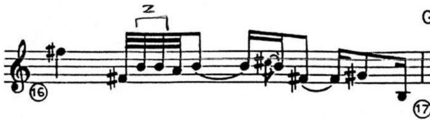
Example 11b. m. 16 [a']