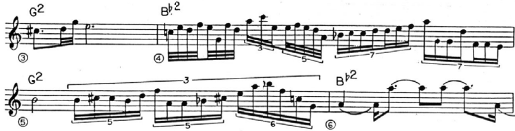
Example 7. Measures 4-6 of “The Black Page #1”

Of course, rhythmic dissonance of this kind can be sustained for a longer span of time than one measure. Measures 6-9 of “The Black Page #1” demonstrate a longer subversion of the factory pulse (Example 8). Here, the dissonance is created by long-held notes, each held for five sixteenth notes, creating a new “deceptive” pulse. 65 This process ensures that a note will not be articulated on any of the factory pulses within a measure until five beats have passed. Instead of closing the cycle with a long-held note on the third beat of measure 8, Zappa inserts a complex rhythmic configuration to which we will later refer as rhythm [DF] to maintain the rhythmic dissonance until the whole note of measure 9.