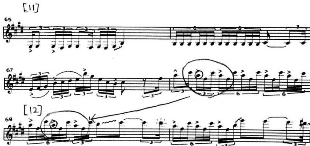
Example 3. [11] and [12] of “Pink Napkins”

Other segments can be related using the same system that was applied to [1] and [13]. [5] and [10] hold features in common that are in many ways opposed to [1] and [13] (see Example 4). For one, they are devoid of dissonant pitches, a feature which relates both segments to [11] and [12]. More importantly, [10] is rhythmically derived from [5] in the use of the simple rhythmic motive