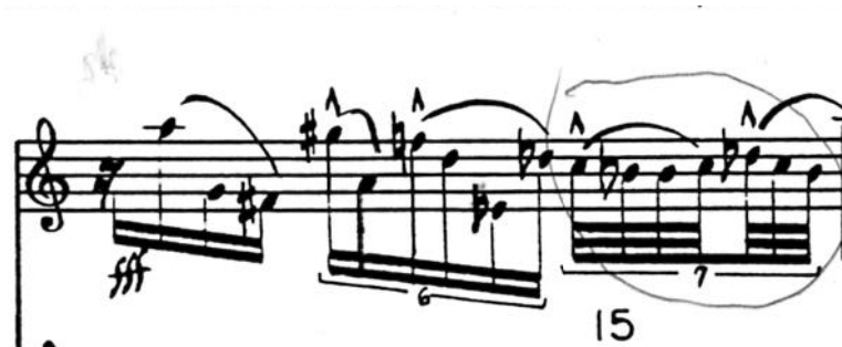
Example 21. [2a] and [4] of “Be-Bop Tango”

[6] is an interesting segment because, besides being a variant of the main theme, it presents two new motives in their nascent state: one motive that, when transformed, connects to a process already unfolding (Example 22). The motive in question is the quintuplet on the fourth beat of measure 26, identified above as a serial presentation of the pitches of the main theme [1]. When the pitches of the quintuplet appear on the first beat of [7], the motive has been metrically displaced by a sixteenth note. This new form of the motive is part of a larger family of motives that include a rest on the first beat of a factory cycle phrase ([4] [7] [8] [9] [10]). This rest always occurs at the beginning of a rhythmic grouping subdividing one quarter note. The systematic transformational process involves increasing the complexity of the rhythmic grouping in which the rest occurs: at