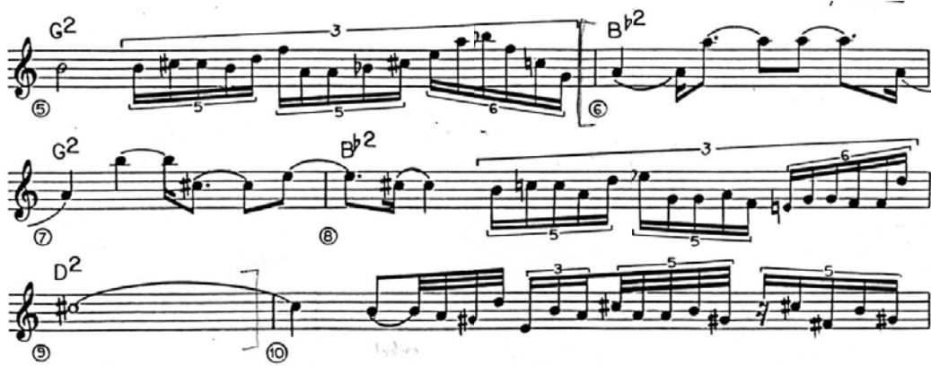
Example 8. Measures 6-9 of “The Black Page #1”

As opposed to rhythm, the melodic material in “The Black Page #1” acts upon the harmonic climate in a more consistent manner. The harmonic climate itself is uniform; every chord takes the form of a major chord with an added major second or ninth. In total, “The Black Page #1” presents the chords G2, Bb2, D2, Gb2, (G2, Bb2), C2, C#2, B2, and Ab2. The added major second or ninth suggests Zappa’s chordal thinking is still somewhere within the jazz idiom, as was “Pink Napkins”. 66 Likewise, the score of “The Black Page #1” consists merely of the composed melody with chord symbols above the measures. 67 The major quality of the chords, according to Zappa’s statement quoted earlier in this study, would reflect a “happy” harmonic climate. As in “Pink Napkins”, the scalar material that acts upon the chords is modal, though now entirely Lydian. The basic procedure is established in measures 1-2 (Example 9). Measure 1 utilizes pitches within the G Lydian scale while measure 2 shifts the mode to Bb Lydian (the C natural grace note in measure 1 is the only aberration). Therefore, the Lydian scale utilized is always generated from the root of the chord that is