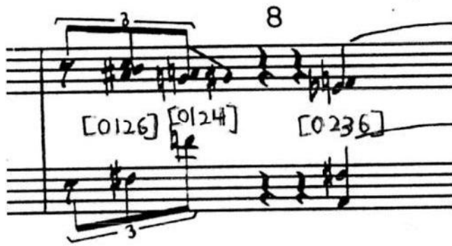
Example 18a. Split transformations