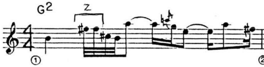
Example 11a. m. 1 [a]