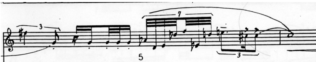
Example 16. Measures 5-6 of "Be-Bop Tango"

elements in the works of Zappa's greatest atonal-composition influence, Anton Webern. However, Zappa distinguishes his atonal procedure from Webern's in several ways. For one, the use of repeated pitches as well as the lack of aggregate completion negates the possibility that Zappa is composing in a twelve-tone idiom. 76 Also, Zappa does not exploit subsets of the larger set in a consistent manner. Most importantly, Zappa's rhythmic process, the "factory cycle phrasing" described above, is heavily in evidence throughout. This obviously gives Zappa's melody a rhythmic characteristic unlike that encountered in Webern's music. The melody might more accurately be categorized as Zappa's interpretation of Dolphy's improvisational style: melodically disjunct, atonal, rhythmically "speech derived".