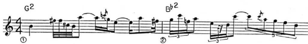
Example 9. Measures 1-2 of “The Black Page #1”

sounding. 68 Above, I remarked upon the similarity of the alternating G2 and Bb2 chords in measures 1-8 to the alternating C#-minor-seventh and D-major-seventh chords of “Pink Napkins”. In “The Black Page #1”, however, the pitch collections between these two chords share only four common tones, and these common tones are not exploited in any significant way. More importantly, the utilization of the Lydian scale for each chord allows Zappa to maintain the same harmonic climate throughout. There is no convincing reason to regard any of the pitches within the Lydian collection as “dissonant” to the sounding chord; therefore, it can be concluded that the Lydian scale reinforces or perhaps intensifies the harmonic climate of the chord. This allows Zappa to relegate the dissonance/consonance activity primarily to the rhythmic process described above.