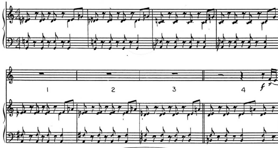
Example 15. Introduction of “Be-Bop Tango”

The switch to a more be-bop influenced style cannot only be the result of the jazz-like instrumental makeup of the Roxy band, as Zappa’s previous bands were similarly inclined towards jazz styles and instrumental configurations. The use of the word “be-bop” might rather be considered to be a clue to Zappa’s own conception of his melodic writing. Be-bop music was, at the time of its popularity, the most highly virtuosic form of jazz. Part of the appeal of be-bop was hearing a group of musicians execute difficult melodies skillfully, most often in unison statements. It is easily apparent how this aesthetic is consistent with Zappa’s own pronounced preference for “skill” in music. Further, Zappa’s melodies are almost always stated in unison or doubled at the octave by three or more instruments, leaving the impression of “several instruments all trying desperately to play the same line.” 73