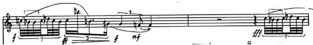
Example 12b. “Be-Bop Tango” mm. 7-8

Because “The Black Page #1” involves diatonic pitch collections, it is difficult to give an overview of Zappa’s preference for certain intervals over others beyond general remarks about the preponderance of perfect fourths and fifths in the piece. A better way to approach Zappa’s intervallic concept is to examine his variation procedures, in particular those applied to the very limited number of measures that are direct variants of earlier material. The analytic method to be employed will utilize comparisons of pitch intervals and will also include considerations of contour segments (CSEG). 70 This method can be demonstrated first on [DF] and [DF`] (Example 14). These two segments represent the only significant break from the Lydian pitch material utilized for the rest of the piece, as they are alterations of the Lydian mode of the sounding chord. First, it can be easily witnessed that the last sextuplet of [DF] cannot be related to the corresponding sextuplet in [DF`], as the only shared feature between them is rhythm. The sextuplet of [DF] is almost exclusively made up of perfect fourths, and is perhaps a comment on the basic preference for that interval throughout the piece. The sextuplet of [DF`], on the other hand, is taken almost directly from the last septuplet of measure 4 in [b], in particular the last six pitches of that septuplet. The motive z occurrences on the G4 and F4 are retained, while the E4 and D5 frame the two motive z pitches.