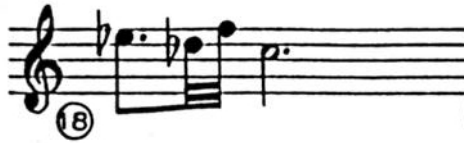
Example 14c. [a3] and [a`3]

Contour is only a useful analytical tool for the very brief [a3] and [a`3] segments (Figure 10). The CSEGs have identical values in the two middle columns, while the outer values 0 and 2 of [a3] are switched to 2 and 0 in [a`3].