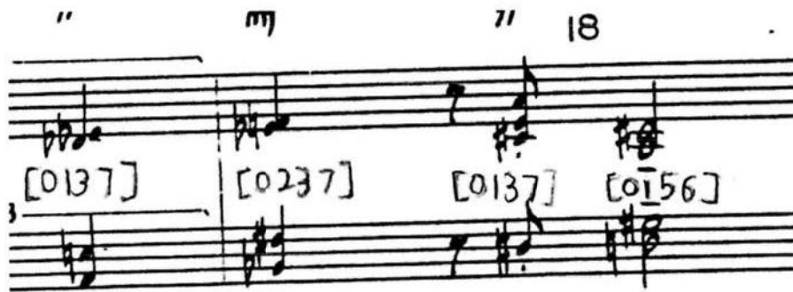
Example 18b. Split transformations

Before abandoning the concept of “densities” as a useful tool for considering “Be-Bop Tango”, the final chord of the piece, the only aberration from the tetrachordal sets previously heard, offers a fascinating case study (Example 19). This chord fits well with Steve Vai’s definition of a density: an oddly-structured chord consisting of no repeated notes. In this case, the chord includes the two melody notes A and C to create set class [01234568]. As will be remembered, the main theme consisted of a similar eight-note “density” [01234567]. Are these two collections intended to be related? Is it significant