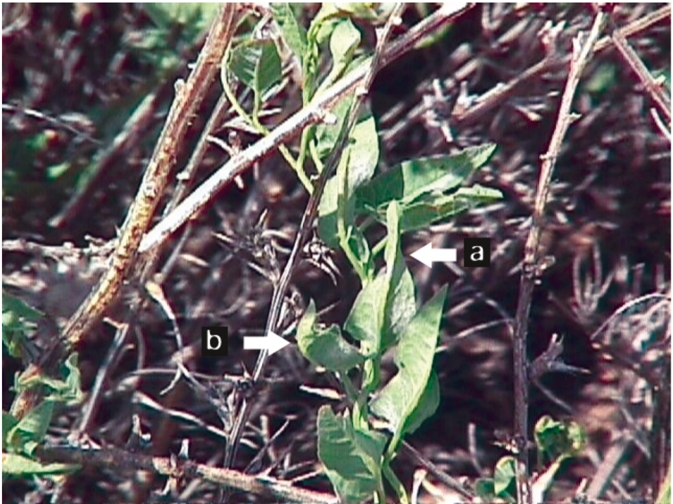
Figure 2. Classic damage by Aceria malherbae gall mites to field bindweed when unmanaged. Note the folding of the leaves (a) and the curving of the mid-vein (b).

using a lawnmower with a bagger attachment or by hand. If collecting by hand, select plants with longer stems (>6 inches) because this will make infesting new sites easier. If the material will not be used immediately, it should be placed in a paper or plastic bag and kept cool. Don't seal the bag because the mites could die from lack of oxygen or increased heat or humidity inside the bag.