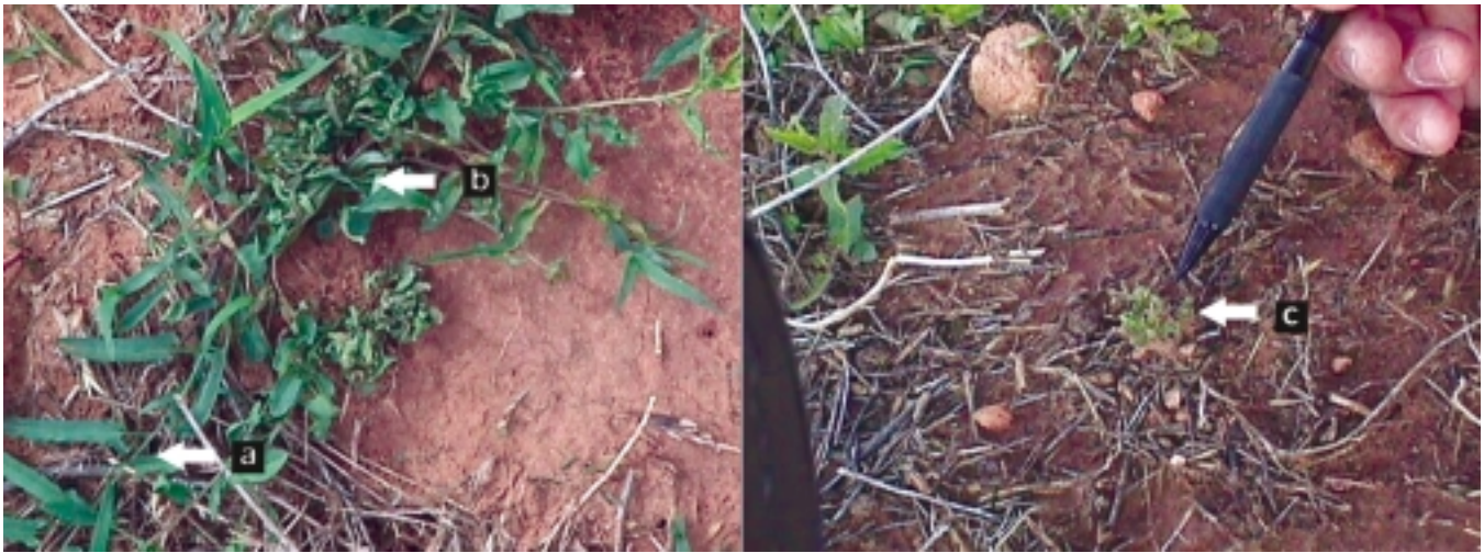
Figure 3. Stages of damage to field bindweed caused by Aceria malherbae gall mites. All stems show some level of damage. Longer stems (a) are outgrowing the effects of the mite. Moderately damaged plants (b) have heavily distorted stems near the center, but stems at the perimeter outgrow mite feeding. Severe damage (c) is indicated by a mass of gnarled leaves, in this case only about an inch in diameter. This is a nutrient sink that limits transport of carbohydrates.

Continue this procedure at regular intervals while walking in a spiral outward from the center of the bindweed patch as well as around the perimeter (Fig. 5). If chopped bindweed is used, simply scatter the material over the area. When infested material dries, the mites crawl onto living stems and establish colonies in about 10 days.