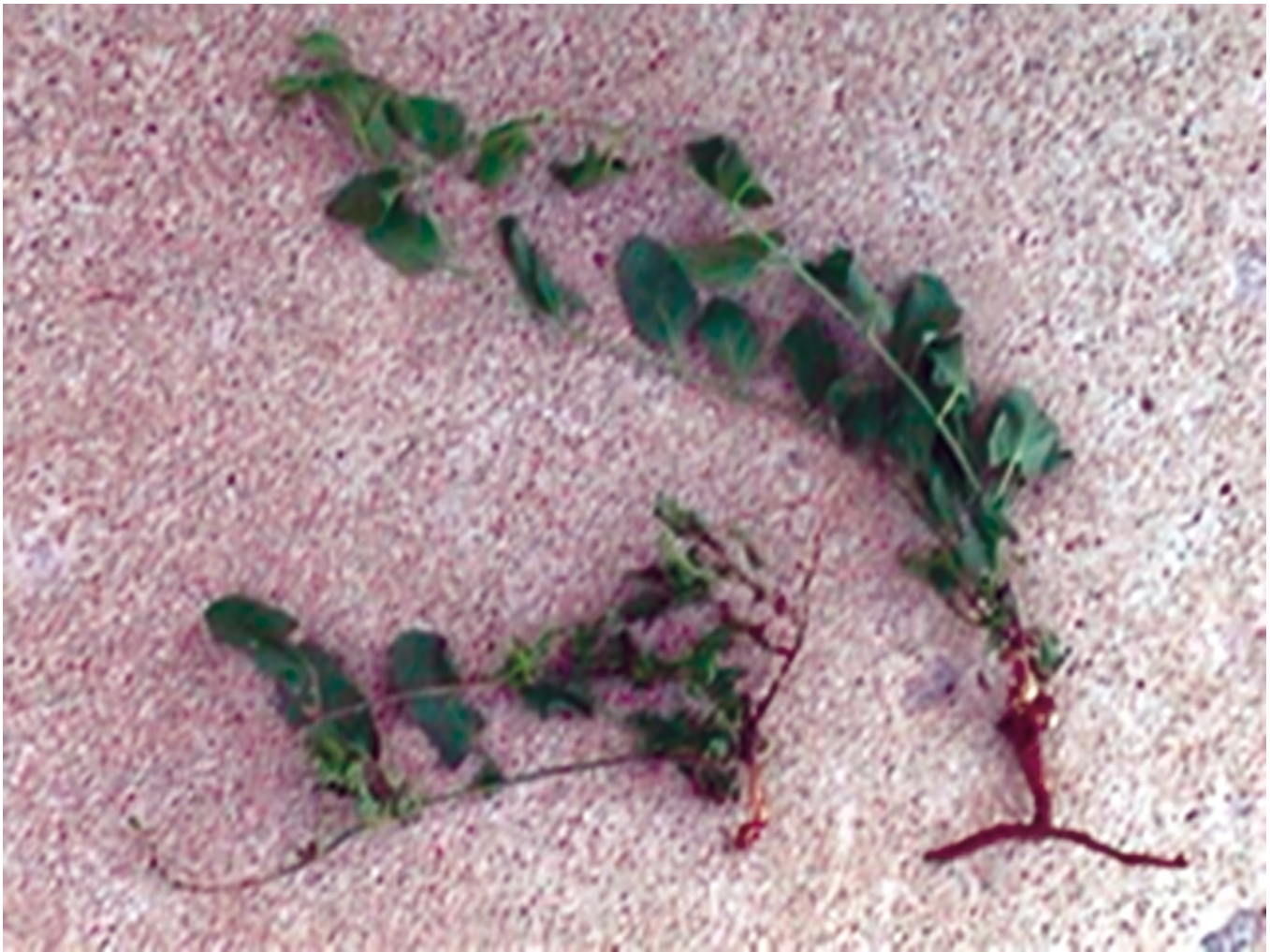
Figure 4. The effect of moderate damage by Aceria malherbae gall mites to the root system of field bindweed. The plant on the right (uninfested) has a strong lateral root approximately an inch below the soil surface. The plant on the left (moderately damaged) has no such lateral root. Often, when uninfested plants are pulled, the stems snap at or just above the soil surface. When damaged plants are pulled, the root will snap at approximately an inch below the surface.

material before it begins to heat. Also, be careful when spreading chopped bindweed that you spread it only on existing areas of bindweed to prevent establishing new areas of uninfested plants.