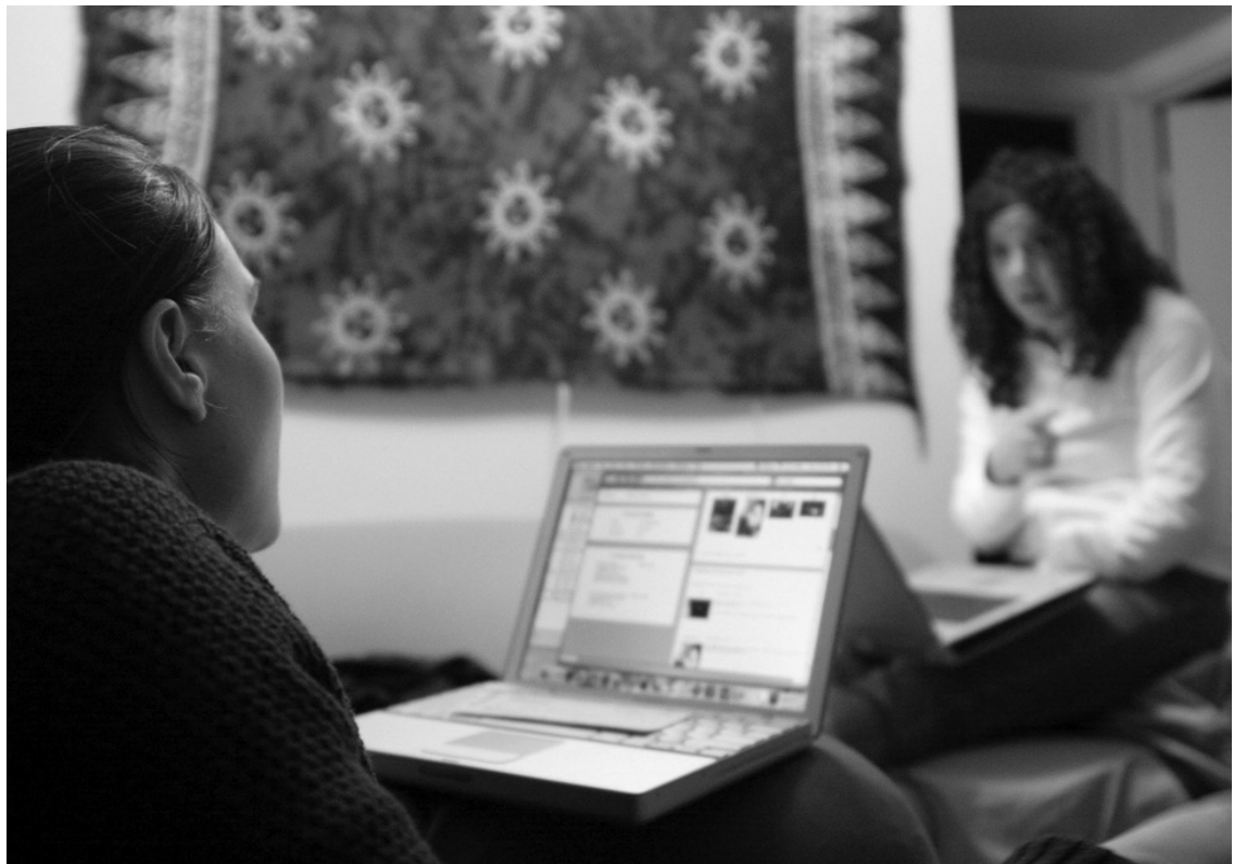
Figure 1: Teens socializing online and offline ("MySpacing")