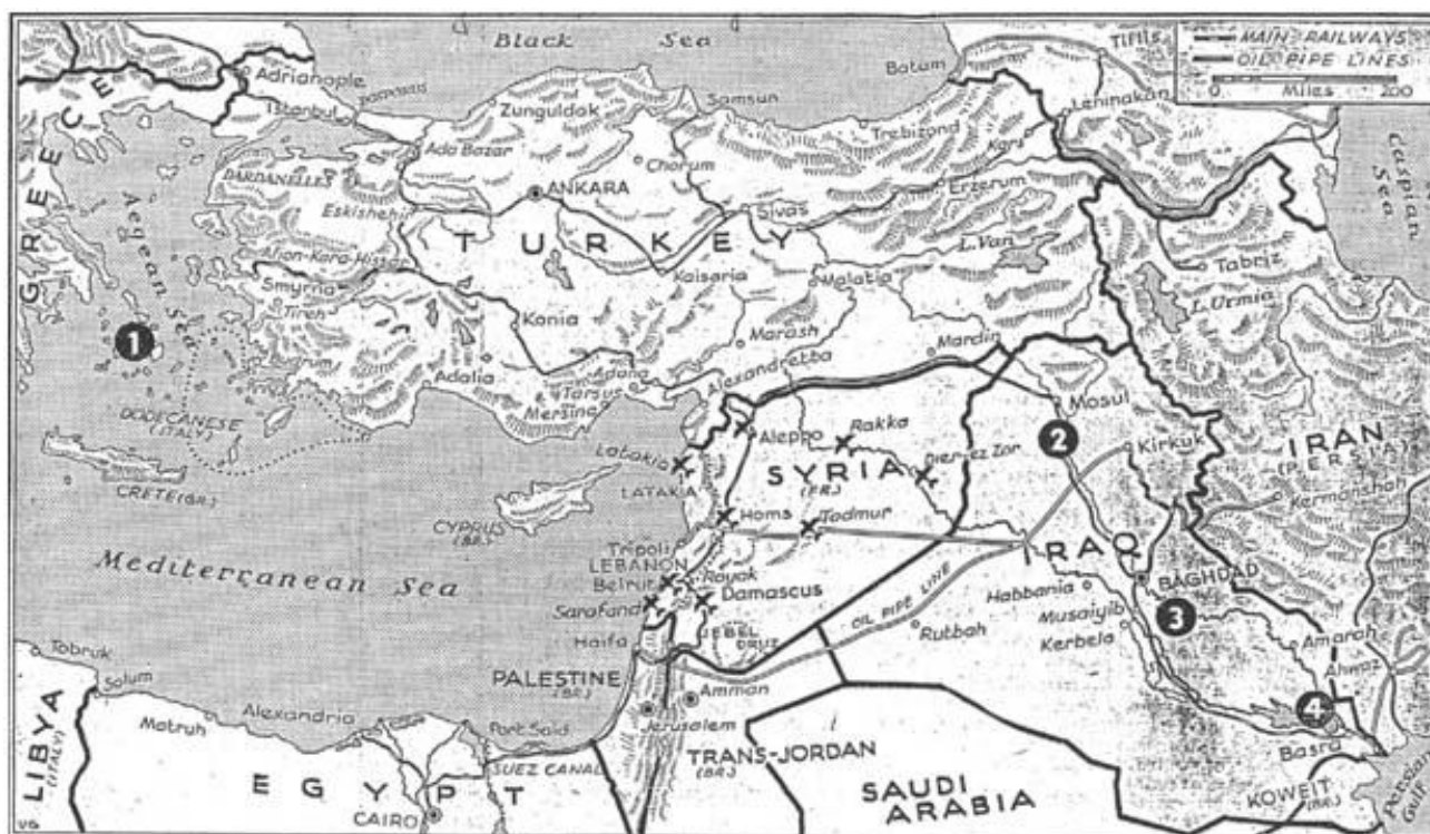
Map 2. Iraq, for a brief period—May 1941—a German foothold in the Middle Eastern door. German planes, presumably flying from the Nazis' newly acquired island bases in the Aegean Sea (1), were said to be arriving in Syria for action in Iraq. Many of Syria's military airdromes, the main ones shown on the map by airplane devices, were reported to already be under German control and thus subject to British attack. Nazi planes were declared to have landed around Mosul (2), where there were extensive oil fields, and north of Baghdad (3), the Iraqi capital. British bombers raided the railway near Baghdad, a small arms factory at Musayib in the same area, and barracks at Amarah in the neighborhood of the port of Basra (4).

A more challenging and for the most part undesired development for Berlin in the Middle East began after the Italian dictator asked his German counterpart to support his troops against the British in Libya. Thirty days after Benito Mussolini's 32 request for help, German troops landed in Libya. A month later, General Rommel arrived, leading the newly founded German Africa Corps into battles leading them close to Alexandria. Since the Germans also occupied Crete, it appeared that the Middle East would be the next major battleground. However, Hitler had already ordered the attack against the USSR for late June 1941. Its outcome spared the Jews in the Middle East from the Holocaust and the region from a terrible experience.