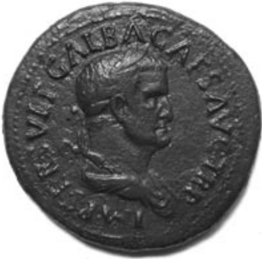
Obverse: head of Galba