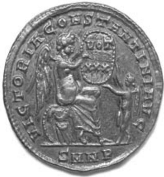
Reverse: Victory inscribing a shield

The solidus was a lighter gold coin that replaced the aureus in the early fourth century A.D. The bust of Constantine I on the obverse of this solidus ⑩ continues the tradition of portraiture observable on earlier gold coins (e.g., ⑧ and ⑨ ); the emphasis of the engraver, however, has shifted away from the individualized likeness of the emperor, achieved through plastic treatment of the face and hair, towards details of costume and ornament, indicated by lines and geometric shapes. The image on the reverse, of a seated Victory inscribing a small shield, also borrows a time-honored motif (cf. the reverse of ⑧ ).