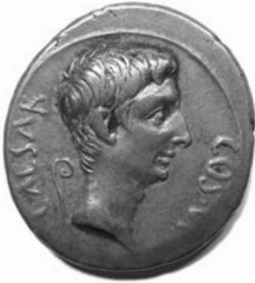
Obverse: head of Octavian