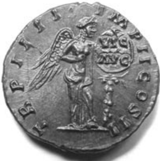
Reverse: victory inscribing a shield