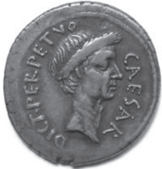
Obverse: head of Caesar