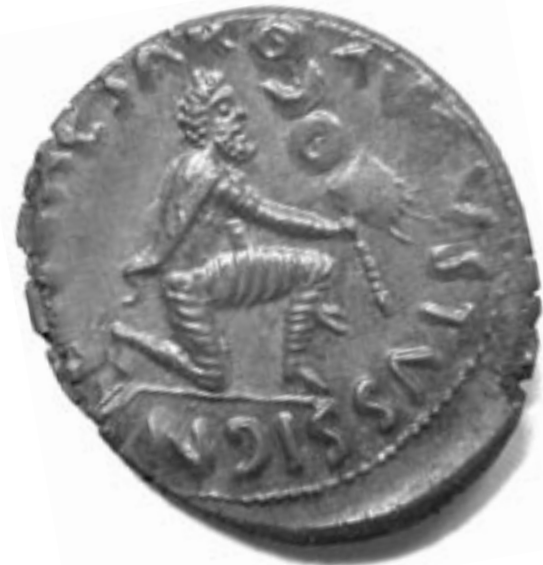
Reverse: kneeling Parthian

Octavian, Caesar's grand-nephew and adopted son, was forced to contend with a number of other prominent Romans, each believing himself to be Caesar's rightful successor. One of them, Marc Antony, a Roman statesman and general, allied himself with Cleopatra VII of Egypt. Octavian defeated their combined forces in a naval battle at Actium in 31 B.C., after which he took control of Egypt. A coin type minted in 28–27 B.C. ④ celebrates this triumph, with Octavian's portrait on the obverse and a crocodile straddled by the legend "Egypt captured" on the reverse. After receiving the honorific title of Augustus in 27 B.C., he turned his