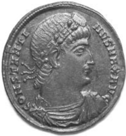
Obverse: head of Constantine