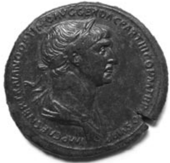
Obverse: head of Trajan