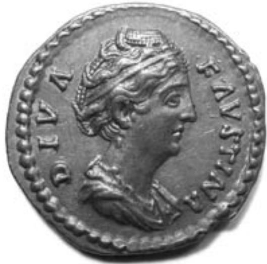
Obverse: head of Faustina I