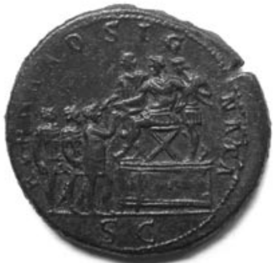
Reverse: client kings and emperor

The relatively large format of the sestertius, an orichalcum (brass) coin worth four asses, provided engravers with ample space to fashion highly intricate designs. Many sestertii feature imperial portraits hardly less impressive for their quality of workmanship than representations sculpted on a much larger scale. In fact, because the emperors are identified in accompanying legends, coin portraits can provide crucial evidence in the identification of likenesses of imperial figures in other media. Galba, who occupied the throne briefly in A.D. 69, after the death »