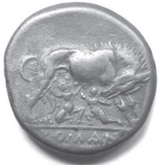
Reverse: she-wolf and twins