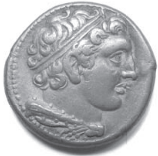
Obverse: head of Hercules