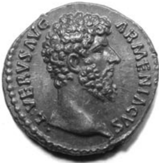
Obverse: head of Lucius Verus