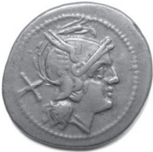
Obverse: head of Roma.