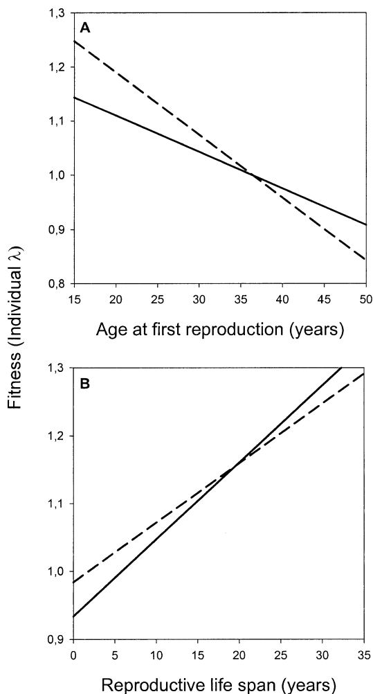
FIG. 2. Selection gradient analysis of age at first reproduction (A) and reproductive life span (B) on individual \lambda in twin (dashed line) and singleton mothers (solid line). Values of individual \lambda are predicted values from the model presented in Table 4.

We have shown that mothers who produced twins during their lifetime generally had higher fitness than mothers who only produced one offspring at a time among historical Sami women. This fitness advantage of twin mothers was manifested through all components of fitness and reproductive life-history traits studied except for interbirth intervals, a latter being predicted by the ‘insurance ova’ hypothesis. In addition, the productivity of twin deliveries of any gender combination markedly exceeded the productivity of singleton deliveries. However, the fitness benefits of twinning depended partly on the expressions of other life-history traits: when mothers started reproduction late, or had a particularly long reproductive life span, it was more advantageous to produce singletons only. These results indicate that the tendency for twinning in these historical human populations may not have been merely a maladaptive by-product of selection for other maternal reproductive traits, but likely favored by natural