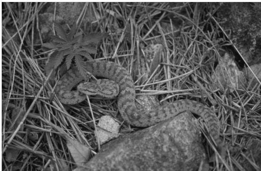
Fig. 2: Shedao pit-viper in a terrestrial ambush site

items. Freshly ingested prey could be distinguished from partially digested birds by palpation. Trials in which we measured dead birds, and then fed them to free-ranging snakes, showed that bolus diameters provide valid indices of prey sizes (maximum error 3 mm from five prey items). We painted a number on each snake's dorsal surface so that the animal could be identified without recapture on subsequent occasions.