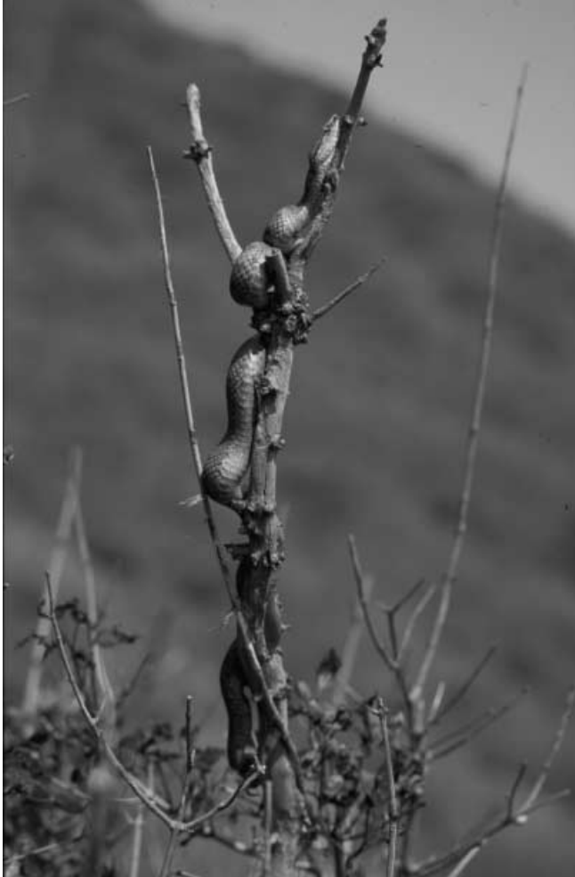
Fig. 1: Shedao pit-viper in ambush posture in a tree

They commenced feeding in the week before we arrived (L. Sun, pers. obs.), so our study spanned most of the main feeding activity for spring 2000.