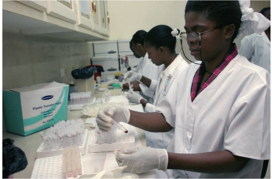
Testing 1, 2, 3. GHESKIO’s well-equipped labs ran 35,000 HIV tests last year, as well as thousands of CD4 counts, TB stains, and rapid tests for syphilis.