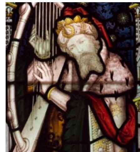
Above: Saundby, St Martin of Tours. Kempe (1886). See Calendar of Events.