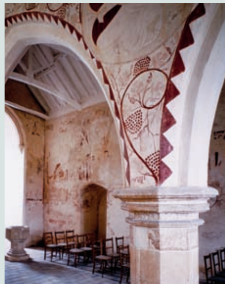
Right: Little Witchingham, St Faith, Norfolk.

To find out more visit our website www.visitchurches.org.uk , email events@tcct.org.uk or call our dedicated bookings and enquiries line 020 7213 0680.