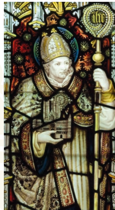
Saundby, St Martin of Tours. Kempe (1886). See Calendar of Events.

The Trust welcomes the occasion to celebrate this anniversary in association with the Victorian Society and the Kempe Society.