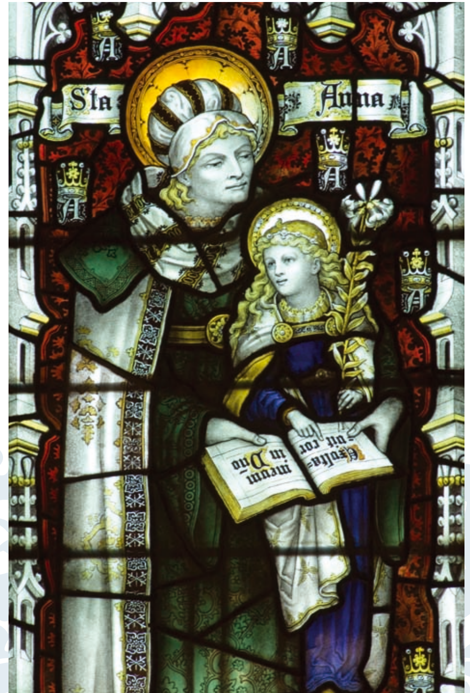
Opposite: Cambridge, All Saints. Kempe (1905). See Calendar of Events.

The ongoing legacy of both men is increasingly recognised and valued today.