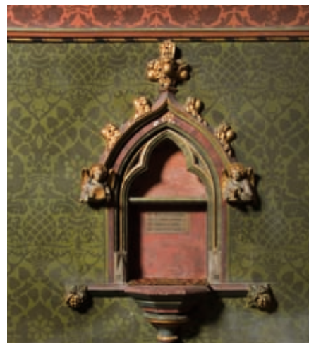
Above: Deene, St Peter. Bodley (1890s). See Calendar of Events.

To commemorate the centenary – using extensive research, paint samples and cutting-edge technology – we have been able to digitally recreate a small section of the chancel paintings. This innovative approach allowed us to create a considerable interpretative and educational resource whilst minimising potentially harmful physical intervention. We would now like to carry out other similar projects and are reliant upon the help of our generous supporters to do so.