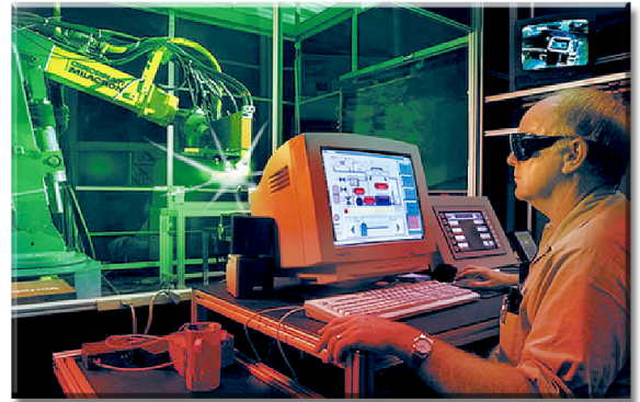
Infrared processing of materials at the Metals Processing Laboratory User Center