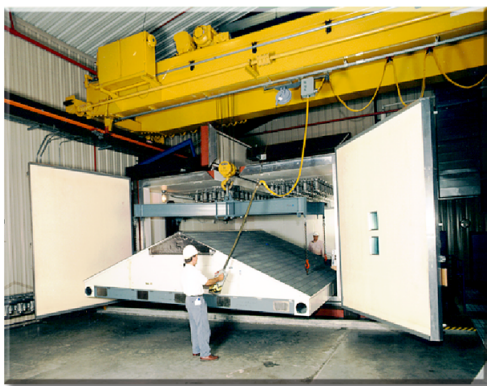
Attic module being loaded into the large-scale climate simulator at the Buildings Technology Center to test its thermal performance