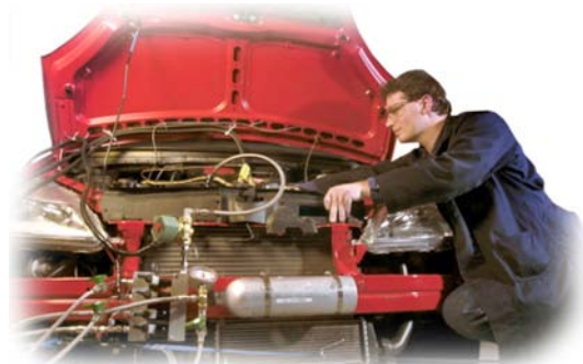
Engine research at the National Transportation Research Center

T he Energy Efficiency and Renewable Energy Program develops sustainable energy technologies to create a cleaner environment, a stronger economy, and a more secure future for our nation. The Program is committed to expanding energy resource options and to improving efficiency in every element of energy production and use