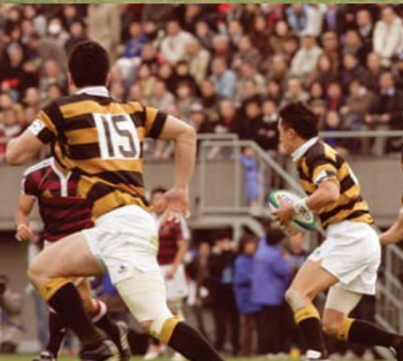
Rugby Football Club