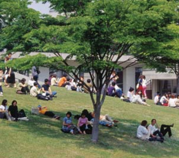
Banks of Gulliver Pond, SFC