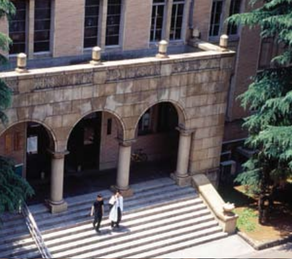
Kitasato Memorial Library, Shinanomachi Campus