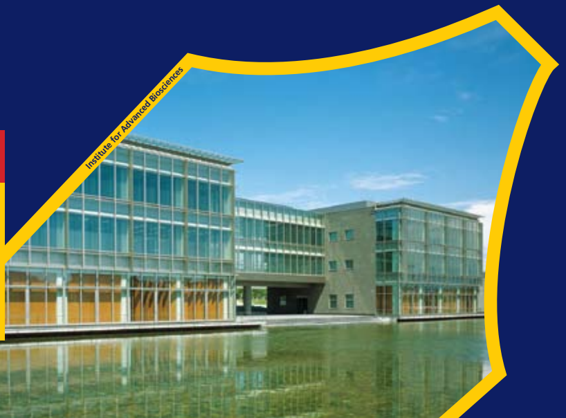
Institute for Advanced Biosciences

Keio has 12 Center of Excellence programs awarded by the Japanese government, the highest number of any private university