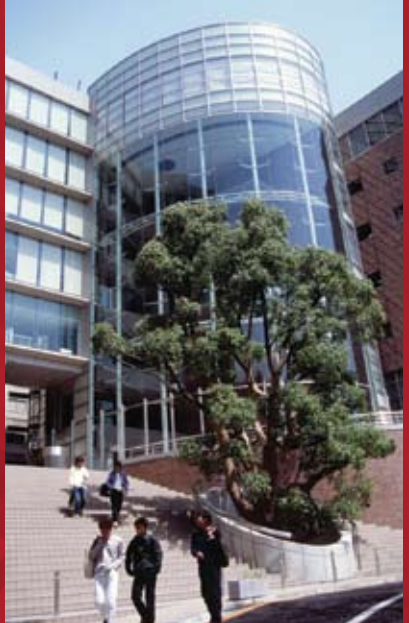
House of Creation and Imagination, Yagami Campus