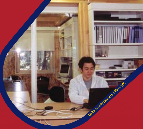
Delta faculty research office, SFC