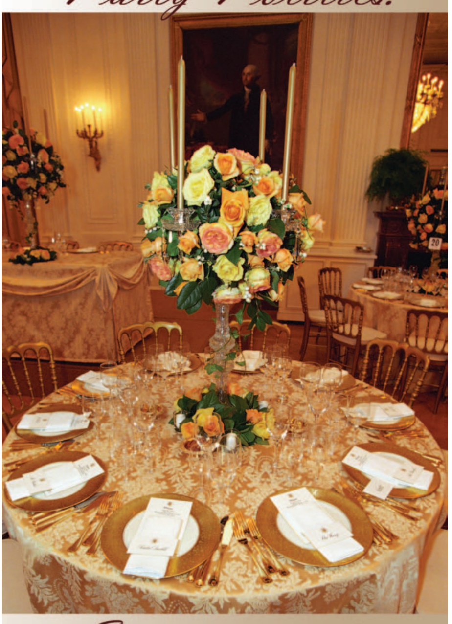
Entertaining at the White House