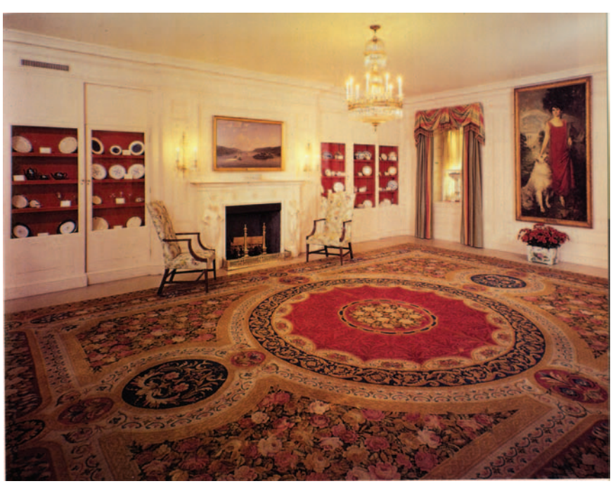
OPPOSITE PAGE: Lady Bird Johnson with Set Momjian; ABOVE: White House China Room