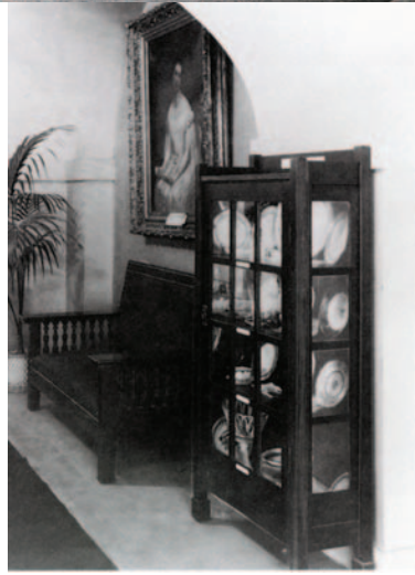
BELOW LEFT: Wilson eagle, BELOW RIGHT: FDR china