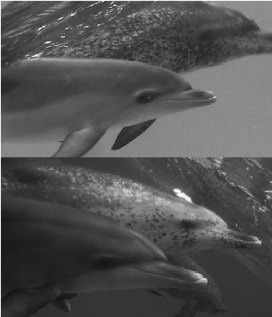
Figure 2. Top photo shows the hybrid calf with his adult (fused) spotted dolphin mother from GBB. Especially striking is the shorter rostrum of the hybrid calf. Bottom photo depicts a normal spotted dolphin calf with an adult (fused) spotted dolphin mother from LBB.

observed on GBB, with the exception of nocturnal feeding behaviour in deep water (Herzing & Brunnick, unpublished data). However, this is likely due to our lack of ability to do nocturnal work on GBB because of harsh weather conditions in the winter. The parallel observation of bottom foraging activity in the two locations is not surprising, considering the similar habitats and bottom ecology (both are western edges of the sandbanks juxtaposed to the deep waters of the Gulf Stream).