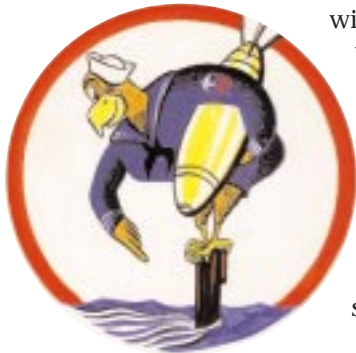
The squadron's second insignia was a cartoon designed eagle.

The first insignia was submitted by the squadron for approval shortly after VP-916 had been redesignated VP-ML-66. It was approved by CNO on 25 September 1947. The design was circular