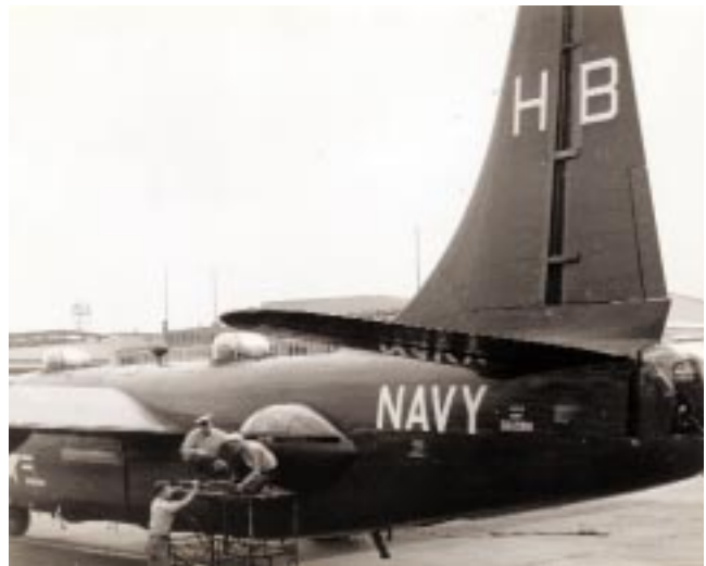
A close up of a squadron P4Y-2 showing personnel installing a .50 caliber machine gun in a side turret, 1952.

Nov 1960–Mar 1961: VP-11 participated in underwater sound tests (Project Breezeway) with the Office of Naval Research from November to December 1960. The squadron was again called upon to assist in tests of new sonobuoy equipment during January to March 1961.