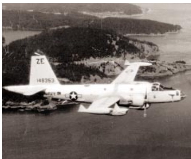
A squadron SP-2H in flight, 1966.

9 Jul 1965: The squadron deployed to MCAS Iwakuni, Japan, maintaining a detachment at NAF Tan Son Nhut. The deployment marked the first deployment of the squadron to a combat zone since the Korean Conflict.