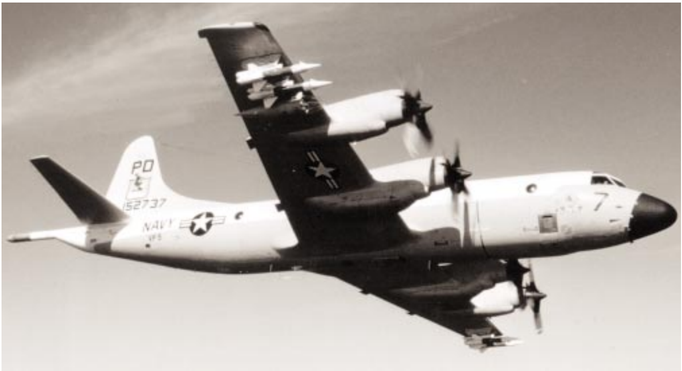
A squadron P-3B in flight with Bullpup missiles under the wings, February 1969. Note the squadron's insignia on both the tail and nose of the aircraft.

Taiwan, for one week commencing 4 December 1966 to participate in Operation Yankee Team. The joint U.S. Air Force and U.S. Navy operation inaugurated on 21 May 1963, provided low-level aerial reconnaissance of suspected Communist infiltration routes in eastern and southern Laos.