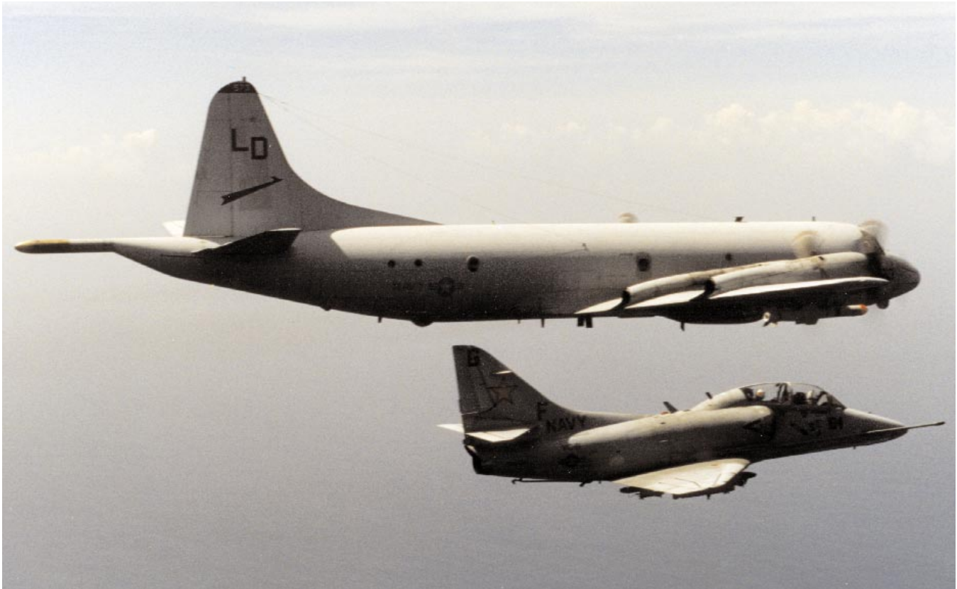
A squadron P-3C with a Harpoon missile under its wing being escorted by a TA-4J from VC-8, February 1996.

1 Jun 1991: VP-10 deployed to Sigonella, Sicily, and Jeddah, Saudi Arabia. The deployment had originally been planned for the Caribbean, but two factors changed those plans abruptly at the last moment: the disestablishment of VP-44 and Operation Desert Storm. In 4,500 accident-free flight hours during deployment, the squadron flew the equivalent of 6.5 times around the earth.