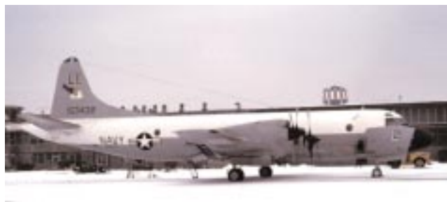
A VP-11 P-3B at NAS Glenview in February 1980.

13 Dec 1985–24 May 1986: VP-11 deployed to NAS Keflavik, Iceland, returning to NAS Brunswick on 24 May 1986. During the deployment the squadron collected environmental data on the Marginal Ice Zone, and tested the efficiency of ice-penetrating sonobuoys.