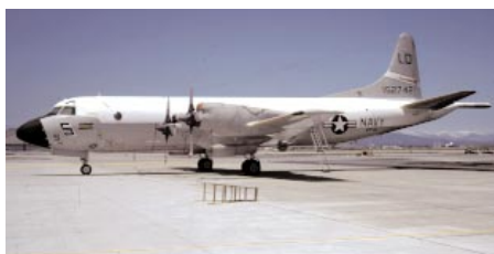
A VP-10 P-3B at NAS Moffett Field in June 1979.

‡ FAW-5 was redesignated PatWing-5 and COMPATWINGSLANT on 1 July 1973, a dual hatted command. On 1 July 1974 Patrol Wing 5 (PatWing-5) was established as a separate command.