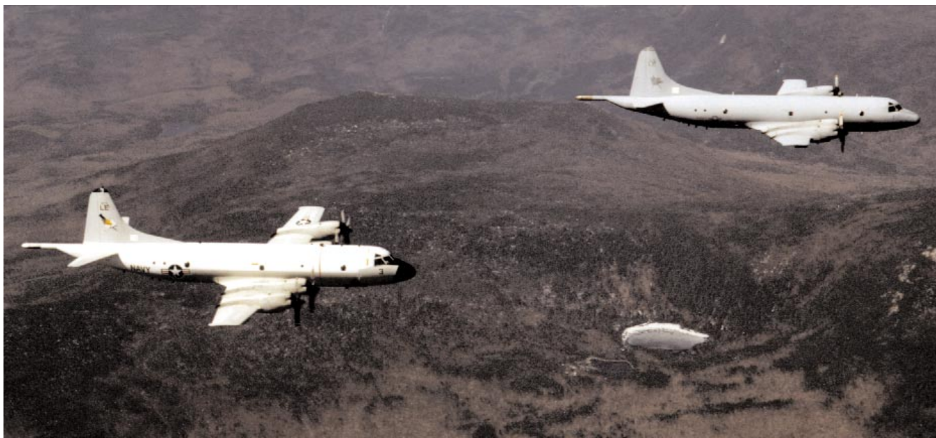
Two squadron P-3Cs in flight, circa early 1990s.

300 hours in support of task force operations, resulting in severe disruption of the drug smuggling routes into the U.S.