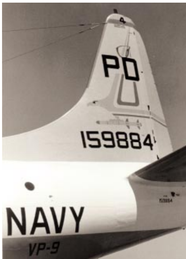
A close up of a squadron P-3 tail with the squadron's third insignia and tail code PD.