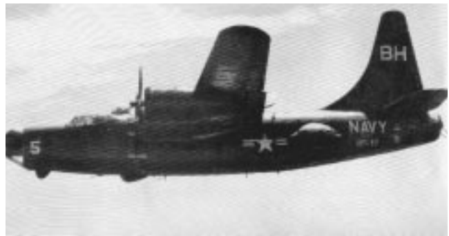
A squadron P4Y-2 (PB4Y-2) in flight.

Feb 1950: VP-ML-66 was redesignated VP-772 during the reorganization of Naval Aviation reserve units in 1949, but the change did not take effect until February 1950. During this period the number of Naval Aviation reserve squadrons was reduced from the 1949 total of 24 to 9.