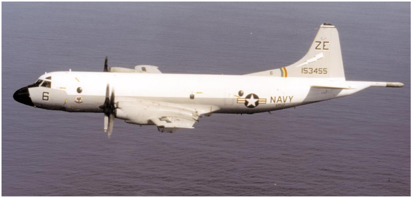
A squadron P-3B in flight off the coast of Hawaii, 1978.