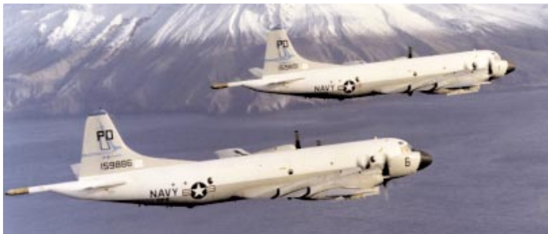
Two squadron P-3s in flight near Great Sitkin Mountain, Adak, Alaska.