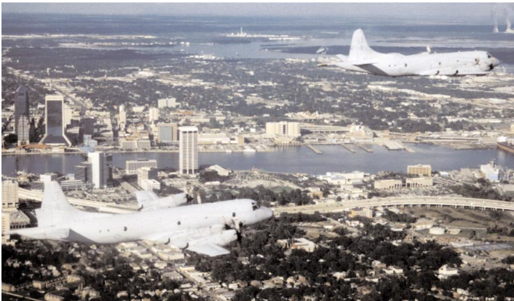
A couple of squadron P-3Cs fly over Jacksonville, Fla., December 1994.