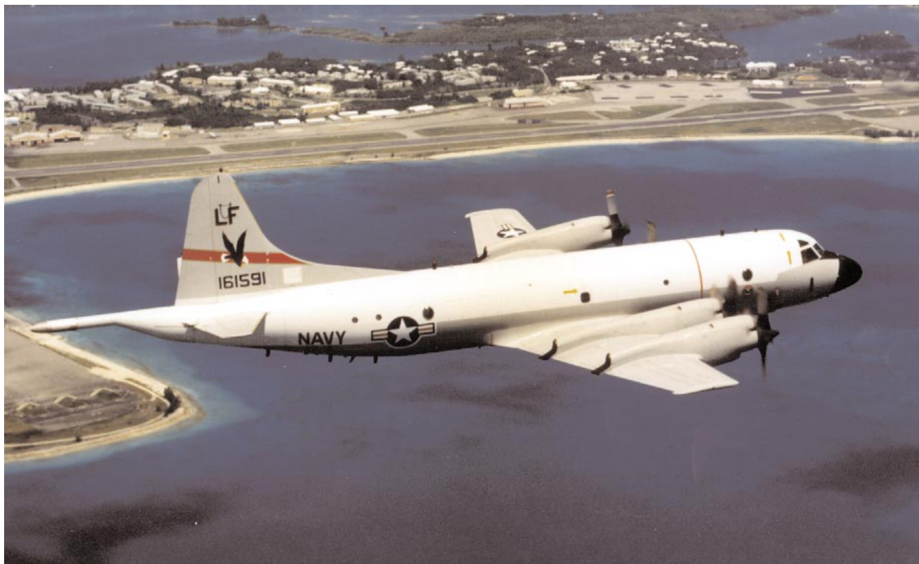
A squadron P-3C in flight, 1990.

10 Aug 1988: VP-16 deployed to NAS Bermuda, relieving VP-24. The squadron participated in Operation Checkmate 7, interdicting suspected drug trafficking in the Caribbean.