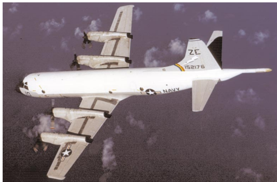
A squadron P-3 in flight.