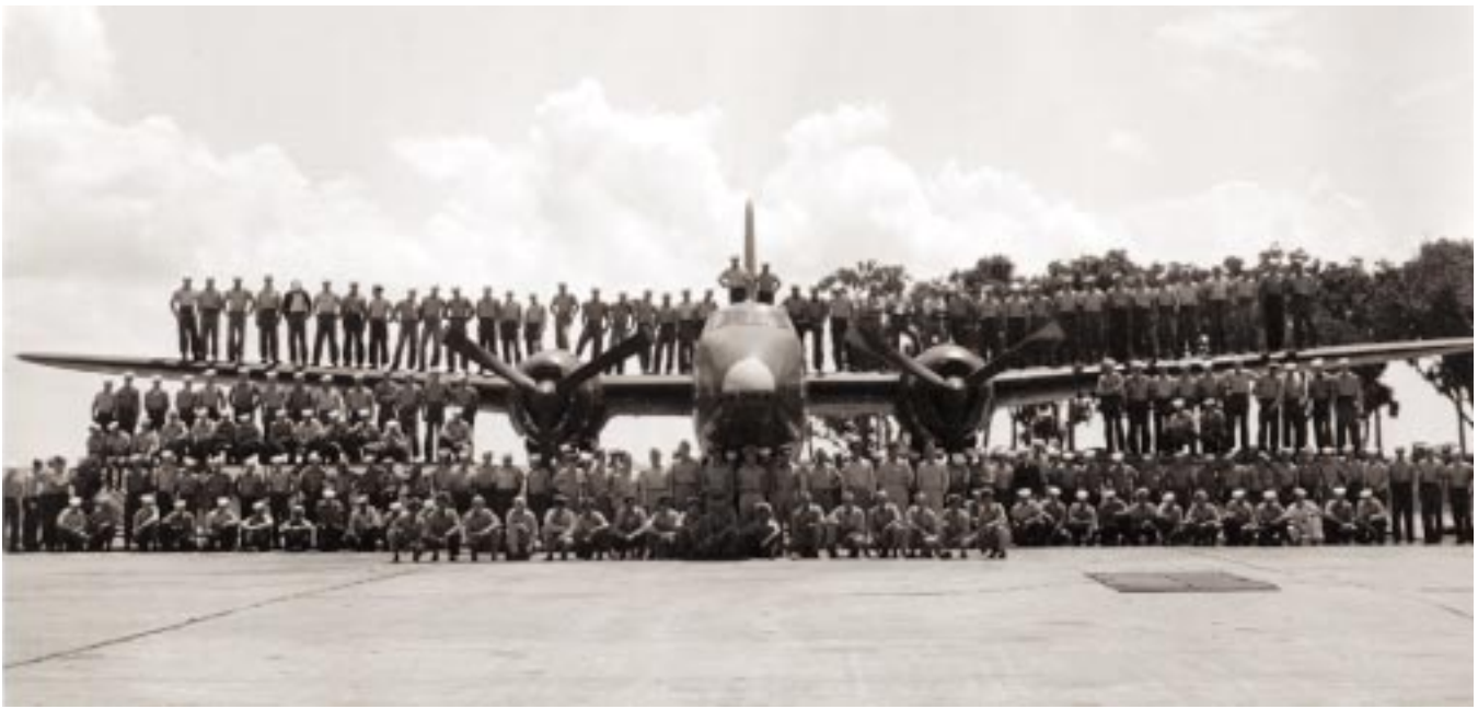
Squadron personnel surrounding one of its P2Vs at NAS Jacksonville, 1952.

nated VP-16. The redesignations did not require changes in tail codes or home ports.