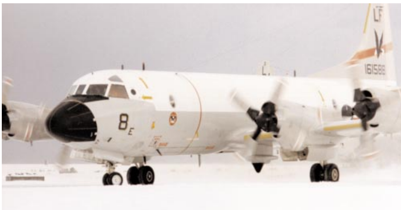
A squadron P-3C in the snow, most likely Keflavik, 1984.