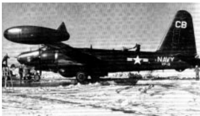
A squadron P2V at NAS Atsugi, Japan, 1954.

22 Jun 1955: While patrolling in the Aleutians area, a P2V-5 (BuNo 131515) of VP-9 based at NAS Kodiak, Alaska, was attacked by two Russian MiG-15s. The Neptune's starboard engine was hit and caught fire, forcing the crew to crash on St. Lawrence Island near Gambell in the Bering Sea. There were no fatalities to the crew of 11, but four were injured by MiG gunfire and six others were hurt in the crash landing. This is