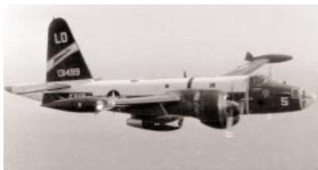
A squadron P2V in flight.

Oct 1954: VP-10 deployed to Keflavik, Iceland. During the period of Icelandic patrols, the squadron was tasked with conversion from the P2V-5 to the