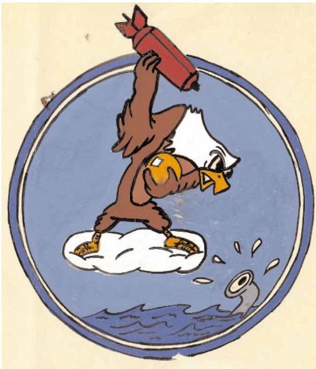
The second approved insignia used by the squadron was a cartoon design depicting an eagle.

orange, rust, green and red. The design was approved by CNO on 11 July 1951, and remained in use until 1954.