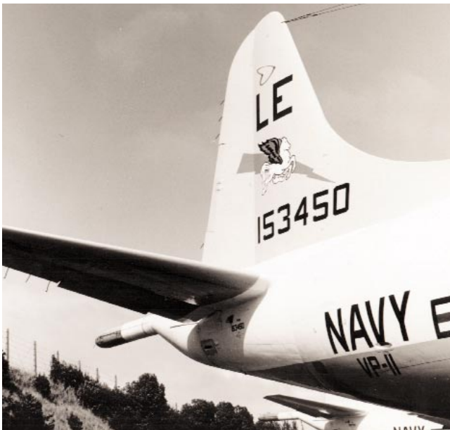
A close up of a squadron P-3 tail with the insignia and tail code LE.

‡ FAW-5 was redesignated PatWing-5 and COMPATWINGS LANT on 1 July 1973, a dual hatted command. On 1 July 1974 Patrol Wing 5 (PatWing-5) was established as a separate command.