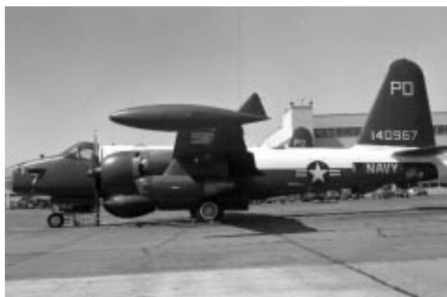
A squadron SP-2H at NAS Alameda, July 1963.

the only incident in which the Soviet Union admitted any responsibility.