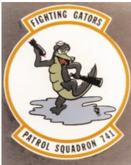
The squadron's first insignia was a cartoon designed alligator.

The first insignia used by the squadron was approved by CNO on 15 October 1951 when it was still VP-741. The design featured a Disney-like alligator wearing a sailor's hat with a spy glass in its left hand and in its right a bomb poised ready to throw at a