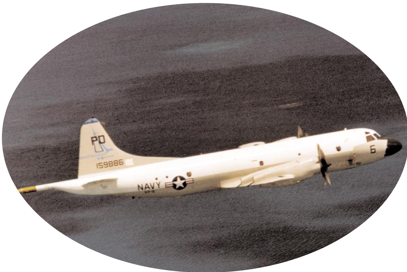
A squadron P-3C in flight, 1984.

Jan–Mar 1991: Three VP-9 detachments were sent to Panama on one-month deployments to assist the drug interdiction effort.