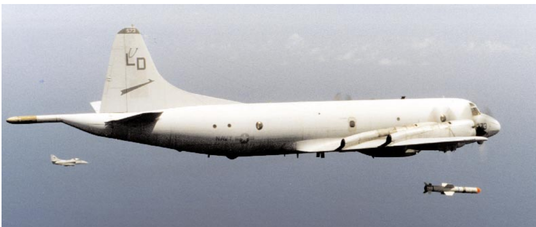
A squadron P-3C firing a Harpoon missile, February 1996.

Location Date of Assignment NAS Brunswick, Maine Feb 1952