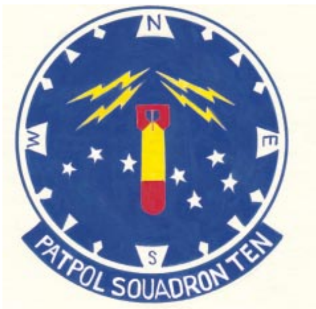
The squadron's insignia was developed from a design used by a former VP-10.

In an effort to establish a link with the history of the previous VP-10 (disestablished as VPB-23 on 25 January 1946), the squadron adopted the insignia devised by the earlier organization upon its formation in 1930. The date on which the official insignia of the squadron was accepted by CNO is unknown. A compass rose with the Big Dipper and Polaris as