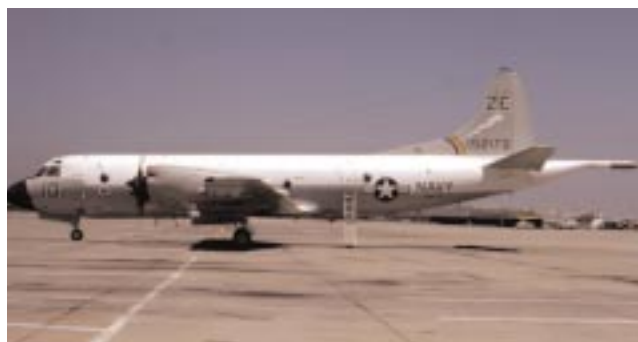
A VP-17 P-3A at NAS Moffett Field in November 1975.