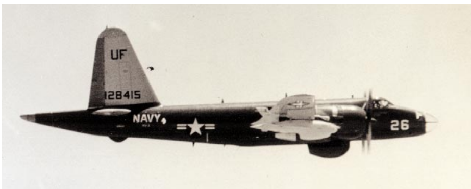
A squadron P2V in flight.

2 Dec 1966: VP-17 deployed to NS Sangle Point, R.P., with a detachment at NAF U-Tapao, Thailand. During the deployment the squadron missions in-