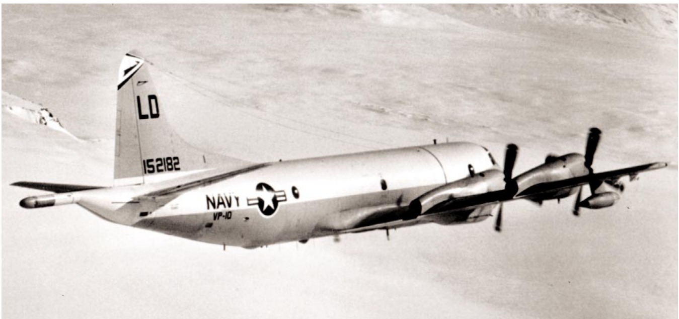
A squadron P-3B in flight over the Arctic, 1967.

26 Jul 1981: VP-10 deployed to NAS Keflavik, Iceland. During the deployment the squadron was engaged in operation Ocean Venture against numerous friendly "targets." One of the players in the exercise turned out to be a Soviet Papa-class submarine that had wandered into the area while trying to conduct surveillance of the NATO surface activities. The successful exposure of the submarine and the squadron's general performance during the deployment earned VP-10 a Meritorious Unit Commendation from the Secretary of the Navy.