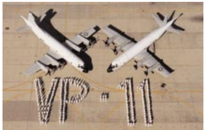
Two squadron P-3s on the tarmac with personnel forming the designation VP-11.