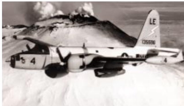
A squadron P2V in flight, circa late 1950s.