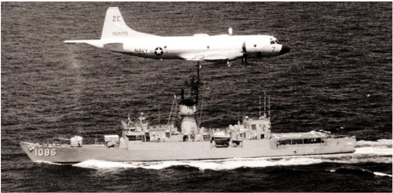
A squadron P-3B flying over Brewton (DE 1086) during an antisubmarine exercise, 1974.

Thailand and Taipei, Taiwan. Ninety-three Market Time patrols were flown along the coast of South Vietnam. The squadron was relieved by VP-48.