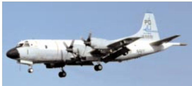
A VP-9 P-3C(U) on approach to NAS Moffett Field in May 1982.