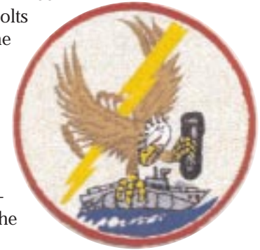
The squadron's third insignia kept the eagle theme but dropped the cartoon style.

A third insignia was submitted to CNO for approval after VP-772 was redesignated VP-17. CNO approved the design with minor changes on 11 May 1955. The insignia featured an eagle with raised wings, clutching a submarine in one claw and a bomb in the other. Three small white lightning bolts were highlighted on the wings and a large lightning bolt slanted downward between the upthrust wings. The new squadron designation, Patron Seventeen was enclosed in a scroll at the bottom of the design.