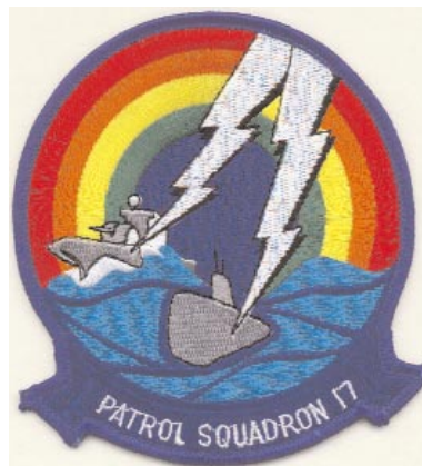
The fourth insignia dropped the eagle theme and more accurately represented the squadron's mission of antisubmarine and antisurface warfare.

The fourth squadron insignia of VP-17 was approved by CNO on 22 December 1989. The new design featured a surface vessel and a submarine, joined