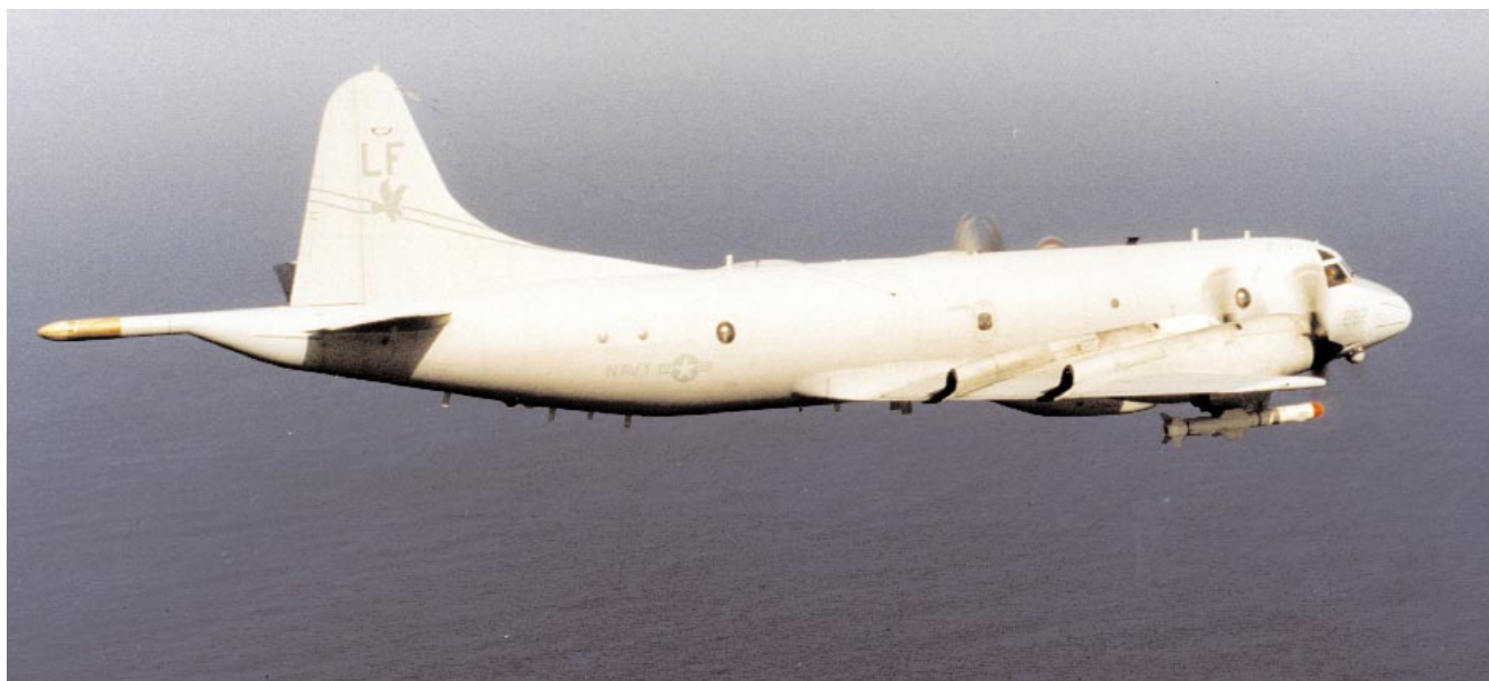
A squadron P-3C carrying a Harpoon missile en route to Vieques Island, Puerto Rico for a test launch, February 1996.