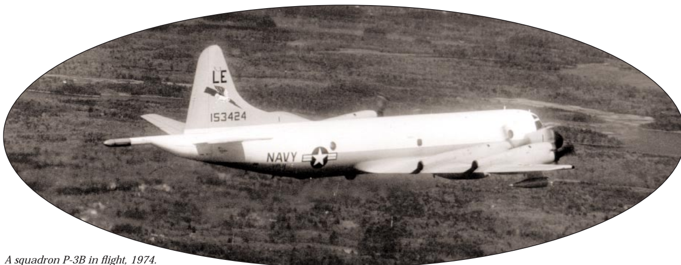
A squadron P-3B in flight, 1974.

record rainfall of 74.4 inches. Despite the difficulties, the squadron was able to conduct assigned sector patrols of the South China Sea and Gulf of Tonkin. For its humanitarian efforts during disaster relief operations in the Philippines, the squadron was awarded a Philippine Presidential Unit Citation.