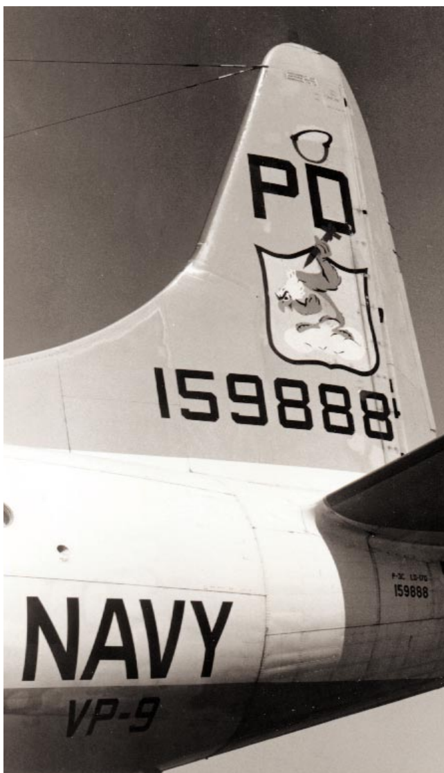
A close up of a squadron P-3 tail with the squadron's second insignia and tail code PD.