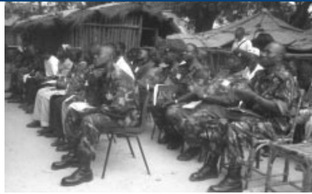
In Sierra Leone and other countries involved in post-conflict reconciliation, NDI works to promote dialogue and confidence among civic, political and military leaders, and to enhance understanding about the role of the armed forces in a democratic society.

The Institute has provided technical assistance for political parties and civic groups to conduct voter and civic education campaigns, and to organize election monitoring programs, such as pollwatching and independent vote counts. The Institute has also organized more than 50 international observer delegations that have attested to the honesty of electoral procedures, helped deter electoral misconduct or exposed fraud.