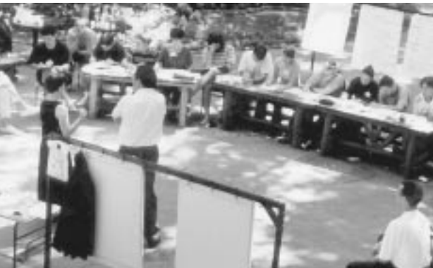
NDI assists democratic party leaders and activists in Serbia with developing the organizational skills needed to provide an alternative to extreme nationalism and compete for public support.

Elections must be open and democratic if people are to have confidence in the political system. An election is a dynamic process in which members of political parties, civic organizations and other institutions must systematically acquire the skills necessary to participate in the political life of a country. Political parties and governments have asked NDI to study the electoral codes of their countries and to recommend improvements.