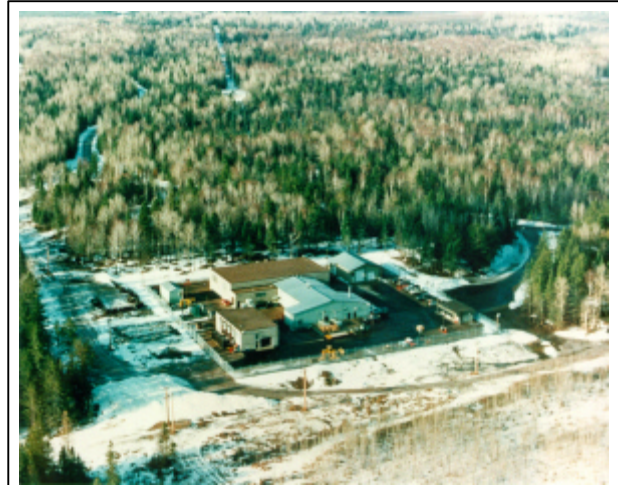
Clam Lake, Wisconsin ELF transmitter site

ELF communications systems make use of a principle in physics where the attenuation of radio signals (electromagnetic waves) from seawater increases with the frequency of the signal. This means that the lower the frequency a radio transmission, the deeper into the ocean a useable signal will travel. Radio waves in the Very Low Frequency (VLF) band at frequencies of about 20,000 Hertz (Hz) penetrate seawater to depths of only tens of feet. The Navy’s ELF system operates at about 76 Hz, approximately two orders of magnitude lower than VLF. The result is that ELF waves penetrate seawater to depths of hundreds of feet, permitting communications with submarines while maintaining stealth.