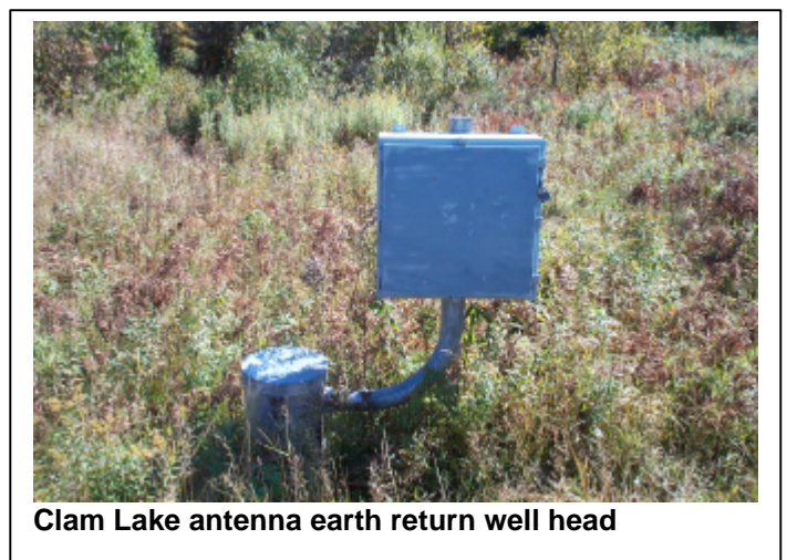
Clam Lake antenna earth return well head

Based on the success of this previous ground terminal upgrade work, the Navy anticipates replacing the other existing grounds for the antenna at the Clam Lake site in the next several years. In conjunction with these upgrades, the Navy will work with the U.S. Forest Service – the manager of the Chequamegon National Forest – to ensure the required ecological, environmental, cultural and historic requirements are met.