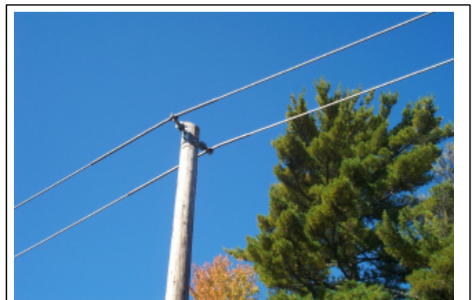
View of a typical Clam Lake ELF antenna