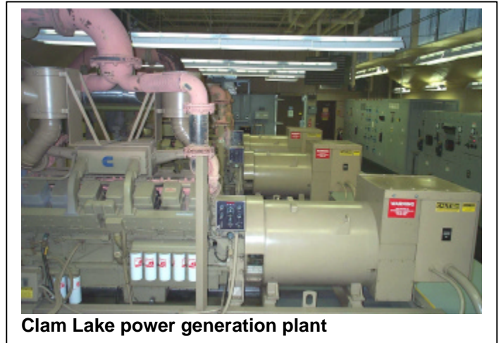
Clam Lake power generation plant

The Navy estimates the local economic impact of the Clam Lake facility to be approximately $6,000,000 annually. The Clam Lake facility, is staffed by two NCTAMS LANT civil service employees and about 30 contractor employees. The facility spends about $2,000,000 per year in employee payroll and local supplies and services (FY2000). The site staff operates the transmitter facility, conducts maintenance on the equipment and antenna system, and maintains the antenna right of way. The facility purchases services and supplies such as electricity, trash removal, fuel for vehicles and generators, office supplies and materials locally. The Navy spends about $400,000 annually on electricity purchased from the local Wisconsin power utility. When the local Wisconsin utilities experience near peak electrical demand, the Naval transmitter facility can bring as many as three Cummins diesel 1,000 kilowatt three phase power generators online to supply up to three million watts of power for the site – making the power normally used by the site available to local electric power companies to meet their peak load requirements.