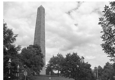
Bunker Hill Monument

During the immediate post-war period, the area began a decline that did not begin to reverse until the urban renewal efforts of the 1970s. This urban renewal process, now nearing completion, was part of a larger revival and rebuilding initiative that has helped restore the community, perpetuating further growth and improvement. A key part of this new growth has been the redevelopment of the Charlestown Navy Yard for office, research, and residential uses. Another promising development has been the depression of the Central Artery in the City Square-Charlestown Navy Yard Area, a project known by its acronym CANA - Central Artery North Area. With adjacent urban renewal parcels poised for mixed-use development, the recent opening of the new Paul Revere Park (MDC), and the