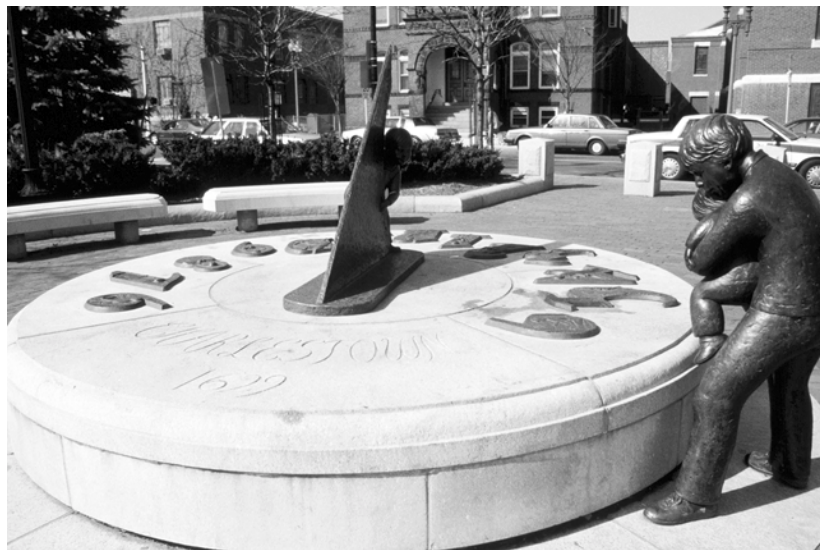
Hayes Square, Charlestown