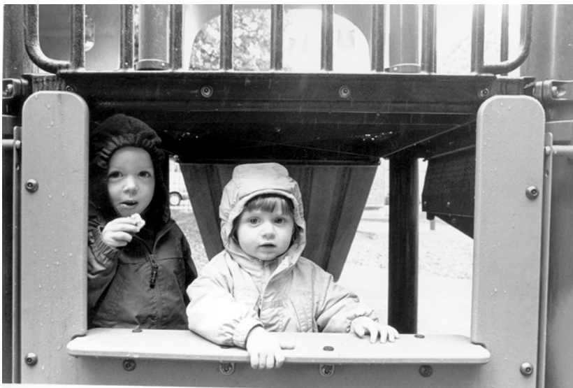
John Harvard Mall Playlot

Rich in passive open space, the Town Hill/Breed's Hill area has easy access to active recreation space to accommodate the expanding population: at Bunker Hill Community College (tennis courts and playing fields), the Navy Yard (tennis courts), Paul Revere Park (play lot and playing field), Rutherford Union (play lot and tennis court), and Harvard Mall (playlot). There have been improvements to, and promise to be more, connections to the riverfront from the Town Hill/Breed's Hill area, thanks to the recent opening of Paul Revere Park and the future development of CA/T mitigation parks in the New Charles River Basin. Connections to the harborfront will also improve thanks to Chapter 91/Harborwalk requirements for developments at Tudor Wharf.