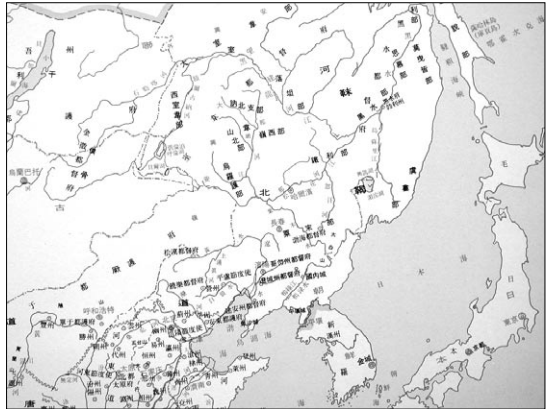
Picture 3. A history map without Balhae in its place, Shanxi Provincial Museum ed., 1990

described Balhae to have been headed by the Sokmal section of the Malgal tribe and was founded in a vast area as one of the Chinese local entities, and the latter described Balhae as a local ethnic entity under the jurisdiction of the Chinese Tang dynasty (Wang Chengli 1984: 1; Zhu Guochen and Wei Guozhong 1984: 1). The former book was a collection of previous works from the author, so we can see that before China began its so-called “reformation efforts” they had already established certain perimeters regarding studies of the Balhae history. There are certain historians who disagree with these semi-official theories, but the atmosphere does not allow them to freely express their opinions. There is even the case of a researcher who stated that Balhae also partially inherited certain Goguryeo qualities, but such an approach was rejected by the editor under the ultimatum of “change the attitude and perspective.”