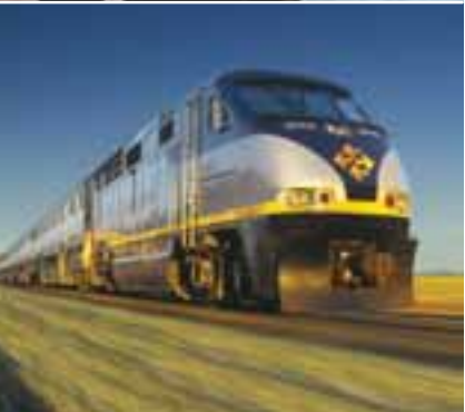
From top: ridership increases; BART Police K9 unit on duty; Capitol Corridor Intercity Rail