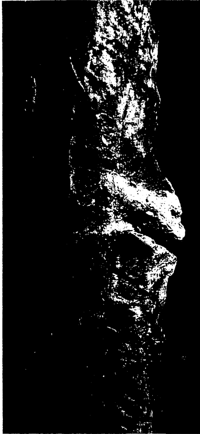
The scar on the left ninth rib of Shanidar 3 is a partially healed wound inflicted by a sharp object. This wound is one of the few examples of trauma caused by violence.

the rib, the angle of the incision, and the cleanness of the cut make it highly unlikely that the injury was accidentally inflicted. In fact, the incision is almost exactly what would have resulted if Shanidar 3 had been stabbed in the side by a right-handed adversary in face-to-face conflict. This wound therefore provides conclusive evidence of violence between humans, the only evidence so far found of such violence among the Neanderthals.