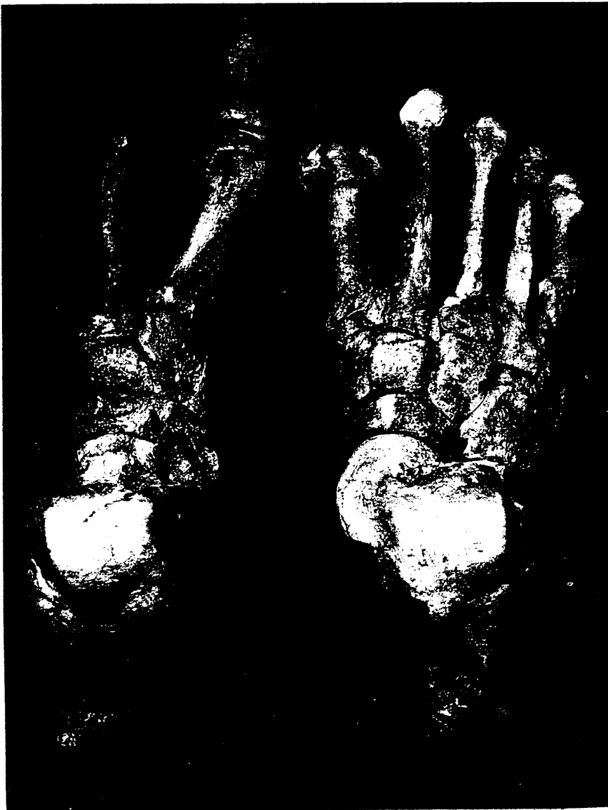
The ankle and big toe of Shanidar 1's right foot show evidence of arthritis, which suggests an injury to those parts. The left foot is normal although incomplete.