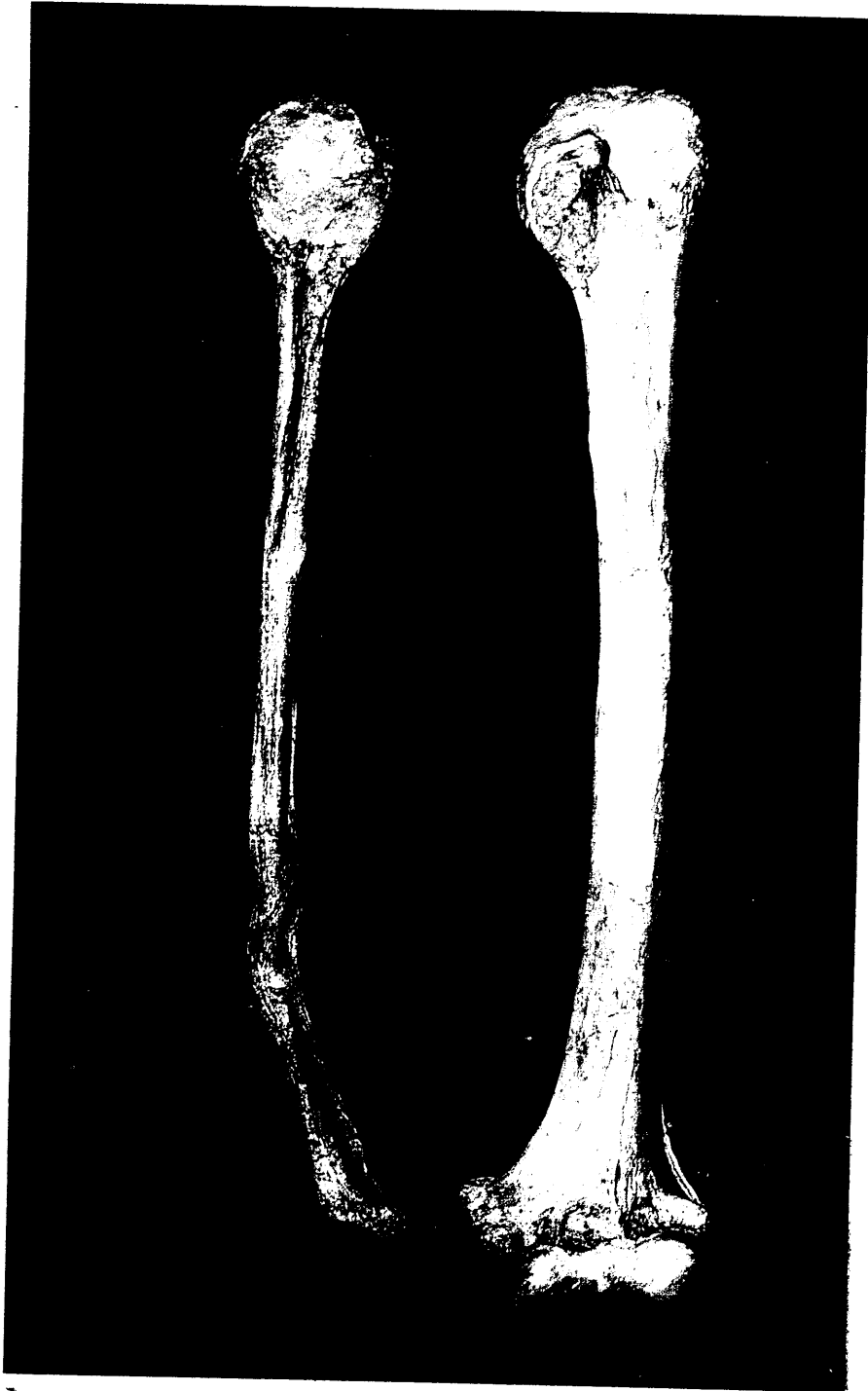
Diagonal lines on these two arm bones from Shanidar 1 are healed fractures. The bone on the right is normal. That on the left is atrophied and has a pathological tip, caused by either amputation or an improperly healed elbow fracture.

one of arms to rival those of the mightiest blacksmith.