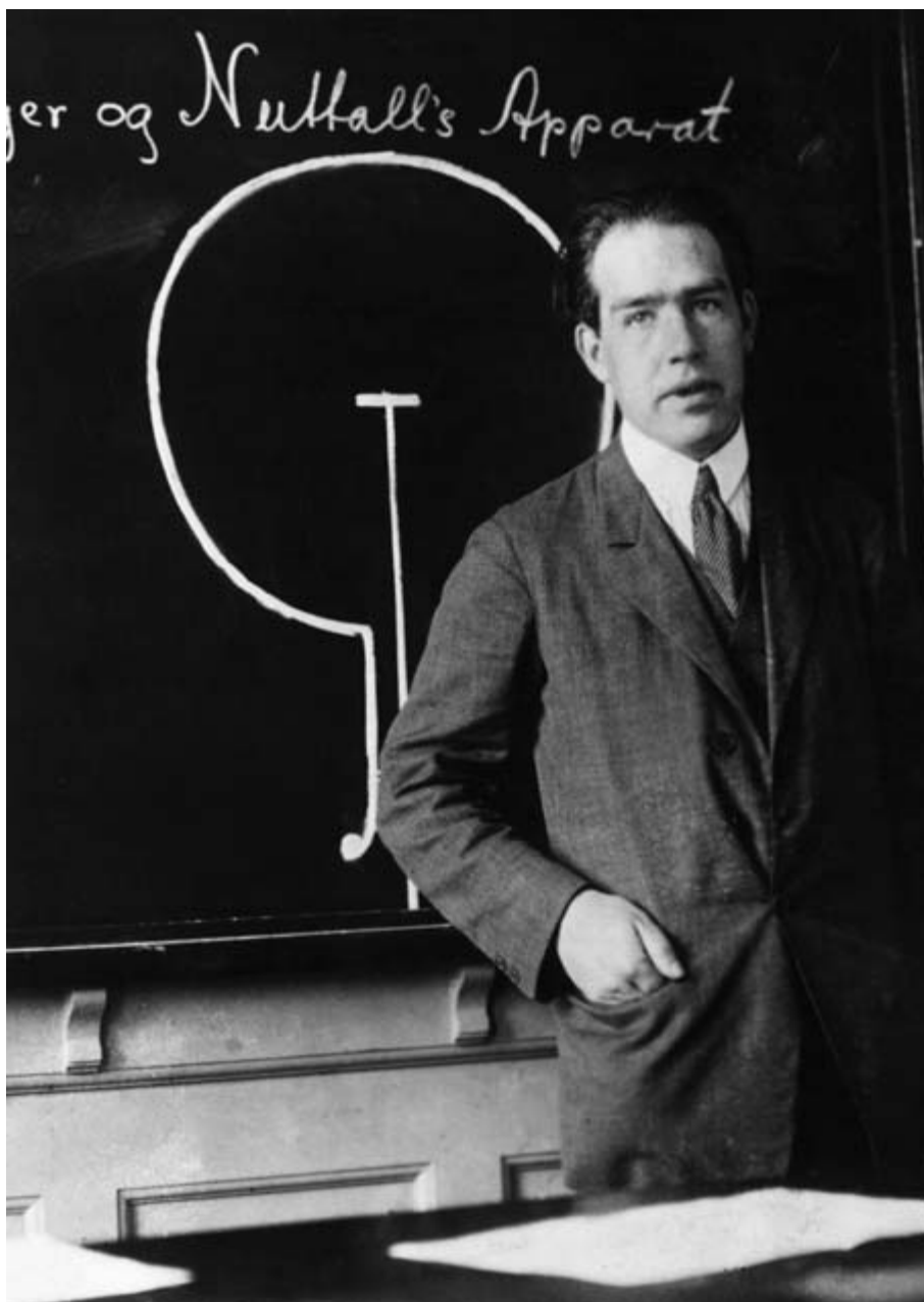
Niels Bohr, elected 1945

Current affiliation : Niels Bohr Institute, Copenhagen, Denmark