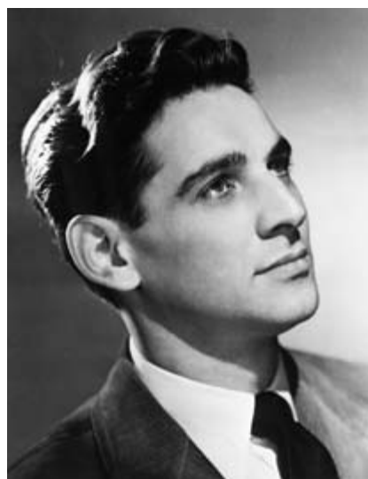
Leonard Bernstein, elected 1951