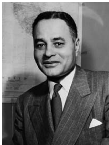
Ralph Bunche, elected 1951

Bunsen, Christian Carl Josias, Freiherr von (1791 – 1860) Election : 1853, FHM Affiliation at election : Government of Prussia Residence at election : Bonn, Germany Career description : Diplomat ; Philosopher ; Theologian