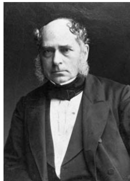
Henry Bessemer, elected 1895

Bertozzi, Carolyn R. (1966 – ) Election : 2003, Fellow Affiliation at election : University of California, Berkeley Residence at election : Berkeley, CA Career description : Chemist ; Molecular and cellular biologist ; Educator Current affiliation : Same