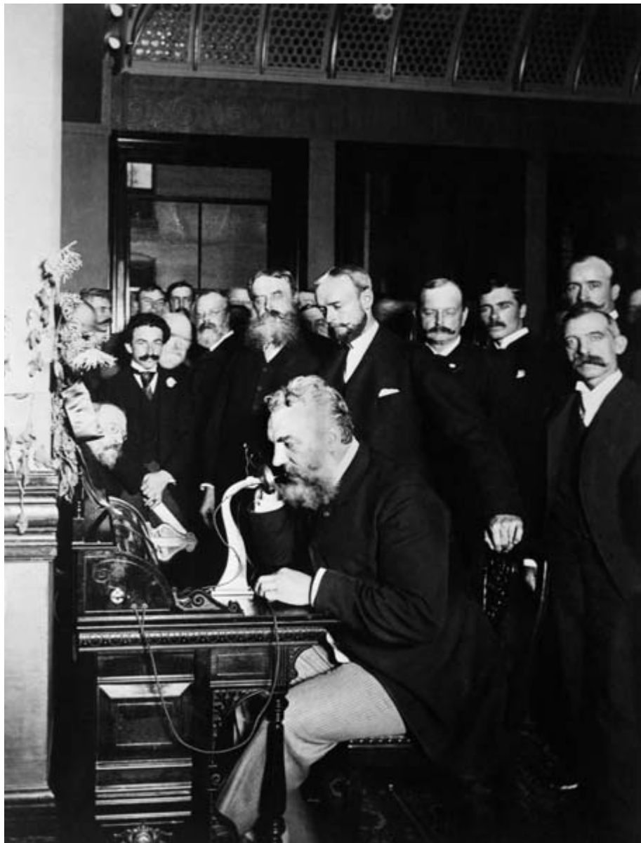
Alexander Graham Bell, elected 1877

Career description : Electrical engineer; Company research and development executive (computers) Current affiliation : Microsoft Corporation