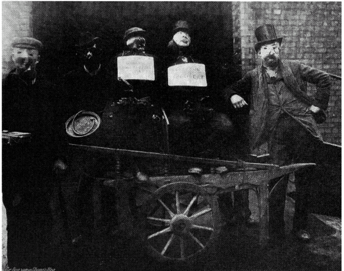
Sir Benjamin Stone took the Photograph above of guys at Windsor in 1903. Both guys and collectors are masked

"This is the day they did contrive To blow up King and Parliament alive Through God's great mercy they were taken With a slow fuse and a dark lantern Holler boys, holler boys, God Save the Queen Penny for the Guys"