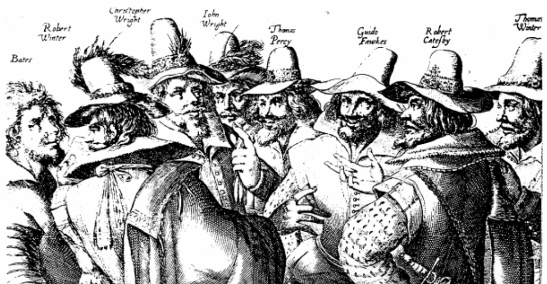
The plotters, from a 1605 French print. Whether the figures depicted bear any resemblance to what the plotters actually looked like is, of course, open to conjecture

In any case, it is clear that five conspirators: Robert Catesby, Thomas Winter, Thomas Percy, John Wright and Guy (or Guido, the Spanish form of the name) Fawkes, later joined by Robert Keyes, determined during 1604 to undertake the blowing up of the House of Lords. The detonation was to take place on State Opening day, when the King, Lords and Commons would all be present in the Lords Chamber.