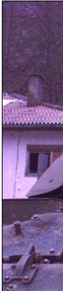
A Bradley Infantry