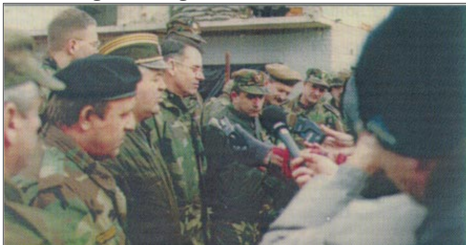
55th Signal Company (Combat Camera)