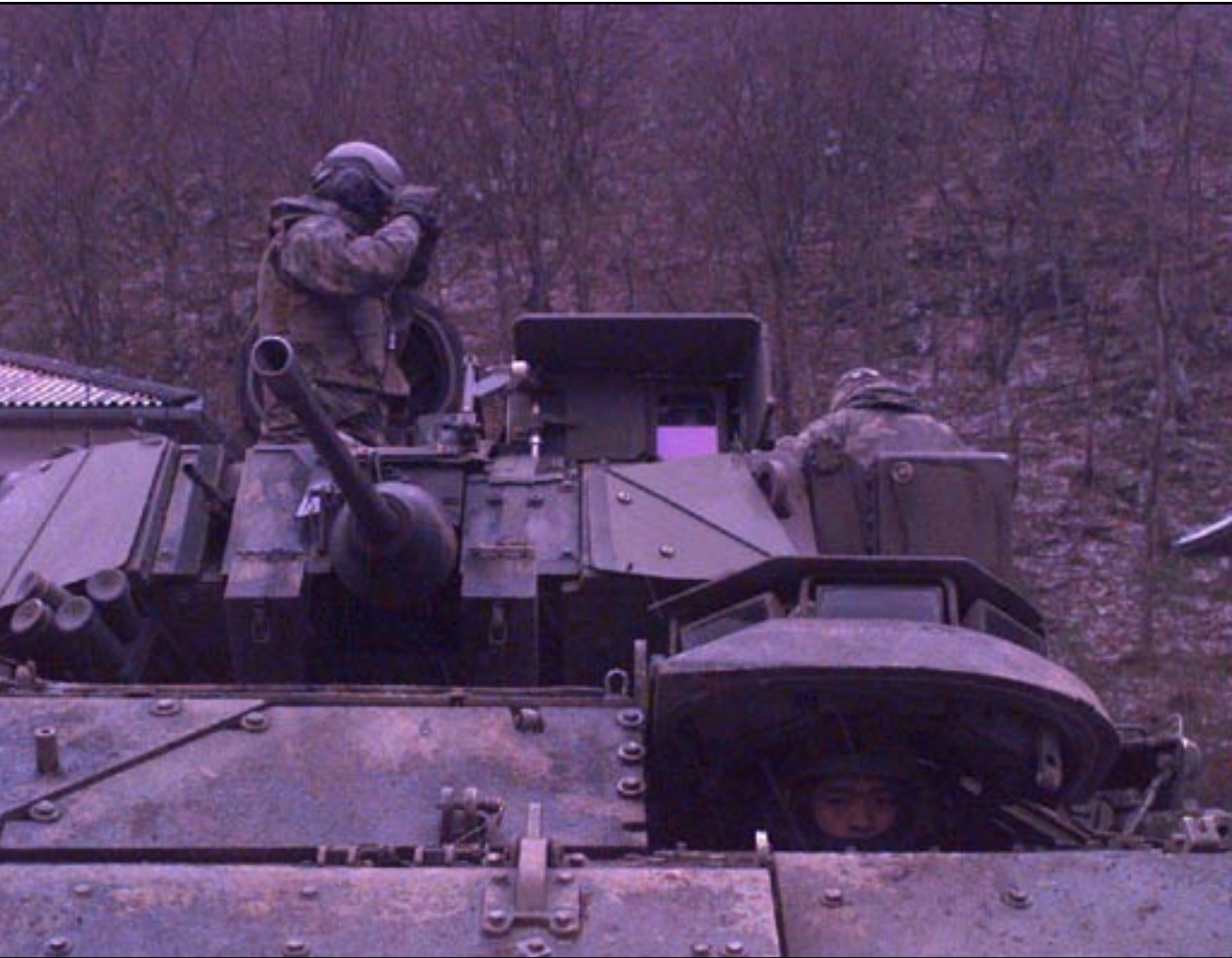
Fighting Vehicle stands ready for action — and as a deterrent — at Checkpoint No. 30 in the 2nd Brigade sector.