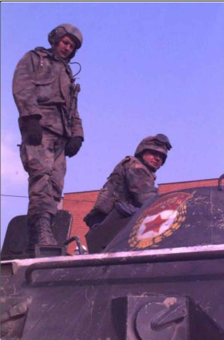
Soldiers inspect a Russian BTR-80 during a joint patrol.

The brigade headquarters is located at Base Camp Lisa; 2nd Battalion, 68th Armor, Camp Linda; B and C Company, 3rd Battalion, 12th Infantry, Camp Linda; 4th Battalion, 12th Infantry, Camps Demi and Pat; 3rd Squadron, 4th Cavalry at Camps Molly and Alicia; 47th Main Support Battalion, Camp Angela; and the 40th Engineer Battalion, Camp Lisa.