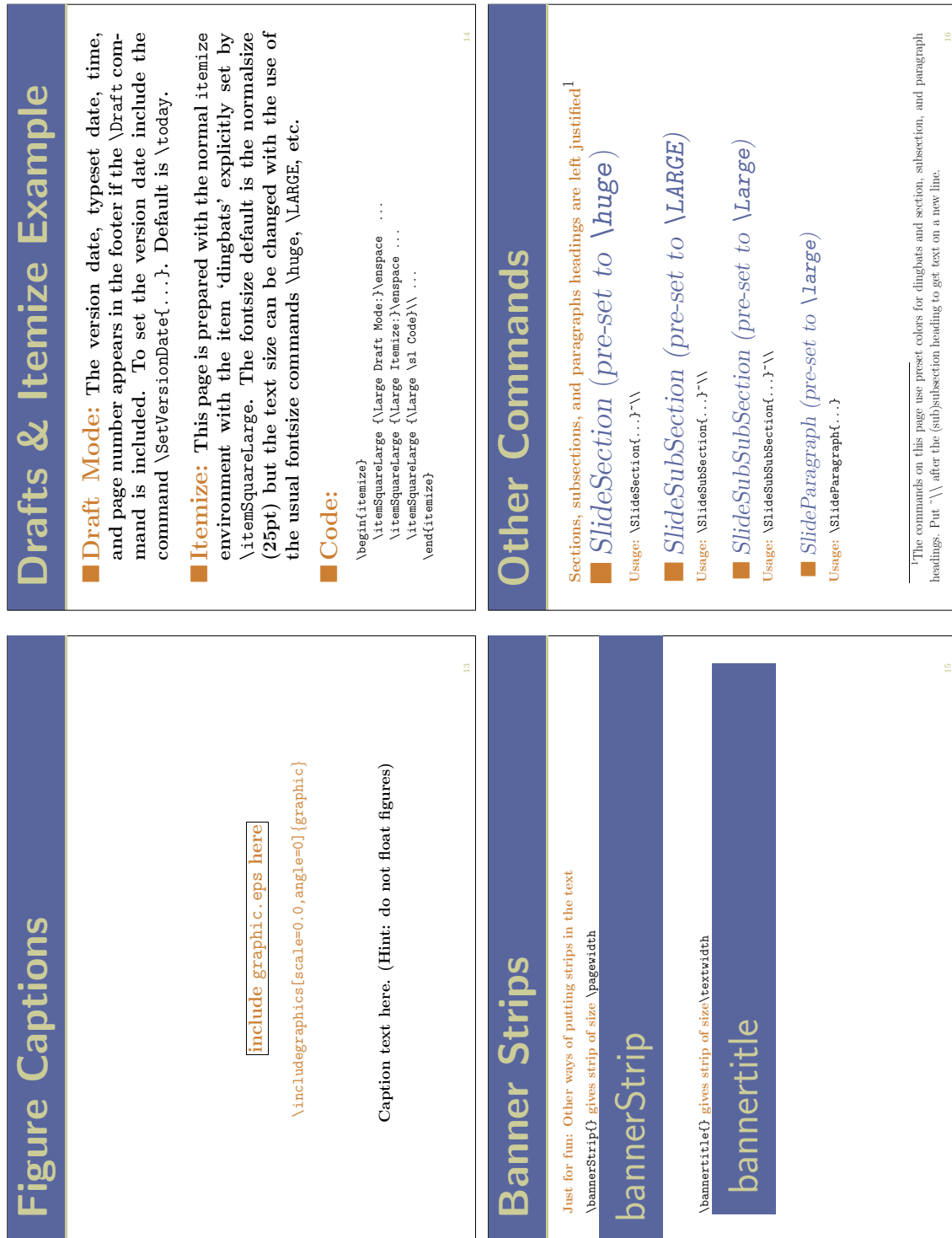
Figure 4: Marsden Slide Package Documentation; pages 13–16, showing how to include graphics and colored banners, as well as examples of inserting dingbats either explicitly or implicitly.