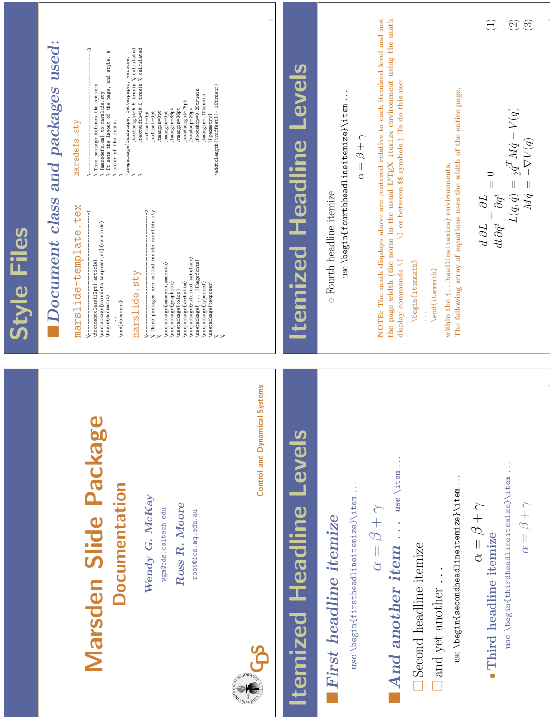
Figure 1: Marsden Slide Package Documentation; pages 1–4, showing different heading levels with associated bullets, coloring and font-sizes. Also some mathematics is shown.