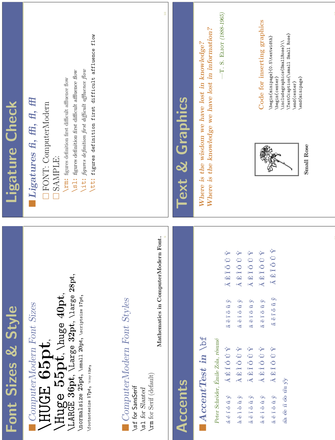
Figure 3: Marsden Slide Package Documentation; pages 9–12, showing the sizes associated with L A T E X’s size commands, and examples testing that ligatures and accents are correctly formed.