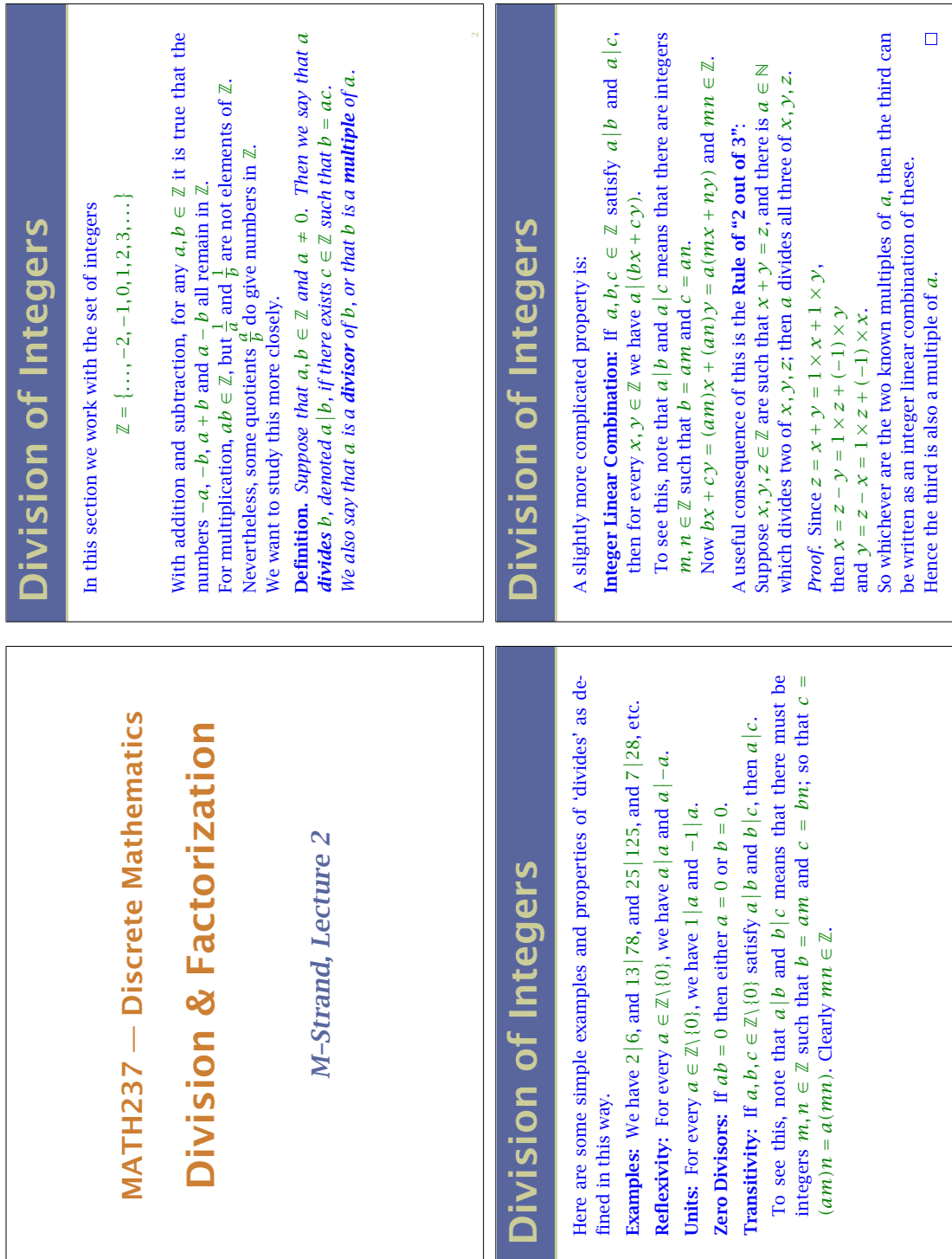
Figure 7: Lecture slides for use in mathematics teaching.