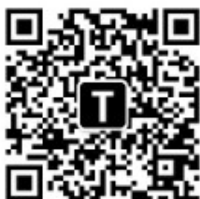
Figure 2: Wechat Public