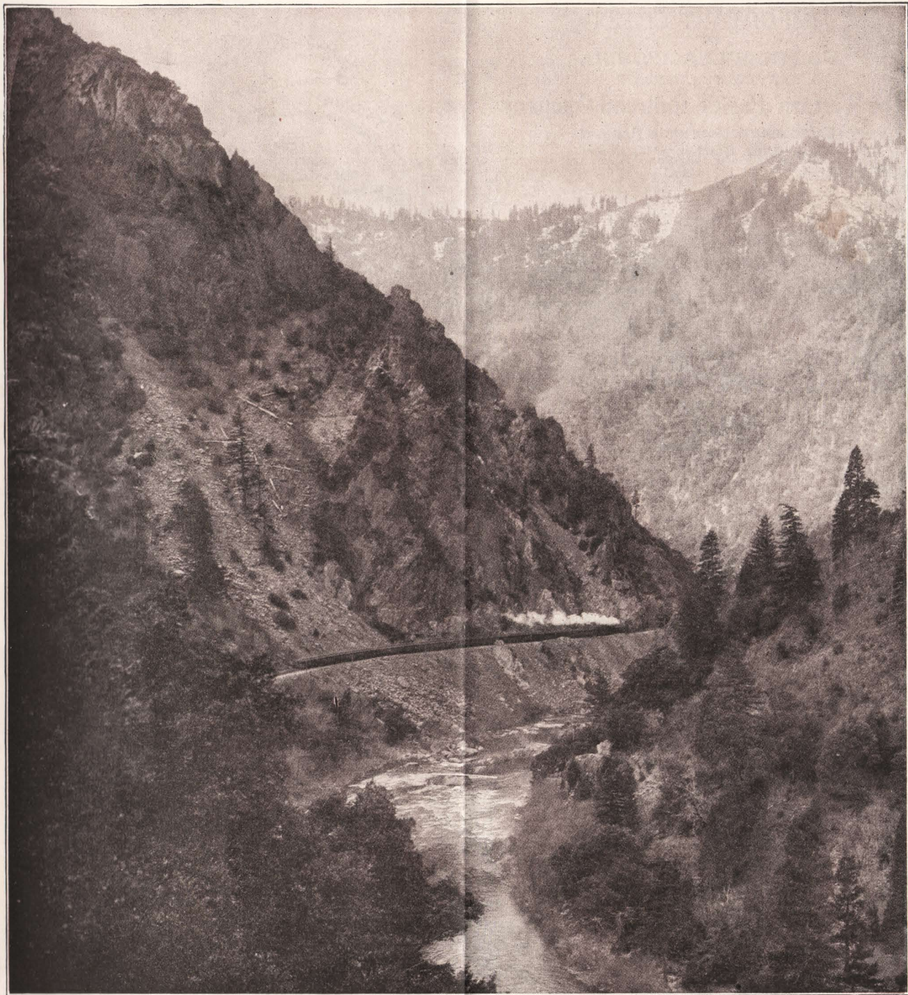
FEATHER RIVER CANYON, CALIFORNIA Over 100 Miles of Scenery Just Like This Western Pacific Railroad—Feather River Route