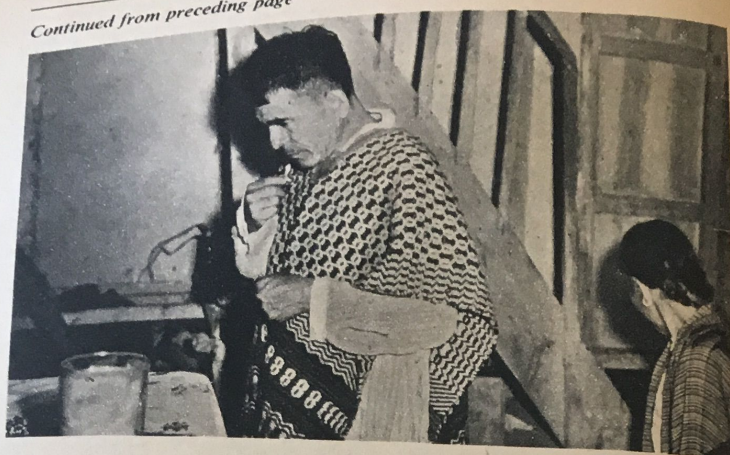
RITE: An Indian is about to "consult" a fantasy-inducing mushroom

I ATE THE SACRED MUSHROOMS Continued from preceding page