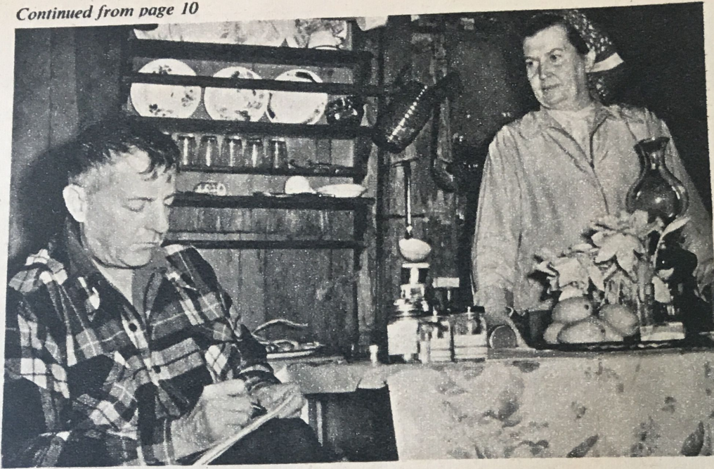
THE WASSONS: Completing their research on "sacred mushrooms" in Mexico