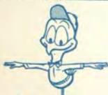
5. Unsportsmanlike Conduct