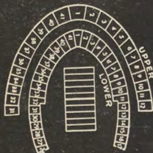
Memorial Stadium by Sections

Memorial Stadium is a double-tier horseshoe-shaped edifice seating 60,238 (after baseball season) for football. The upper deck is reached by two escalators and a series of ramps, and large, spacious promenades comfortably handle the flow of spectator traffic.