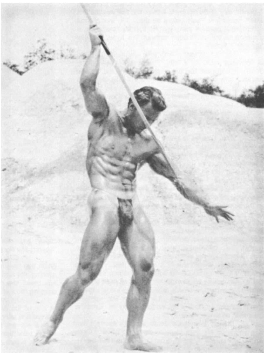
FROM THE BEGINNING, GRIMEK SEEMED TO INSTINCTIVELY KNOW HOW TO DISPLAY HIS MASSIVE BODY TO BEST ADVANTAGE.