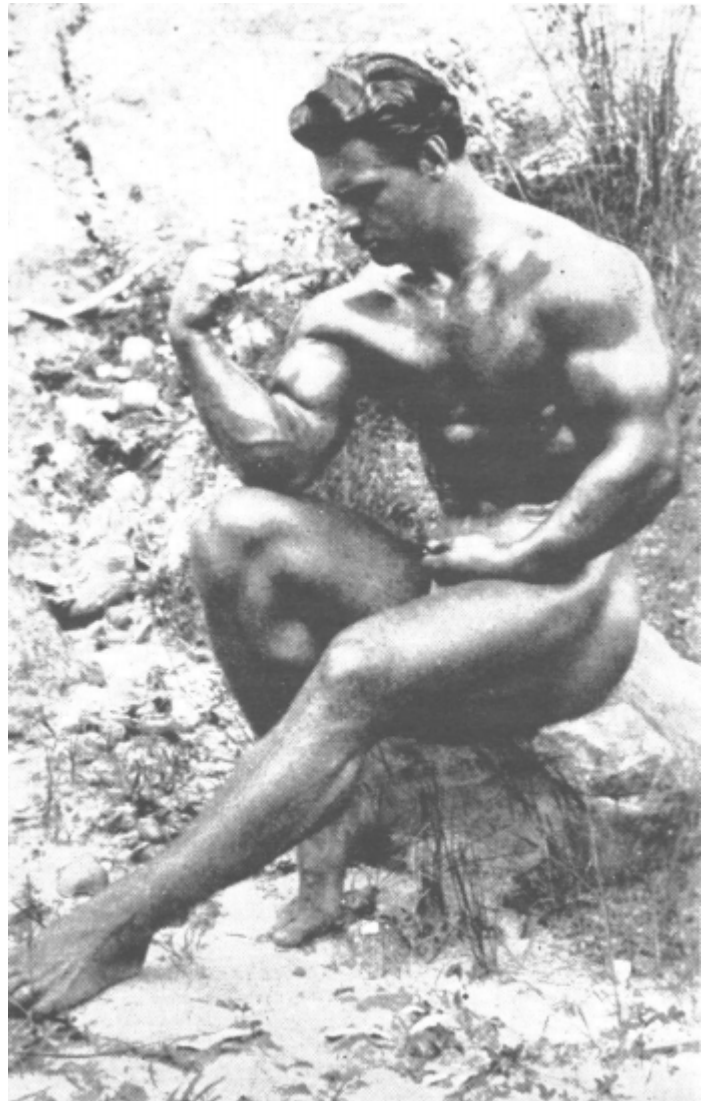
MARK BERRY PUBLISHED THIS PHOTO OF THE VERY YOUNG JOHN GRIMEK IN YOUR PHYSIQUE AND ITS CULTURE IN 1935. BERRY WROTE: "ONE OF THE BEST BUILT MEN OF ALL TIME. AN INCREASING NUMBER THINK HE IS THE BEST BUILT."