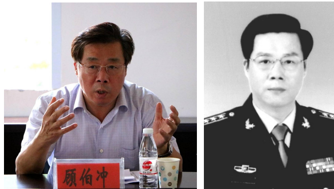
(a) As Political Security Protection Bureau deputy chief, 2020. Source: 兴仁市人民政府 . (b) As PLA senior colonel. Source: 中国作家网 .

'Law enforcement cooperation', we conclude (section 4), is a further meme providing cover for the cooption of foreign entities into the protection of the party's political security. Dropping the pretence of a 'domestic' purview, we speculate, may signal to the political protection system that its work abroad must strengthen its contribution to the global projection of CCP power.