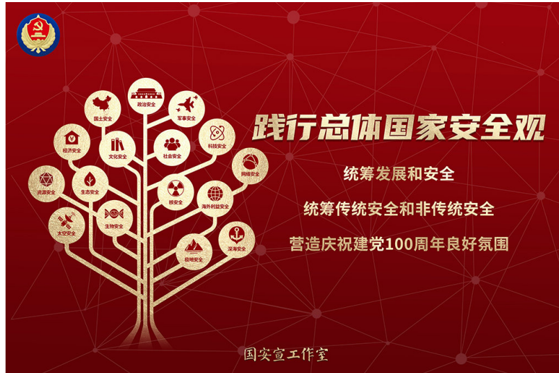
Figure 2: MSS infographic for State Security Education Day 2021. In this tree of state security, political security appears at the top, at the end of a stem from which all other securities (economic, territorial, cyber, cultural, military, nuclear...) branch out.