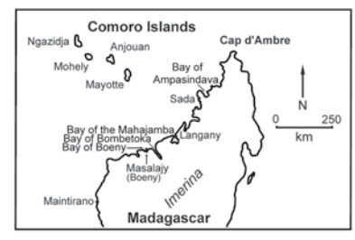
North-western Madagascar and the Comoro Islands