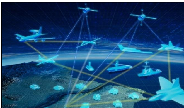
Figure 1. Visualization of JADC2 Vision