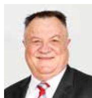
Tom Zorich Commissioner