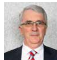
Dion McCaffrie Commissioner