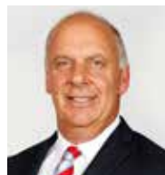
Peter Lindner Commissioner