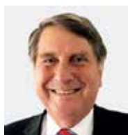
Bill Moody Commissioner