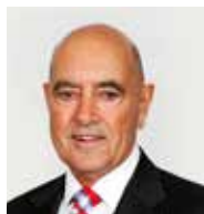
The Hon. John Olsen AO Chairman