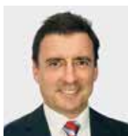
Jason Neave Commissioner