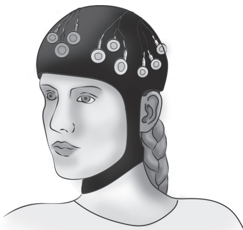
FIGURE 2. While linguistic reports remain a valuable tool in dream science, much contemporary dream research relies on the use of electroencephalography (EEG), functional magnetic resonance imaging (fMRI), and positron emission tomography (PET) to isolate the neural circuits involved in dreaming. Here, a woman wears an EEG headset in preparation for a study.

educated claims about their capacity to dream, or even from ruminating about the possible implications of this capacity for ongoing scholarly debates about animal consciousness, animal emotion, and animal ethics. 19 Indeed, throughout this book I use an integrative method to advance several such claims. In essence, this method involves: