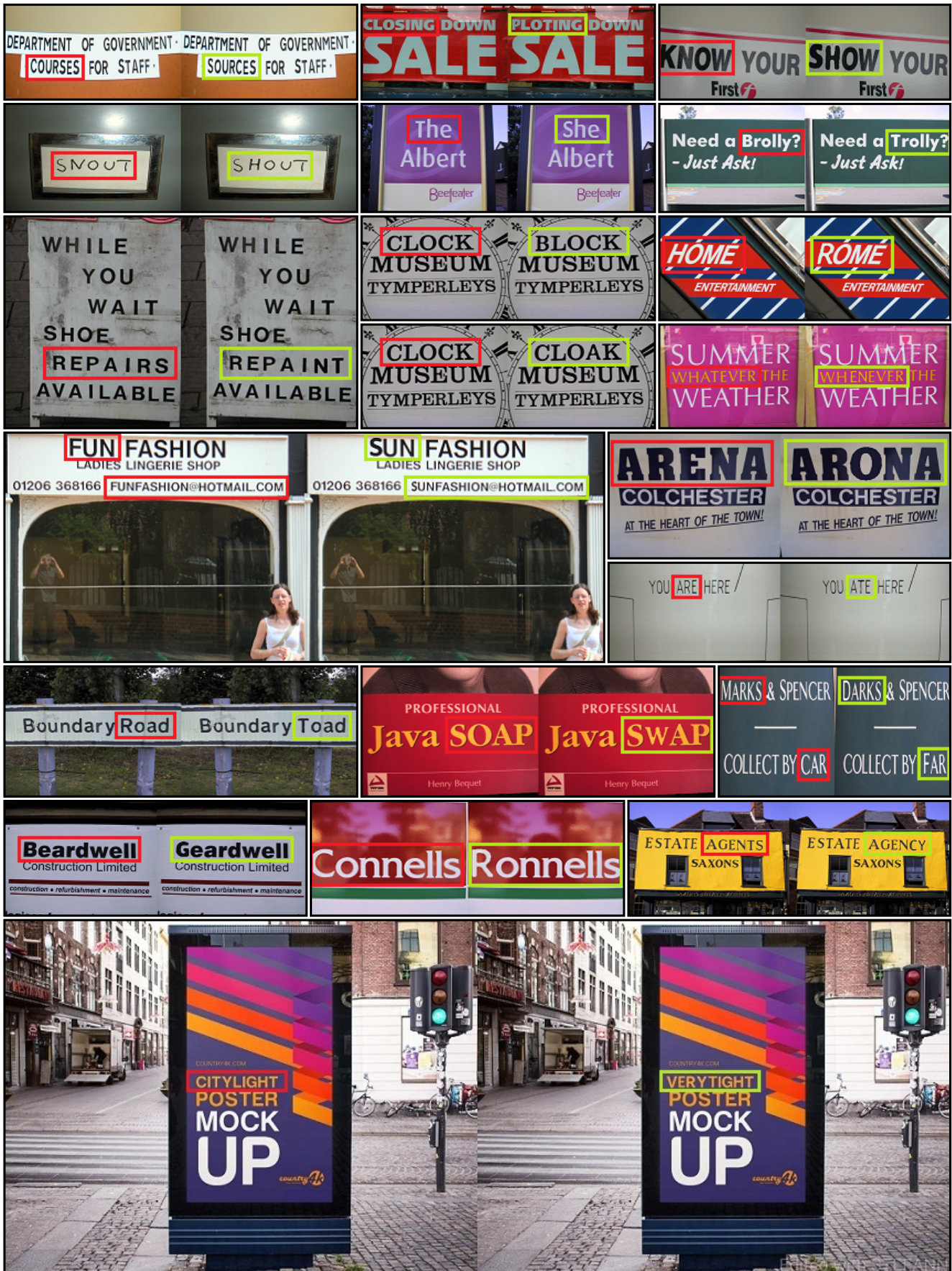
Figure 4. Editing texts in scene images with STEFANN. Left: Original images with text regions marked in red. Right: Edited images with text regions marked in green.