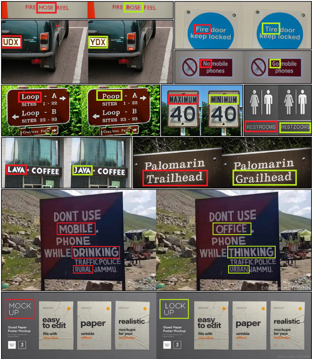
Figure 3. Editing texts in scene images with STEFANN. Left: Original images with text regions marked in red. Right: Edited images with text regions marked in green.