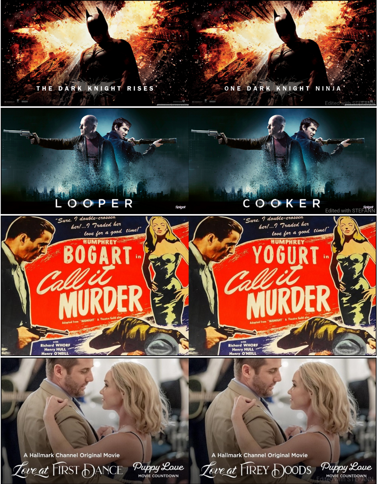
Figure 2. Editing texts in movie posters with STEFANN. Left: Original images. Right: Edited images. Text regions are intentionally left unmarked to show the visual coherence of edited texts with original texts without creating passive attention.