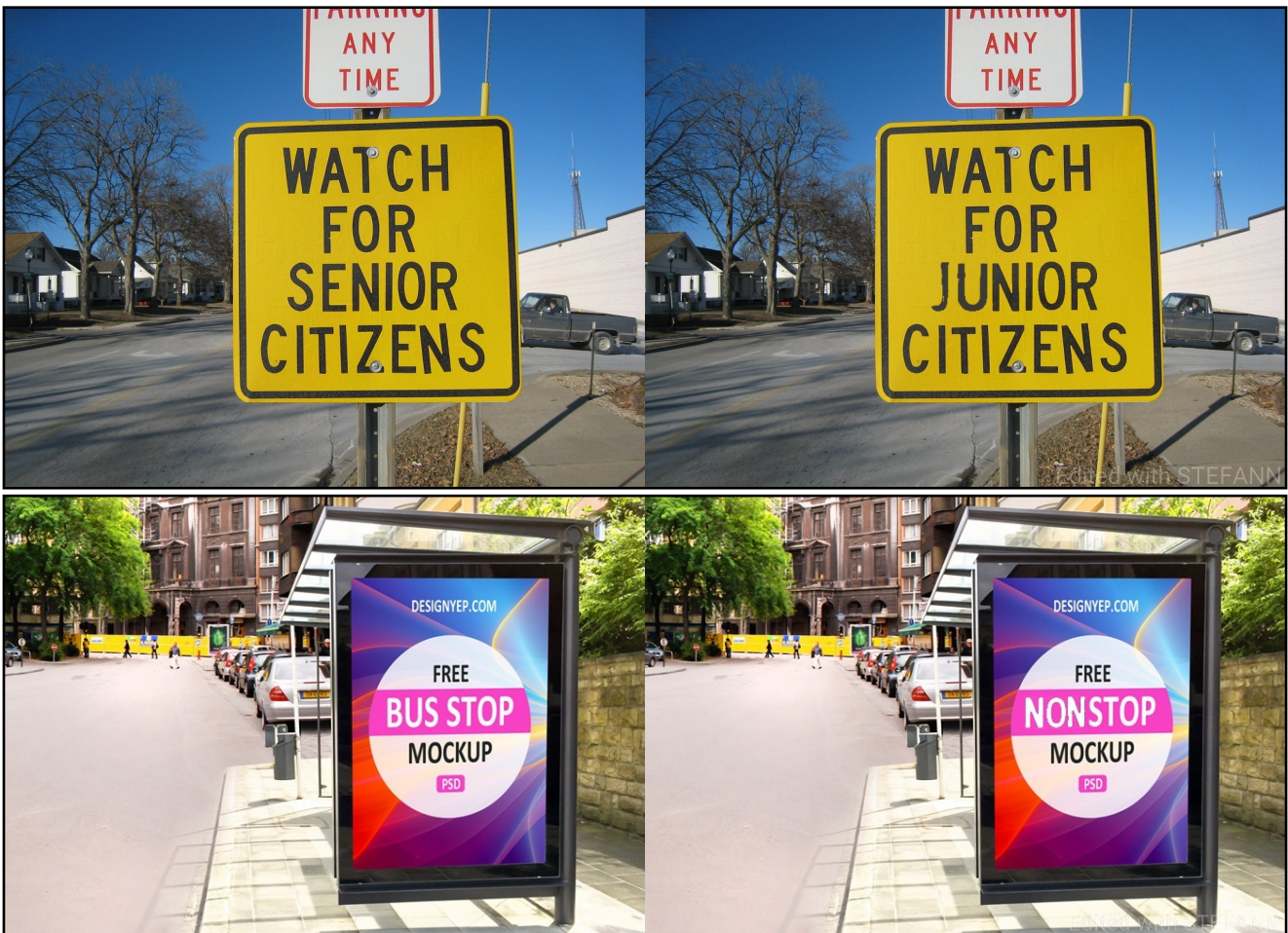
Figure 1. Editing texts in road signboards with STEFANN. Left: Original images. Right: Edited images. Text regions are intentionally left unmarked to show the visual coherence of edited texts with original texts without creating passive attention.